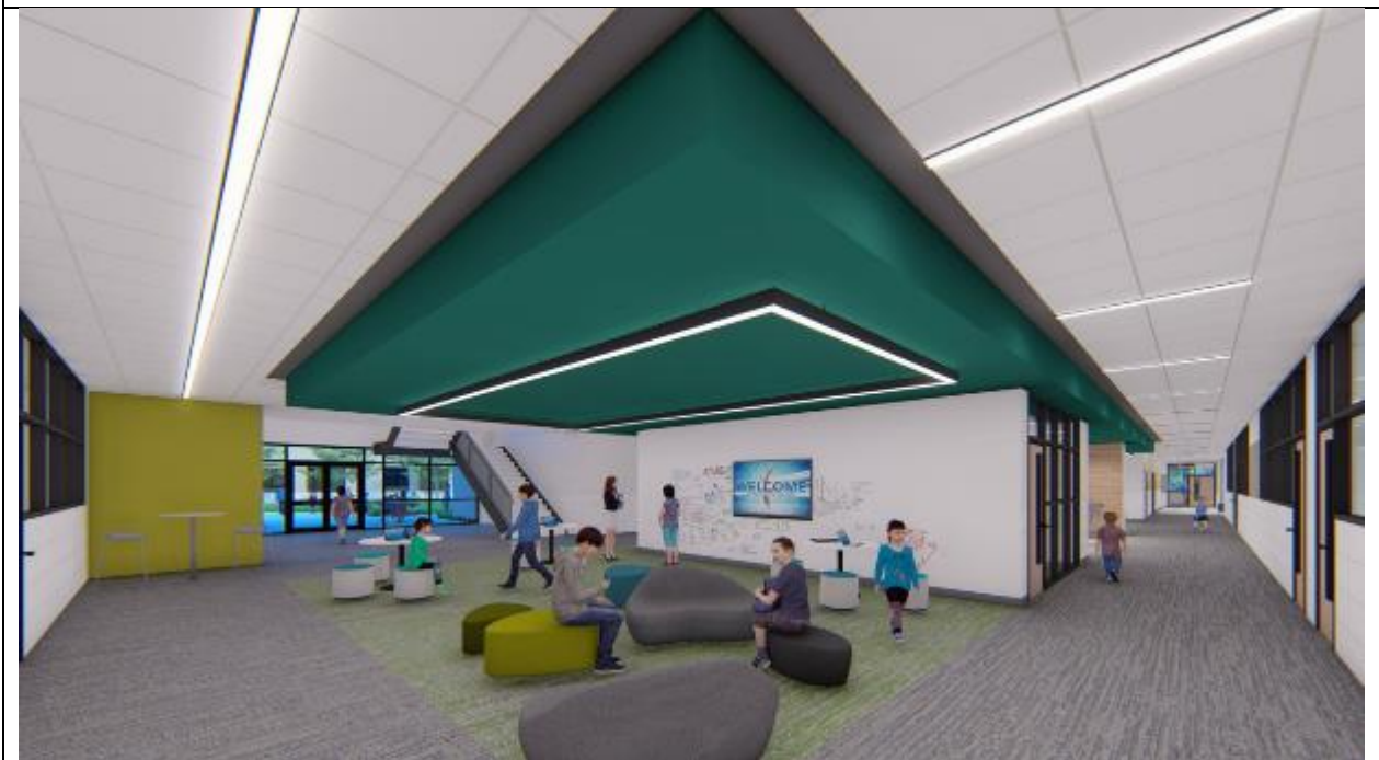
Flex space at classroom wing