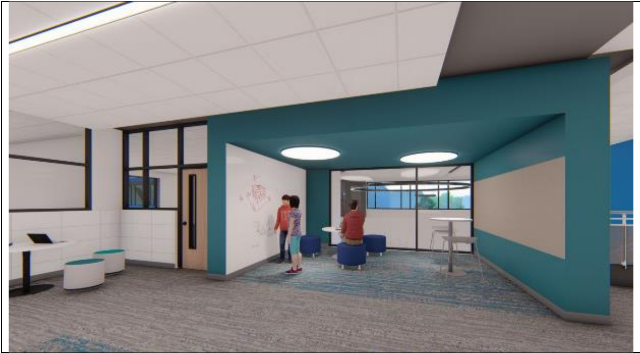
Flex space at 2 nd level corridor