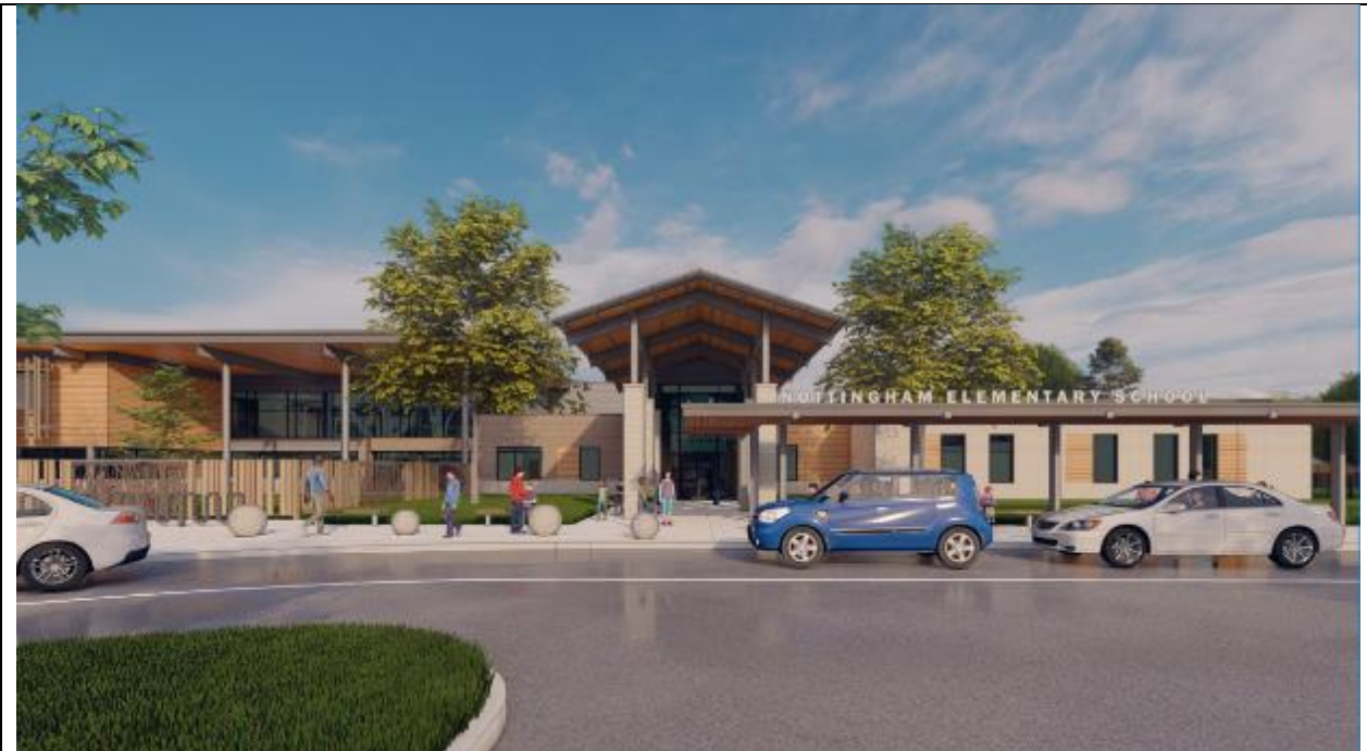
Most up to date rendering of main entry. Image presented during Finishes review.