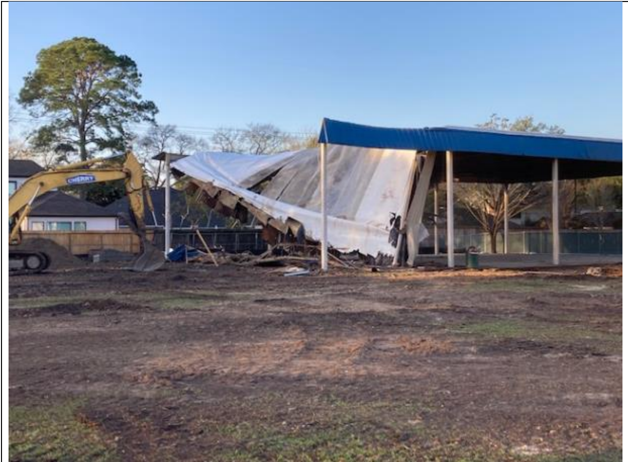
Outdoor play canopy demo.