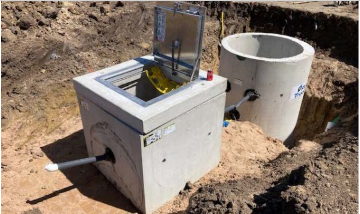
Temp. Lift station installation