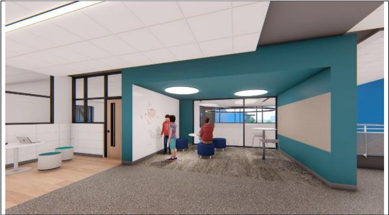
Flex space at 2 nd level corridor