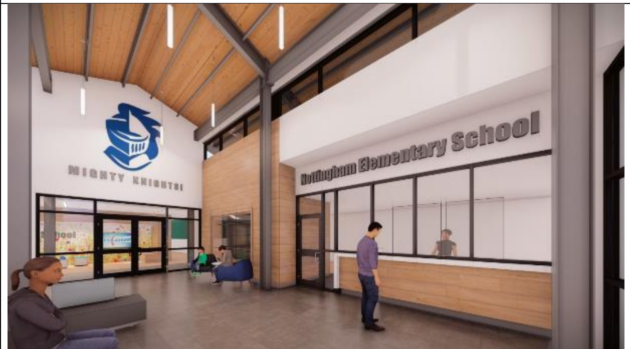
Concept image of the main entry vestibule. (PBK received comments and will revise accordingly)