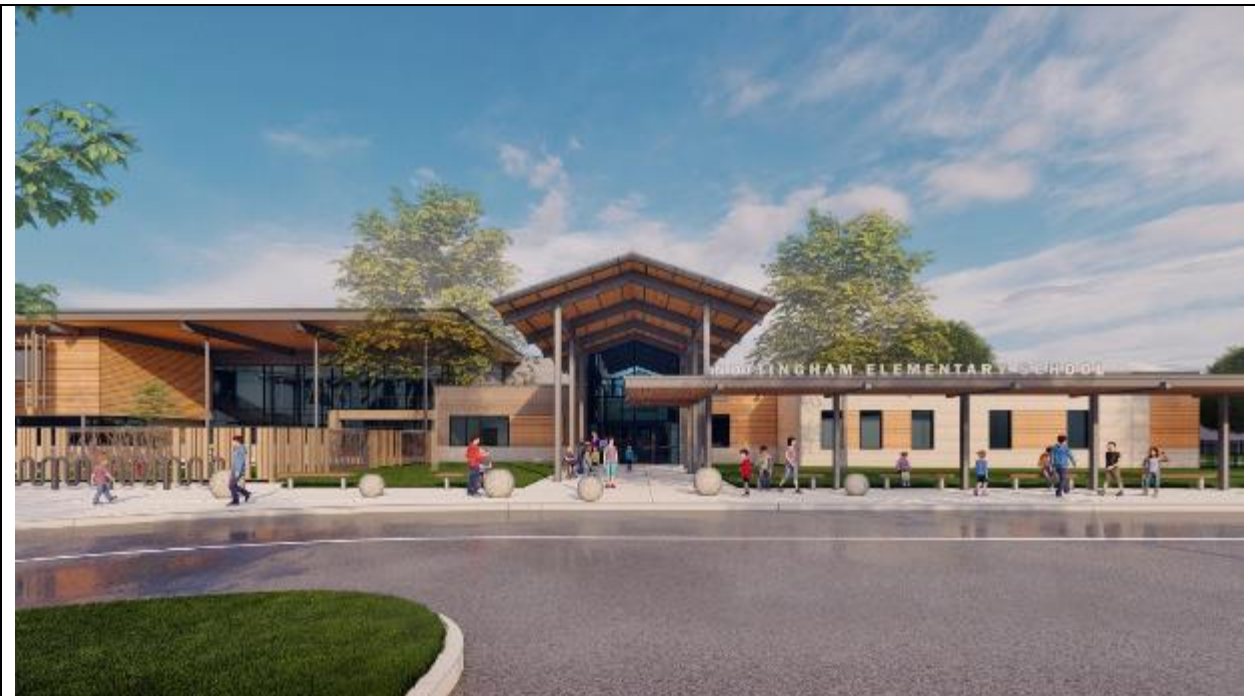
Most up to date rendering of main entry. Image presented during Architecture review