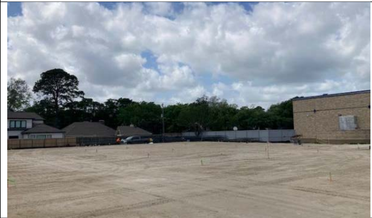
Stakes to locate piers