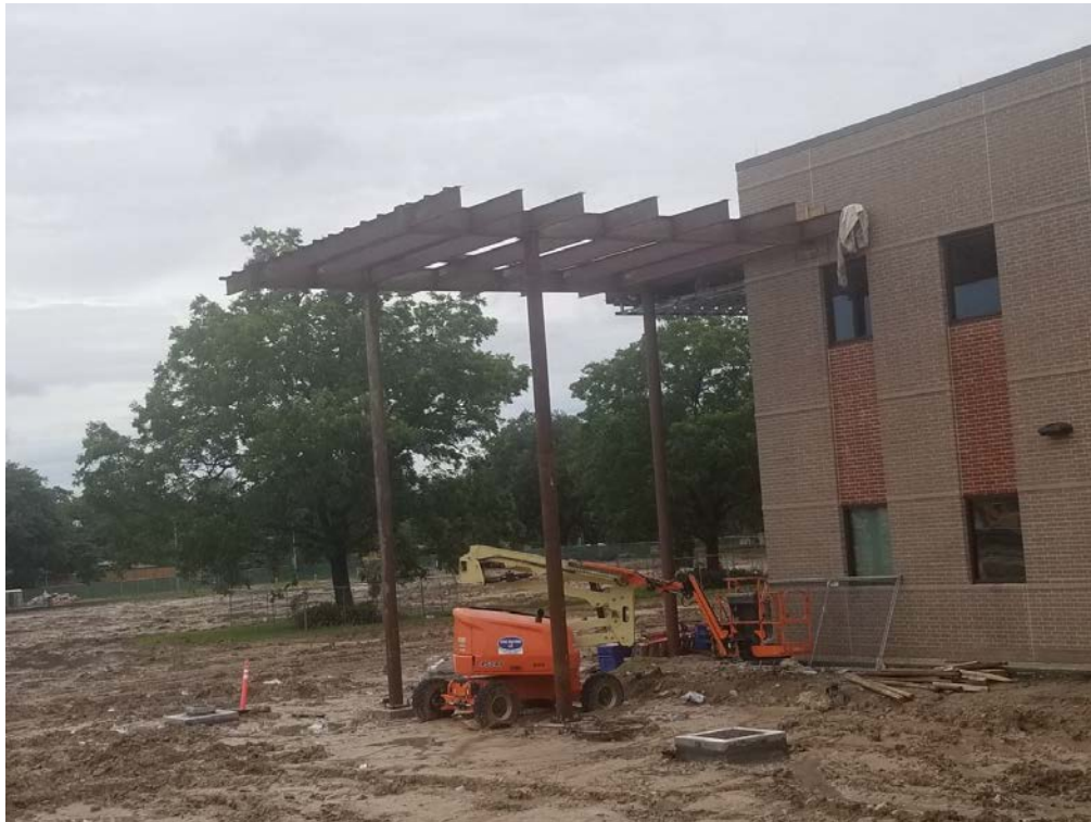
Framing final section of Entry Canopy