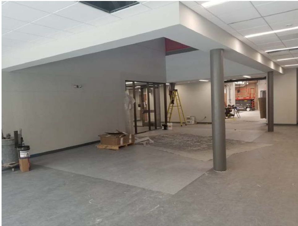
CTE Demonstration Area