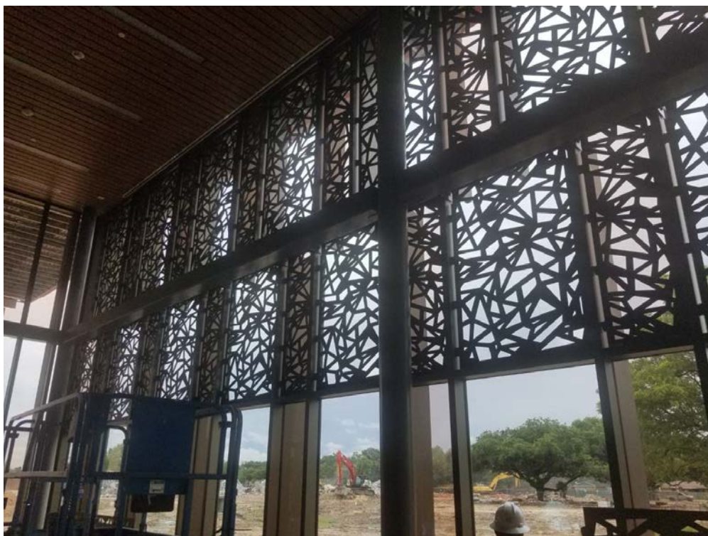
Shading device at Front Entry