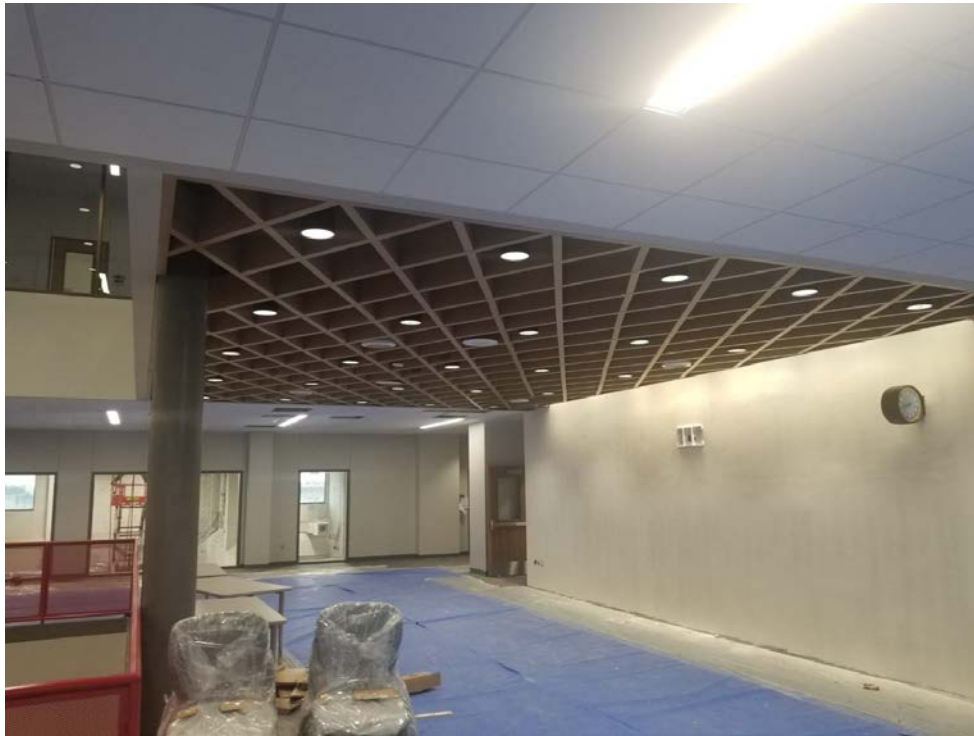
Flex Area at Science