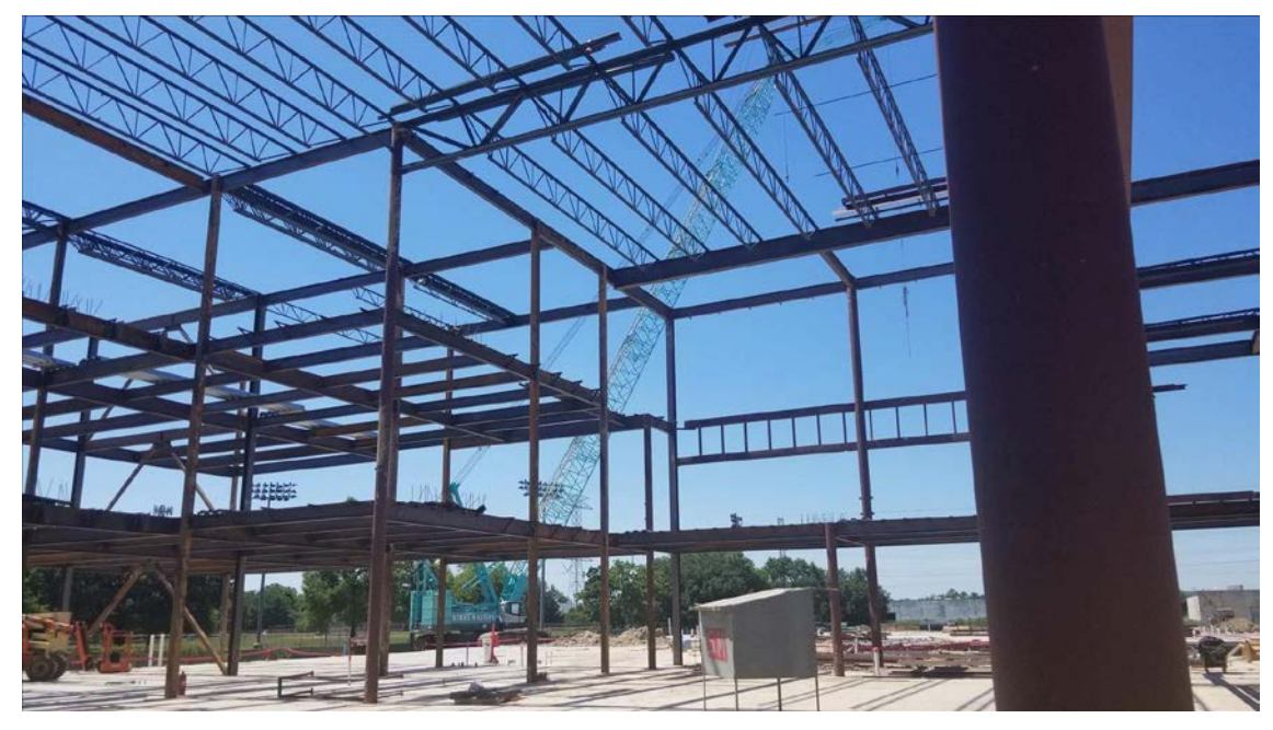
Steel Erection Area A – June 12th