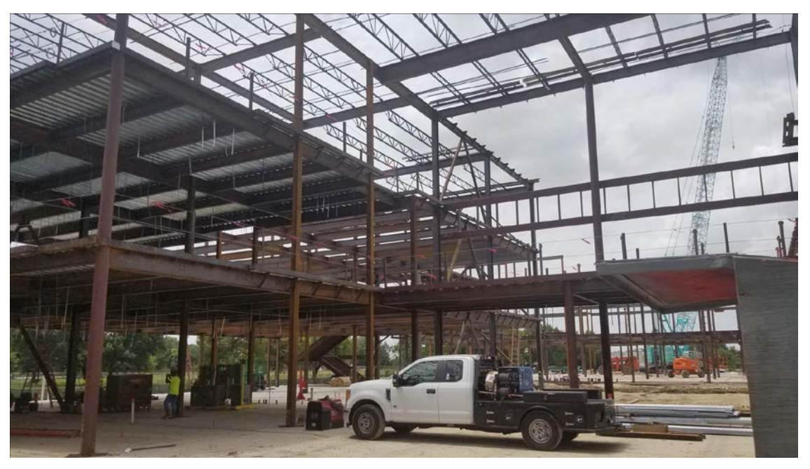
Steel Erection Area A with joists and decks, Area B and C steel beyond - June 30th