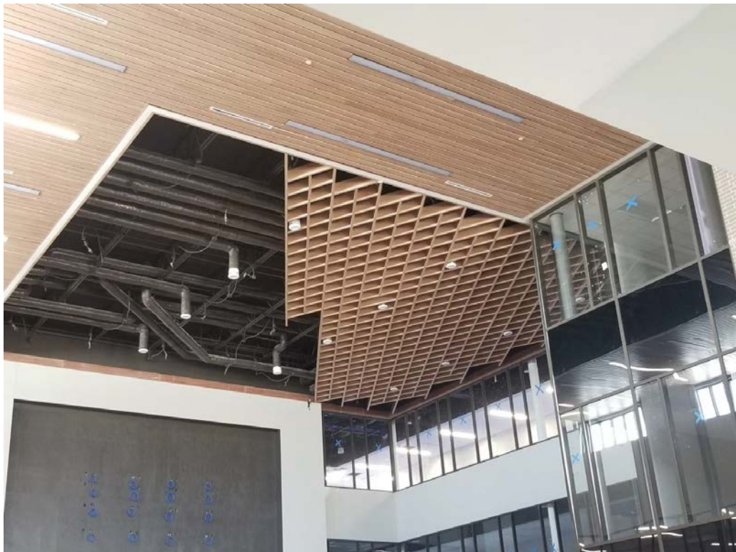
Ceiling install in Library