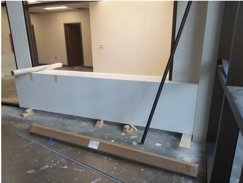
Landrum Reception Desk