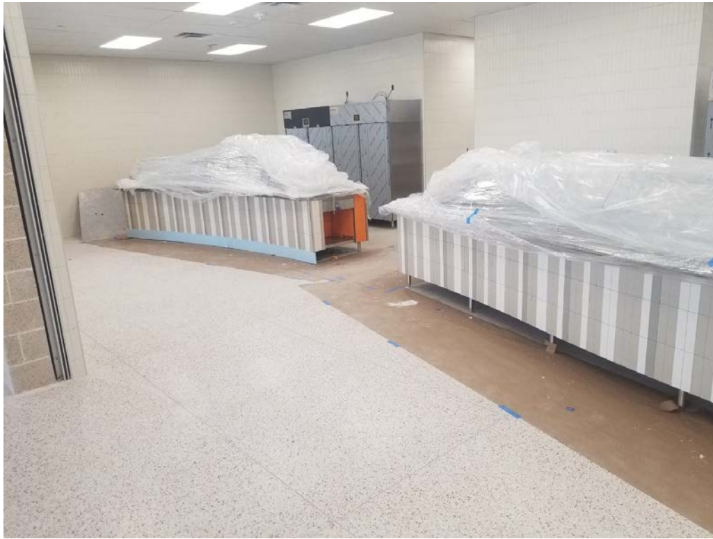
Tile installation at Kitchen Serving Lines