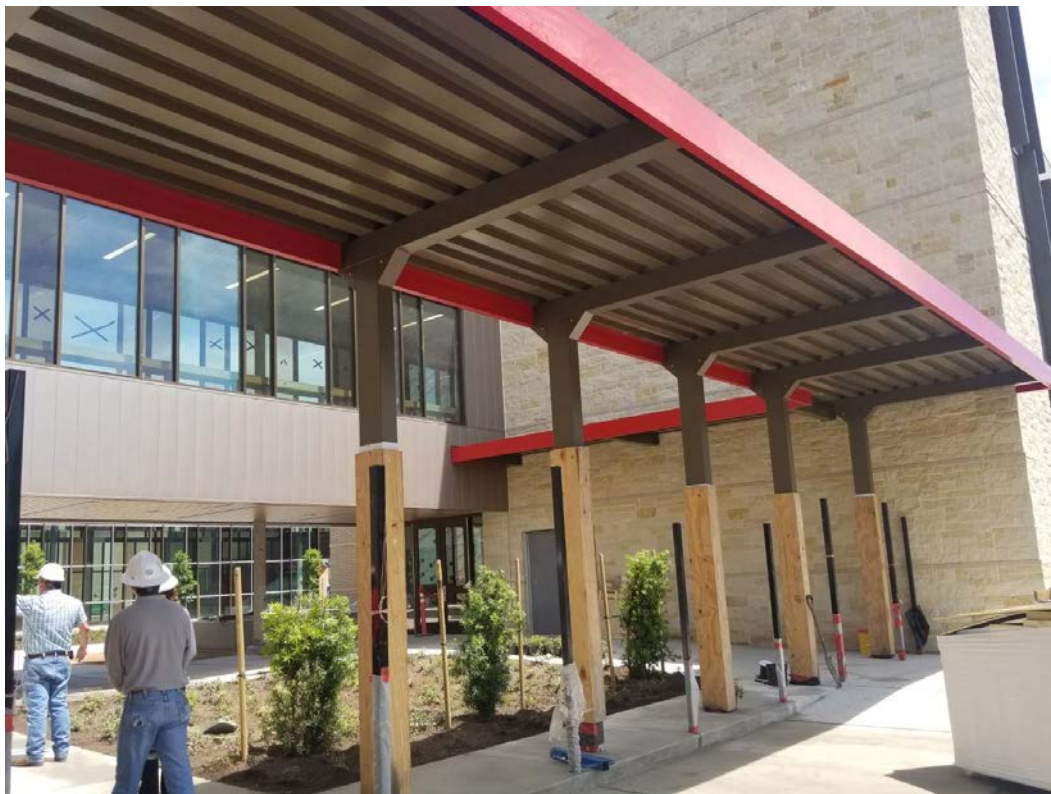
Canopy at Learning Courtyard Entry