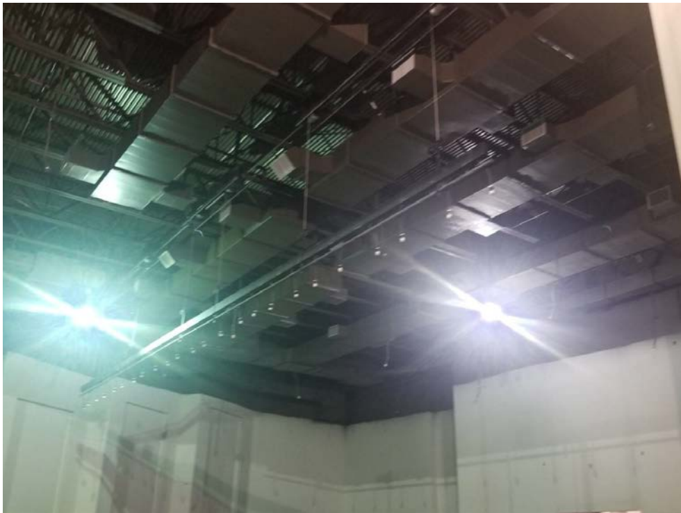
Theatrical Rigging Insall at Auditorium