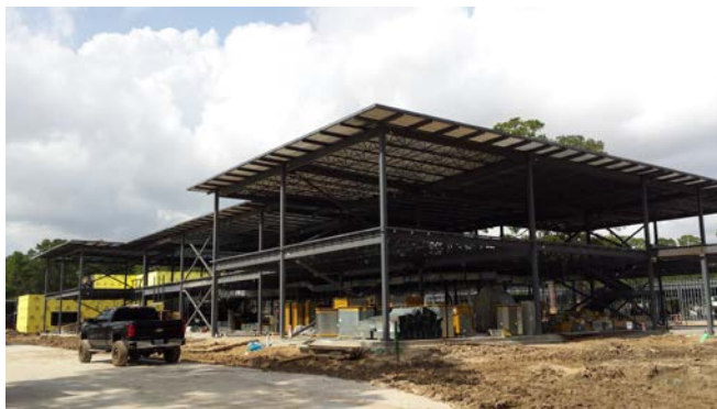
Area 'D' Progress (Area 'F' in background)