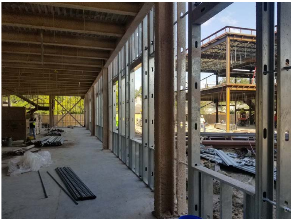
Fireproofing and Exterior Wall Framing Area B