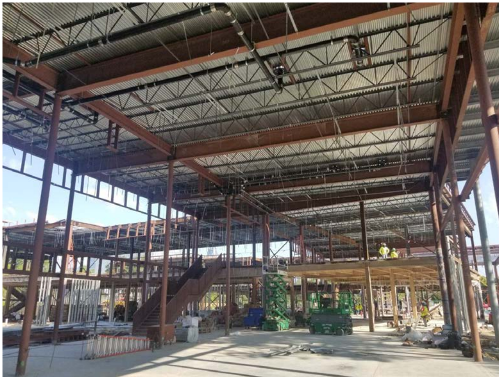
Fireproofing and Exterior Wall Framing Area B