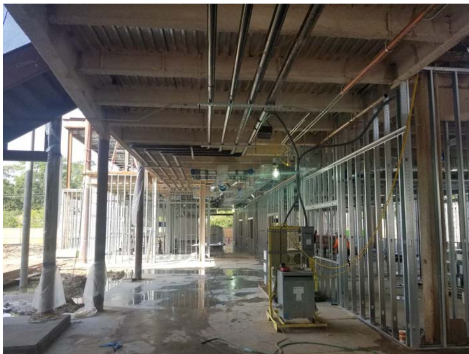
Area B Classroom Corridor