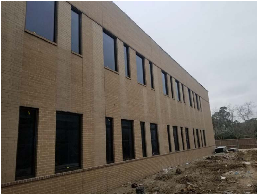
Classroom Wing Exterior Wall