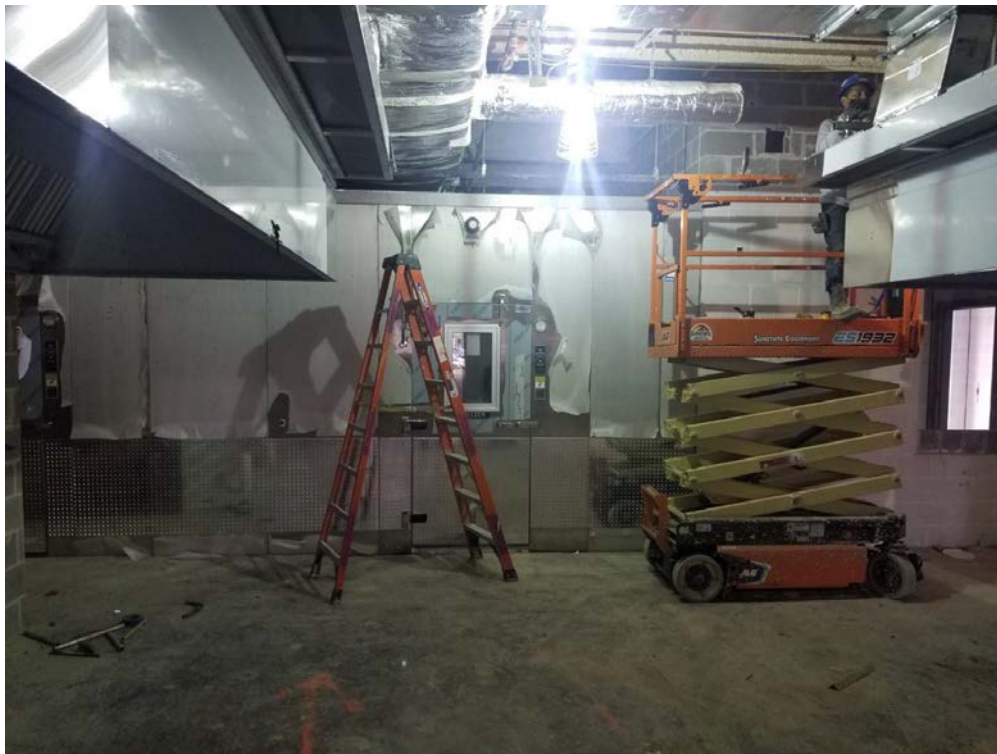
Kitchen Hoods and Walk Ins