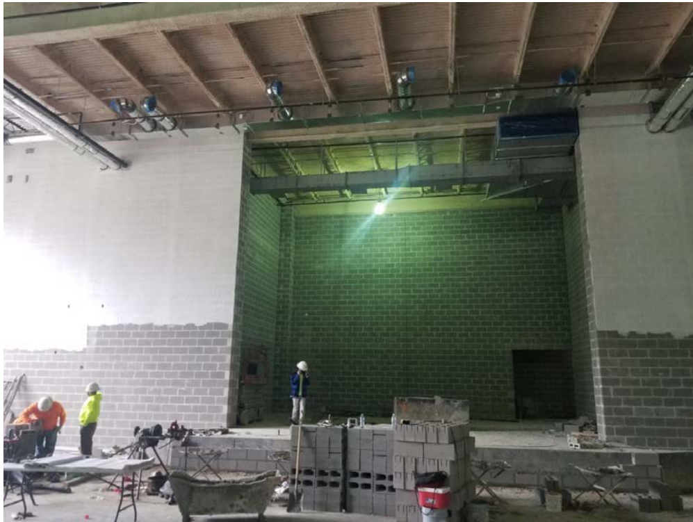
Stage at Dining