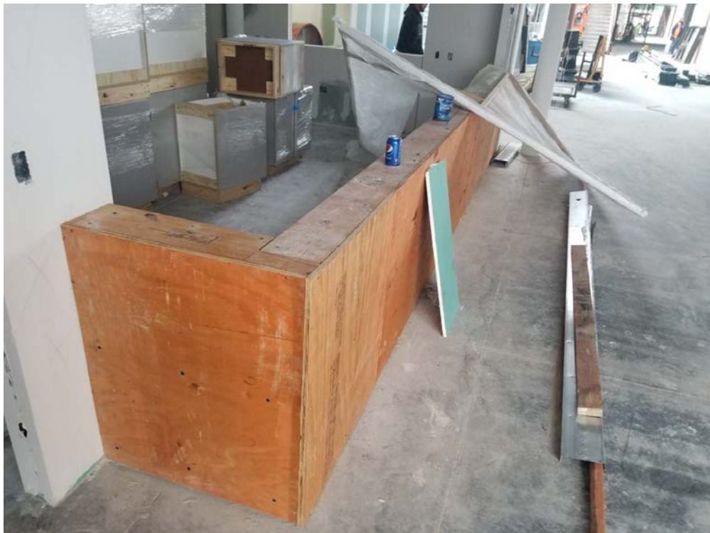
Reception Desk Framing