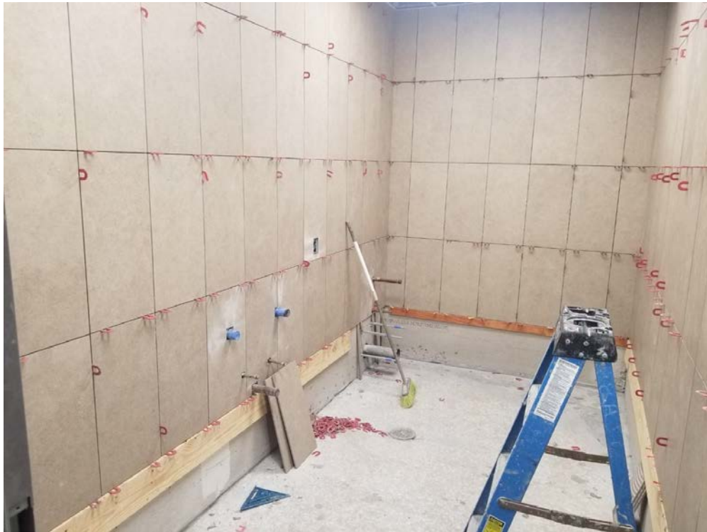
Restroom Wall Tiling