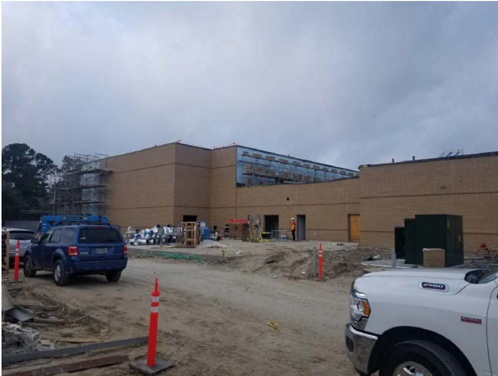
Brick at Gym and Area E East Façade