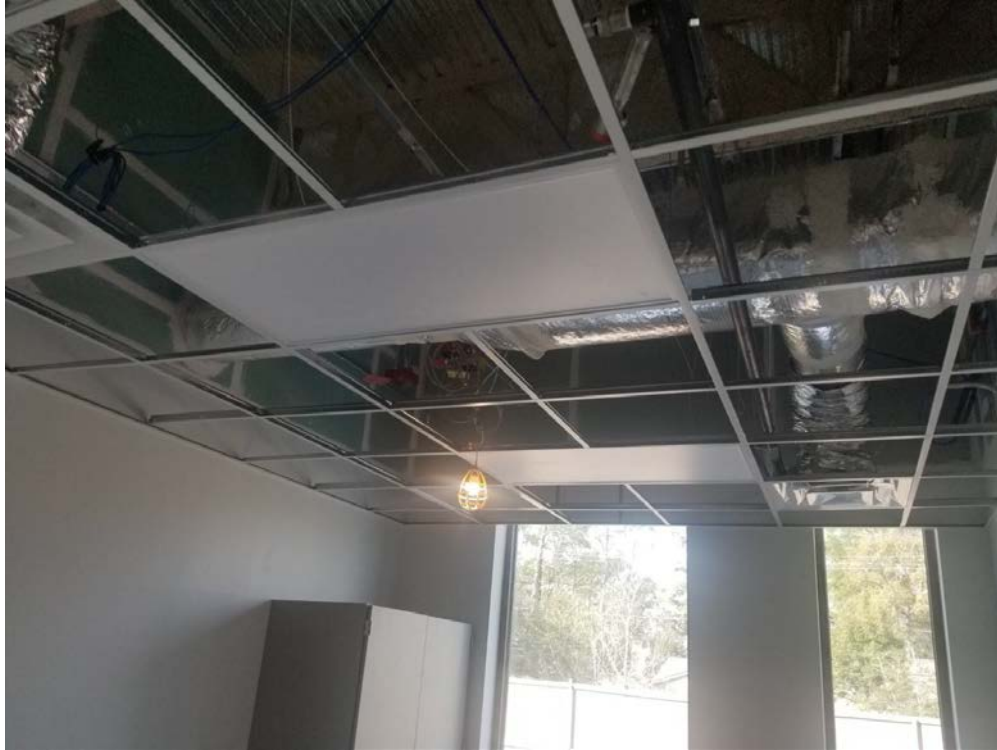
Ceiling Grid Install