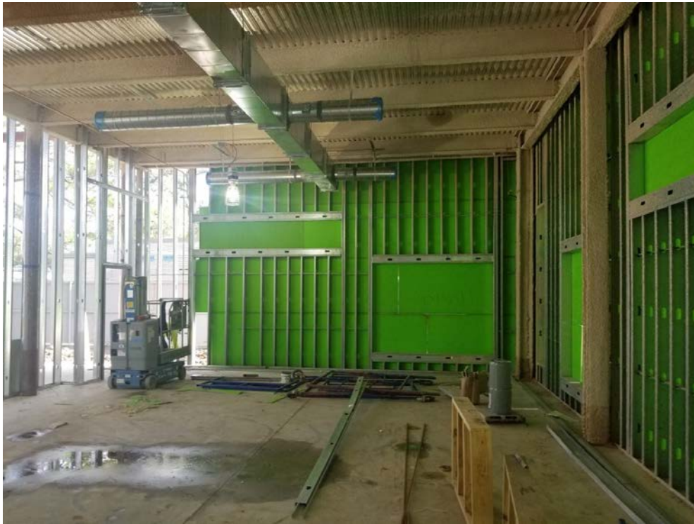
Admin Area Interior Framing

Stantec Architecture Inc. 910 Louisiana Street, Suite 2600, Houston TX 77002