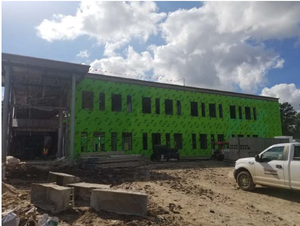
Dining/Gym from 2 nd Floor