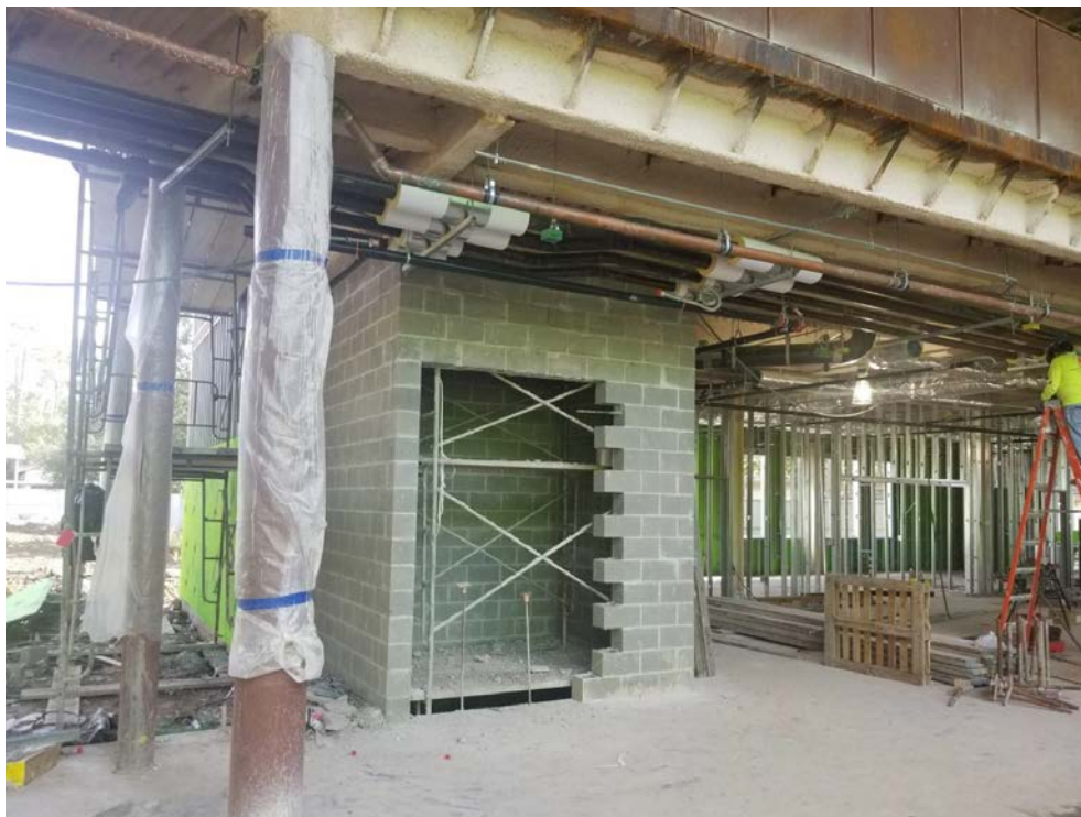
View to Art/Science Wing