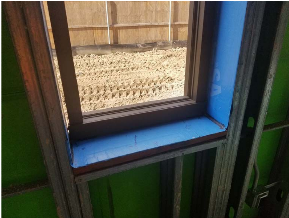
Electrical/Data Rough In