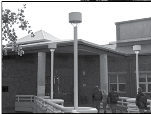
Two major roofing projects were completed this summer. Above, is the finished product at Westgate Elementary in Edmonds. To the left, students enter a newly-roofed Mountlake Terrace High School.