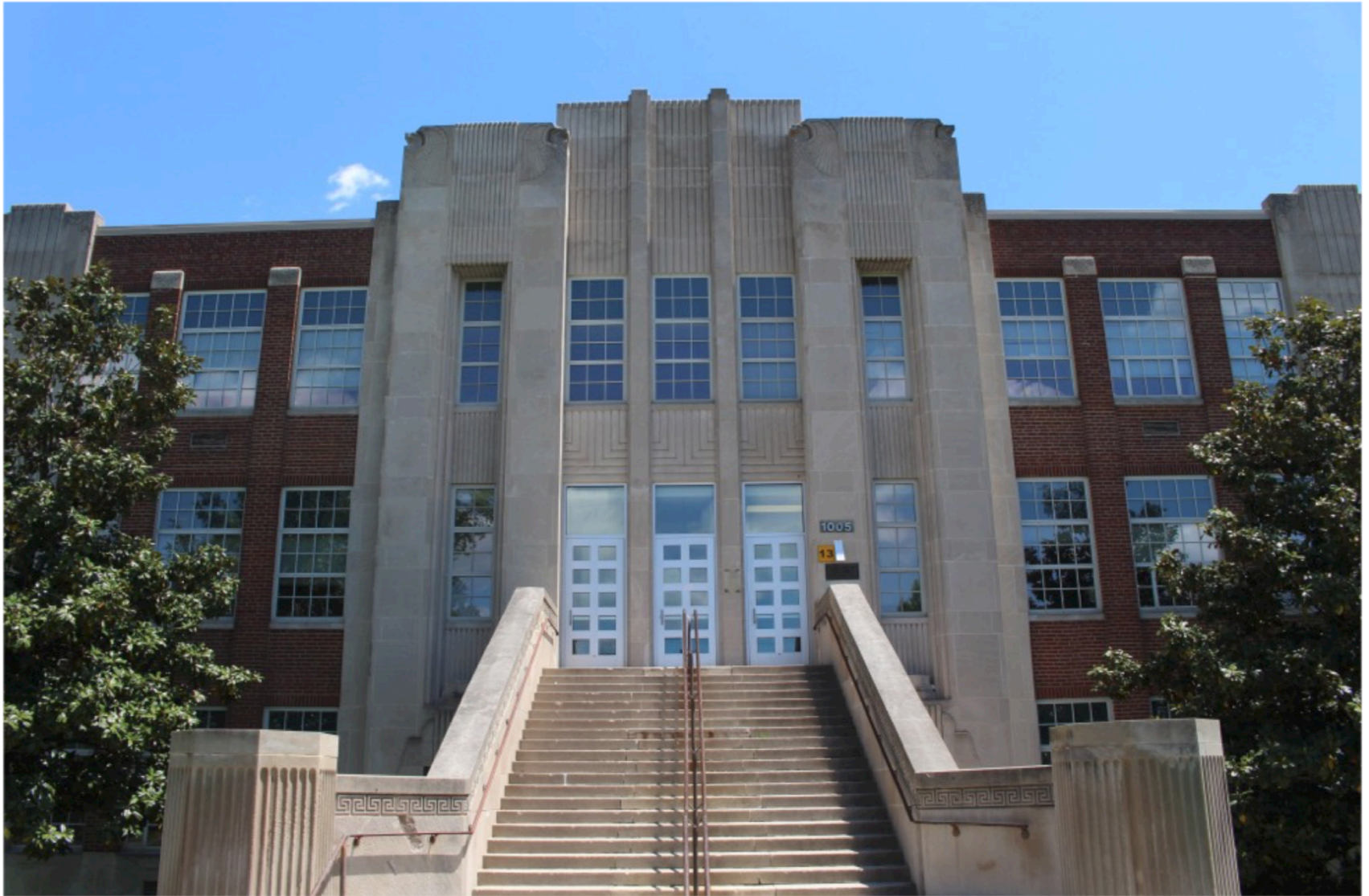
G.W. MIDDLE SCHOOL PBIS COOL TOOLS