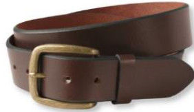
Black or Brown Belt