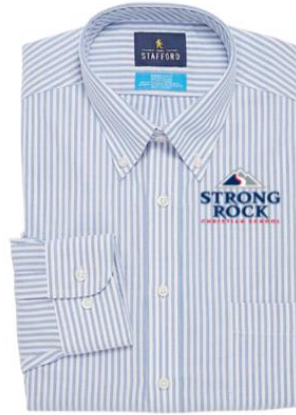
*Long Sleeve w/ Mtn. Logo *Short Sleeve w/ Mtn. Logo