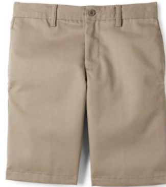
Plain Front Chino Shorts