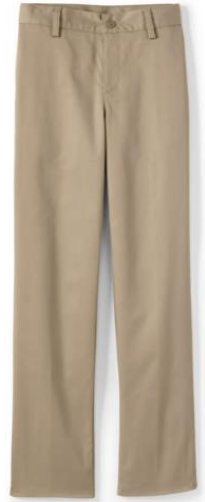
Plain Front Chino Pants