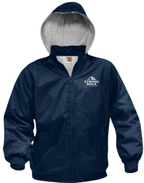
Navy Hooded Rain Jacket (Elementary -Youth sizes)