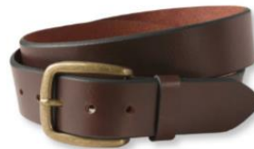
Black or Brown Belt