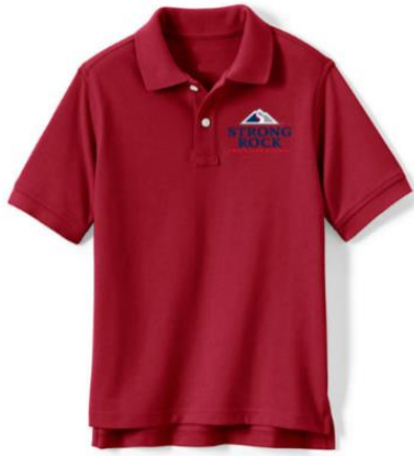
Short Sleeve Polo Shirt