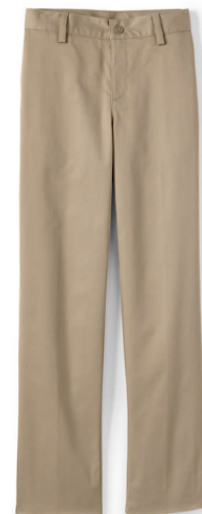
Plain Front Chino Pants