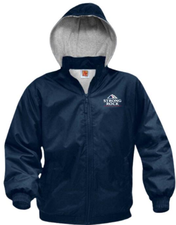
Navy Hooded Rain Jacket (Elementary -Youth sizes)