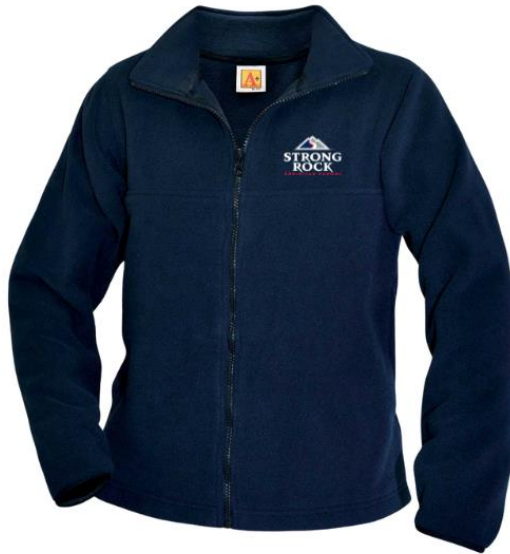
Navy Fleece Full-Zip