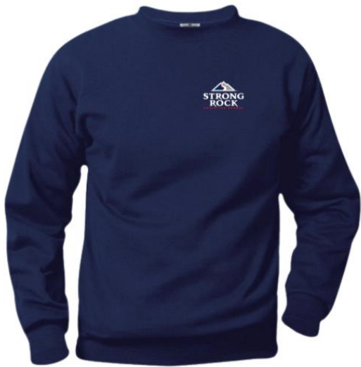
Navy Crew Neck Sweatshirt