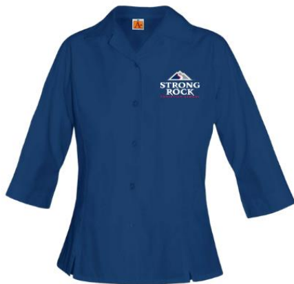
3/4 Sleeve w/ Mtn. Logo