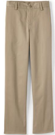
Plain Front Chino Pants