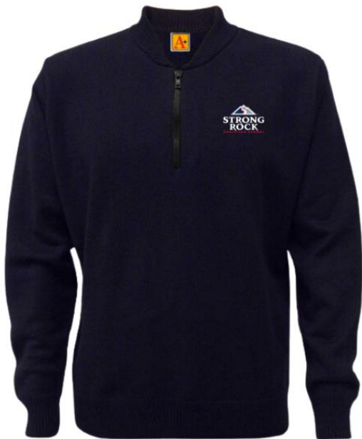
Navy Quarter Zip Sweater