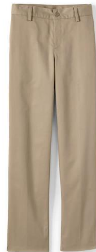
Plain Front Chino Pants