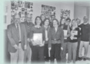
AHS members stand with Leighton School 4th grade teachers after the book presentation.