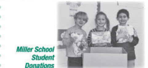
Miller School Student Donations