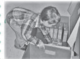
Miller School Pre-School Thanksgiving Feast

Our PTO also once again sponsored our Giving Tree Project where they partner with Family and Community Services of Portage County to provide donated items for holiday distribution.