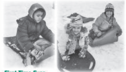
First Time Ever Sledding!