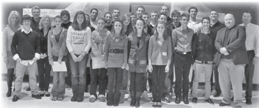
Fall Athletes Recognized by Aurora Board of Education