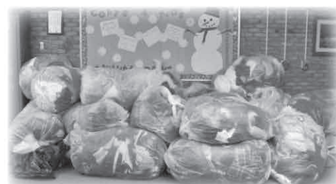
Coats for Kids