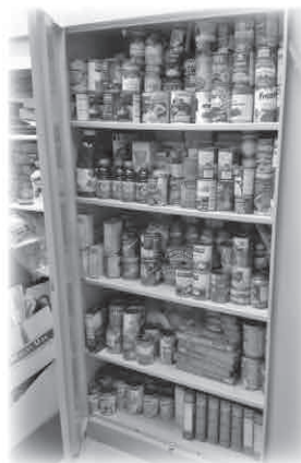
Backpack Food Pantry

back included a Coats for Kids drive at Harmon School that acquired approximately 1,800 coats, a high school SADD sponsored dodge ball tournament that raised funds for the USO and Camp Sunshine, Shop With A Cop activities, Leighton School's "Flurry of Gifts" campaign that filled 300 gift tags, Craddock School's distribution of holiday back packs and Farmhouse Feasts to those in need, and so many other ways such wonderful generosity was shown. Thank you to all for making the holidays brighter!