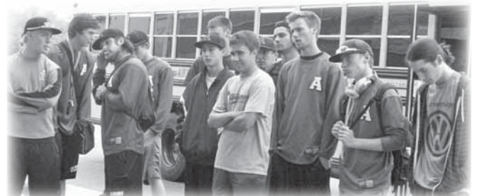
Baseball team packed and ready to go to their school history making State Final Four game.

The Aurora Greenmen Varsity Baseball Team had an extremely exciting season and made school history by becoming the first Aurora High School