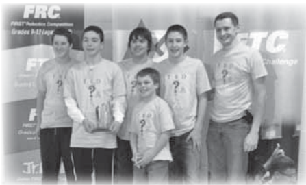
Leighton School's Robotics Team

The LEIGHTON SCHOOL'S ROBOTICS TEAM finished their season by winning the Motivate Award. Great job!