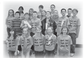
Math 24 Competition Team Members

On February 12, 2013, Aurora City School's top math students competed in the Portage County Educational Service Center Math 24 Competition .