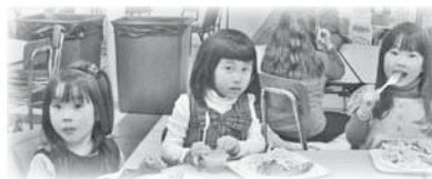
Caught enjoying the fish fry.