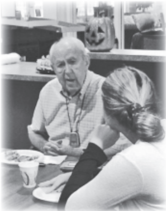
Hook enjoyed lunch with the AHS French students