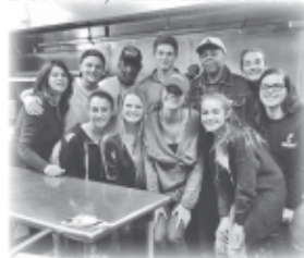
The SERVICE LEARNING CLASS visited the LAKESIDE MEN'S HOMELESS SHELTER in Cleveland