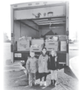
Miller/Craddock School Giving Tree Truck Loaded Up