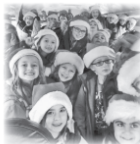
Antlers Vs. Santa Hats Bus Competition ~ Bus #16