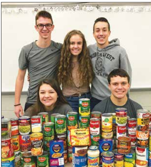
National Honor Society sponsored a food drive.