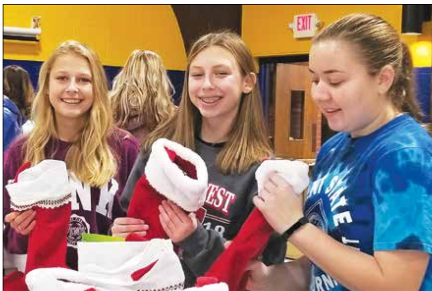
Students sort groceries and presents as part of the Santa Project.

Northwest students throughout the district share an attitude of gratitude, giving back to the community in a variety of ways throughout the school year. Recently, their efforts ranged from food drives and blood donations to fundraisers and teddy bear drives. Interact, a service organization at the high school, was formed solely for the purpose of giving. In addition to the value of education, students in the district definitely learn the value of generosity and volunteerism as well.