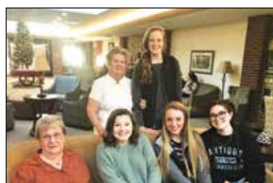
Social Justice/Leadership students (two photos directly above and one below) brought cards and cookies, and enjoyed games with Chapel Hill residents.