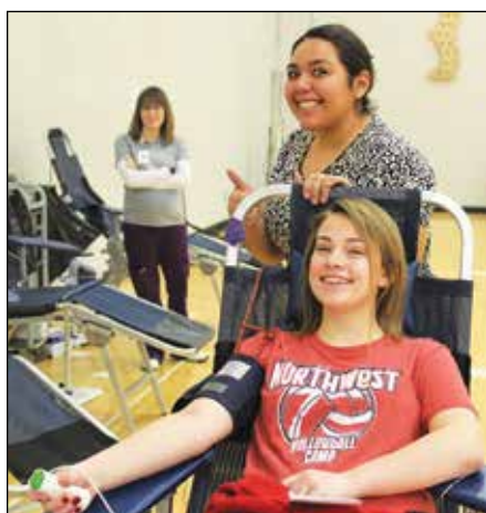
Student Council organizes two blood drives each year.