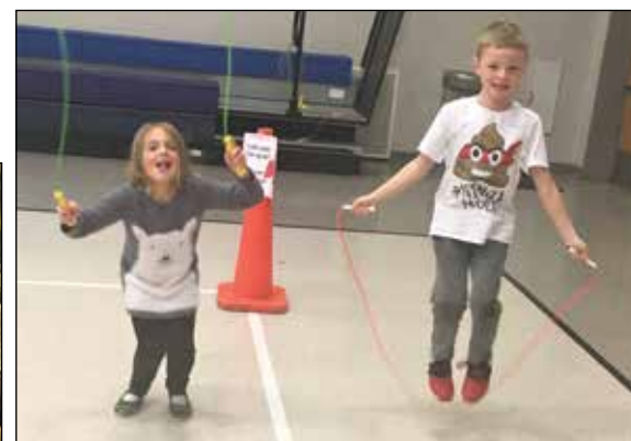
Each year all NWP students participate in jumping stations during physical education class. First grade students raised money for the American Heart Association in the annual Jump Rope for Heart/Kids Heart Challenge.