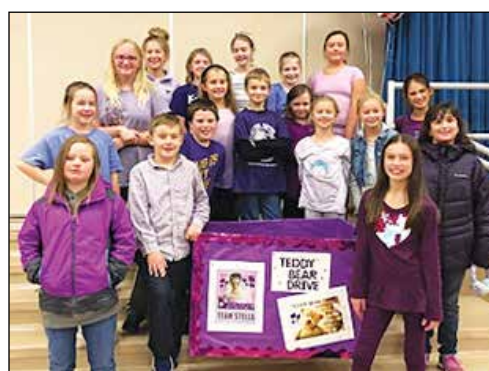
Stinson students donated over 300 stuffed animals to Akron Children's Hospital.