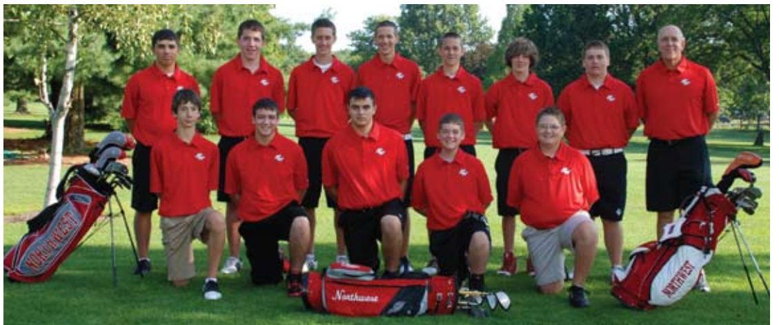
NBC Crown Winners