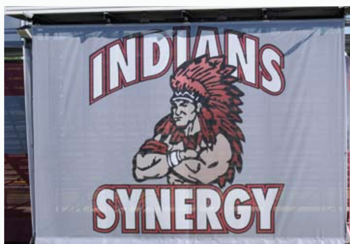
Indians Synergy Bleacher Jersey