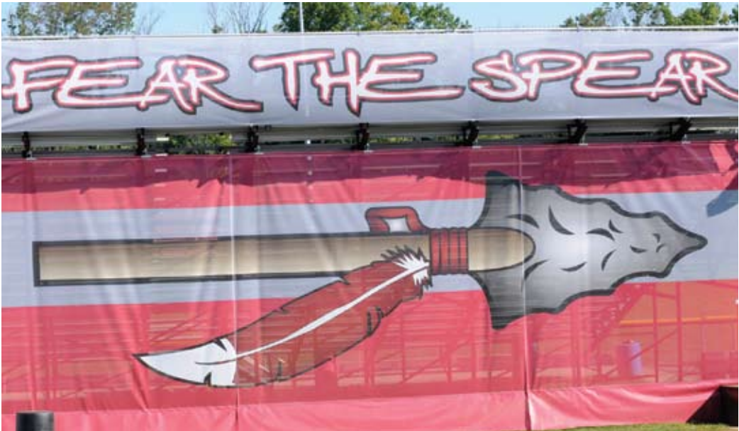
Fear The Spear Bleacher Jersey