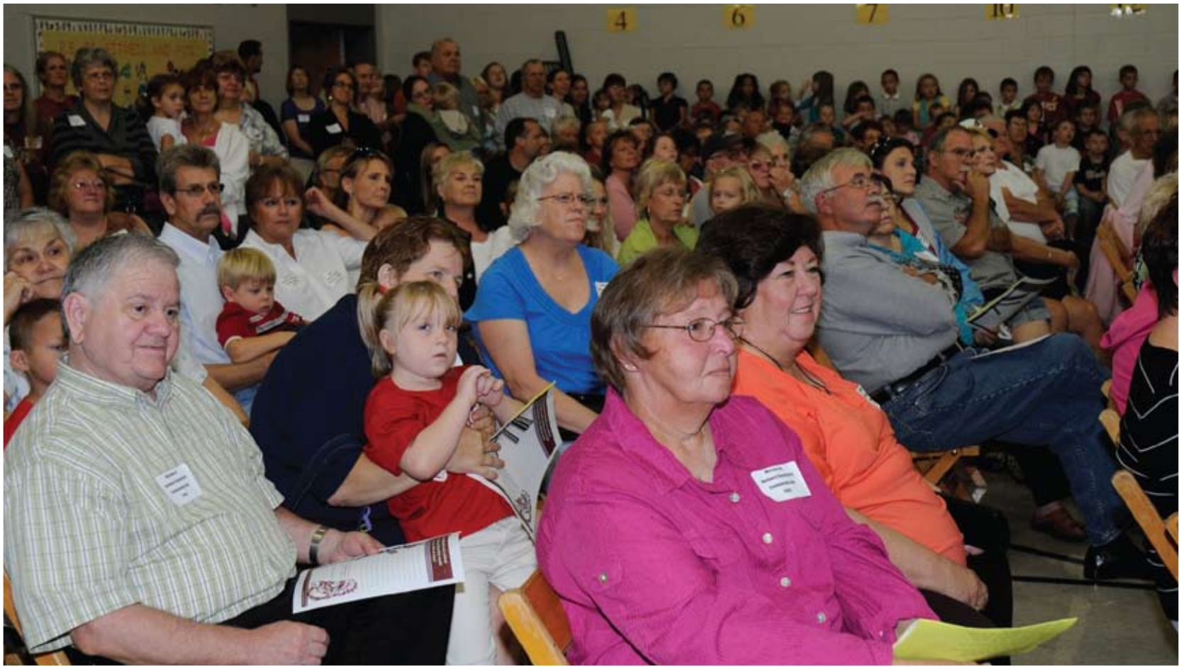
Guests at Northwest Elementary