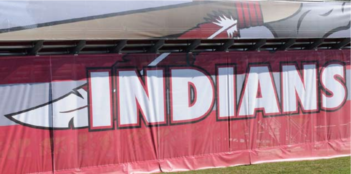
Indians Bleacher Jersey