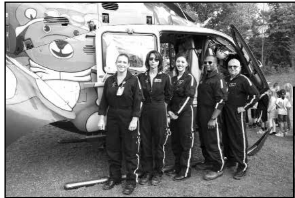
Crew of Akron Children's Hospital helicopter

Crew members of Ohio's first and only pediatric-dedicated transport helicopter visited Northwest Primary School recently to share their story with the students. "Air Bear" is part of the Akron Children's Hospital.