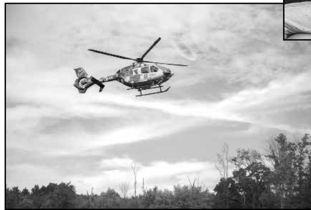
Akron Children's Hospital Helicopter