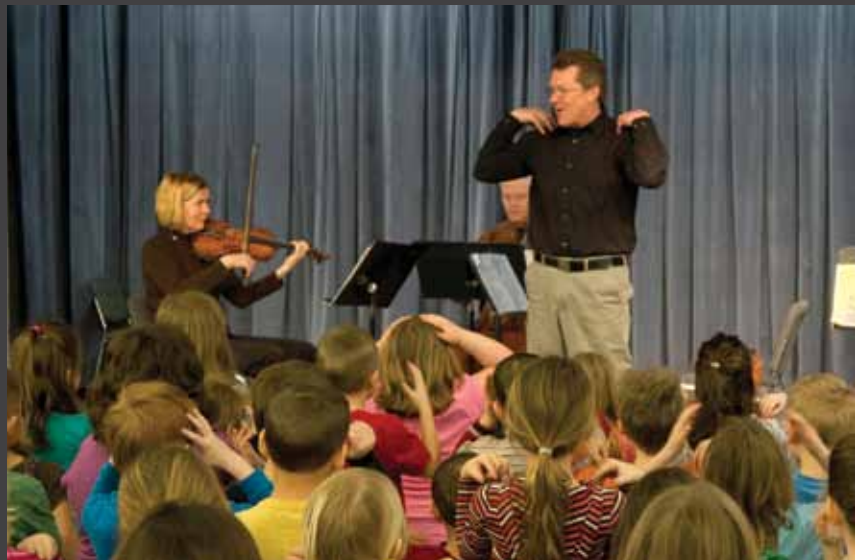
Canton Symphony Musician Leads Primary Students

The String Trio of “SymphonyLand” performed for the children of Northwest Primary on January 31, introducing students to the world of the symphony in a fun, an interactive and a musical way. Students learned about the violin, cello and viola, and had an opportunity to listen to each instrument played separately as well as together. The performance, one of the many programs offered by the Canton Symphony, is a part of the ongoing Arts Series in the Northwest Local School District.