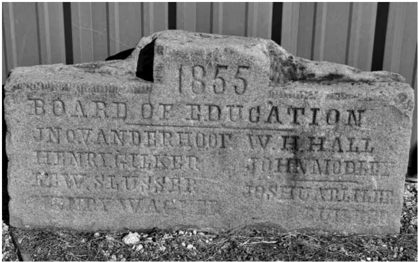
1855 Cornerstone of Canal Fulton School