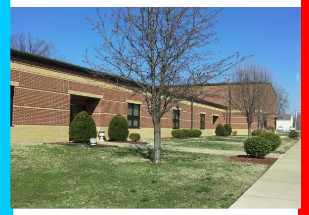
Successful-Now and Beyond Learners for Life

Calloway County Alternative Education Center Program