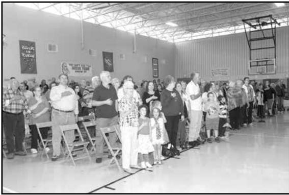
Grandparents and VIPs