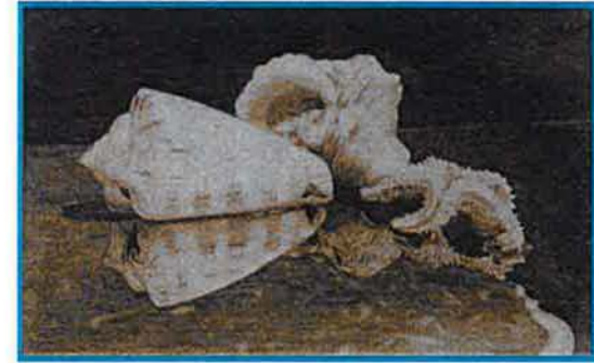
Rita Newman AITE