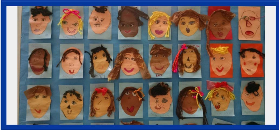
Rogers School – Grade 1