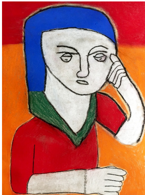
Tito Cambara Turn of River Middle School