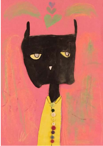
Genesis Criollo Cudlar Stillmeadow School, Grade 1