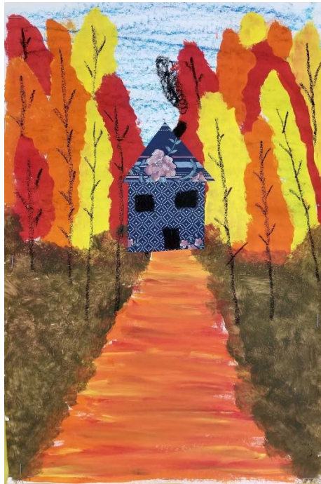
Monserrat Reyes Westover Magnet School, Grade 3