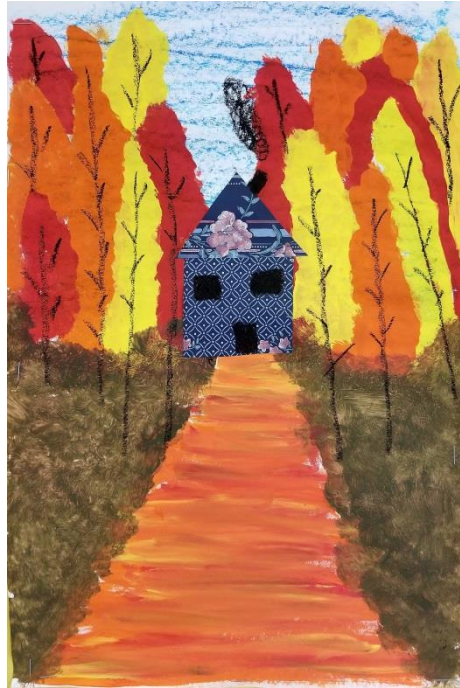
Monserrat Reyes Westover Magnet School, Grade 3