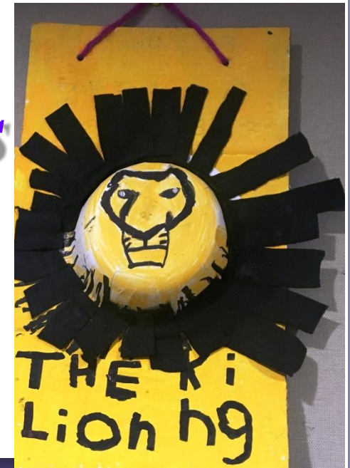
Sophia Abbazia Rogers International School, Grade 6