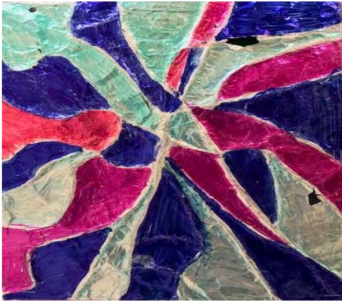
Ethan LaPine, Grade 3 Northeast Elementary School