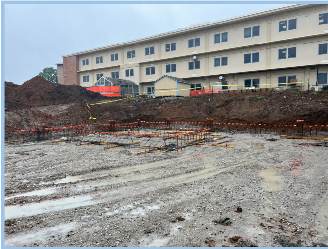
Began Pouring Footings & Foundations