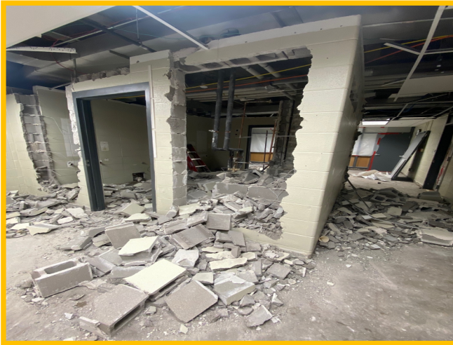
Level 1 Demolition