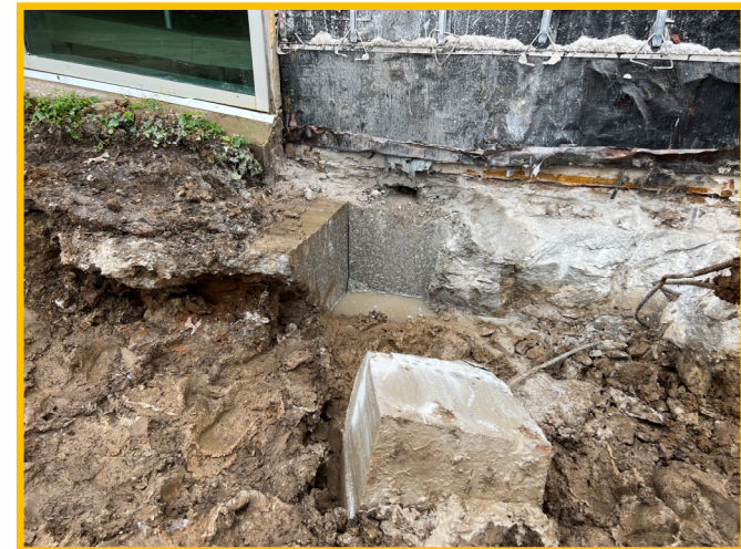
Structurally Upgrade Existing Footing