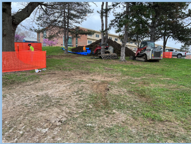
Erosion Control & Tree Protection