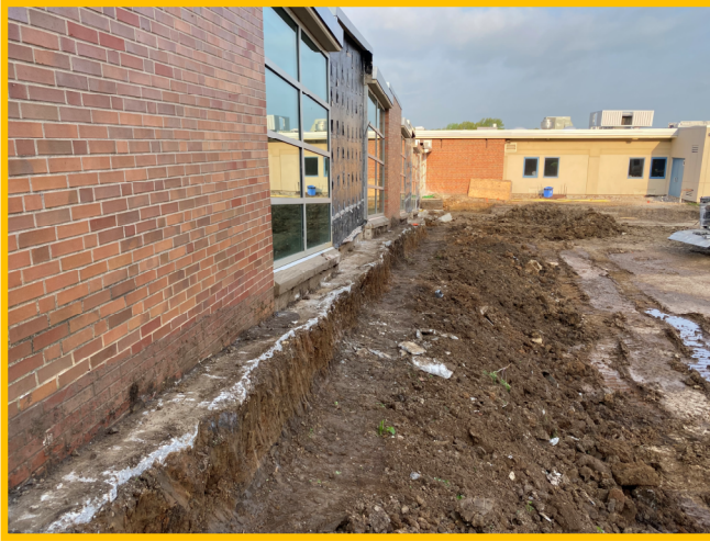
Saw Cut Existing Footing/Haunch