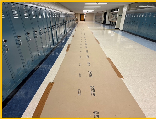
Summer Renovation Temp. Protection