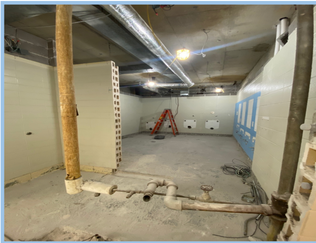
Level 4 Demolition