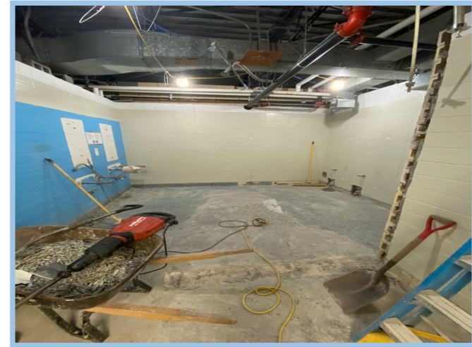
Level 2 Demolition