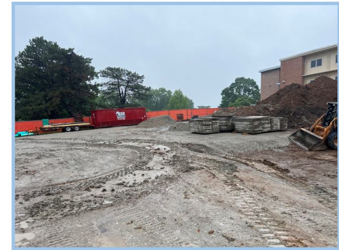
Maintaining Laydown Area