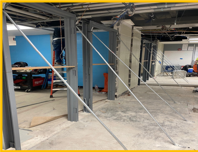
Level 1 Door Frames