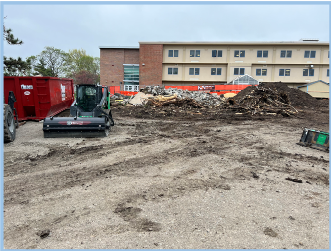
Stock Pile Haul Off