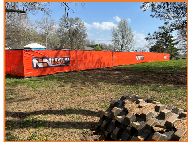
Construction Fencing Install