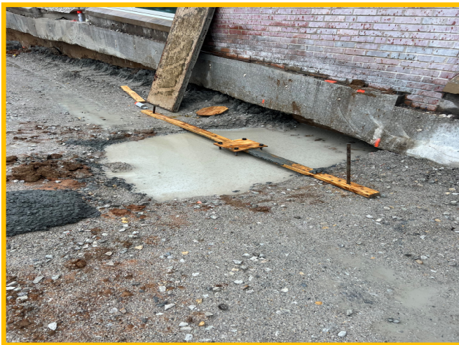
Poured Gridline 3/A