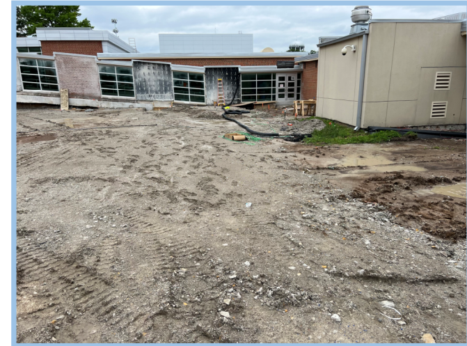
Temporarily Reroute Roof Drain