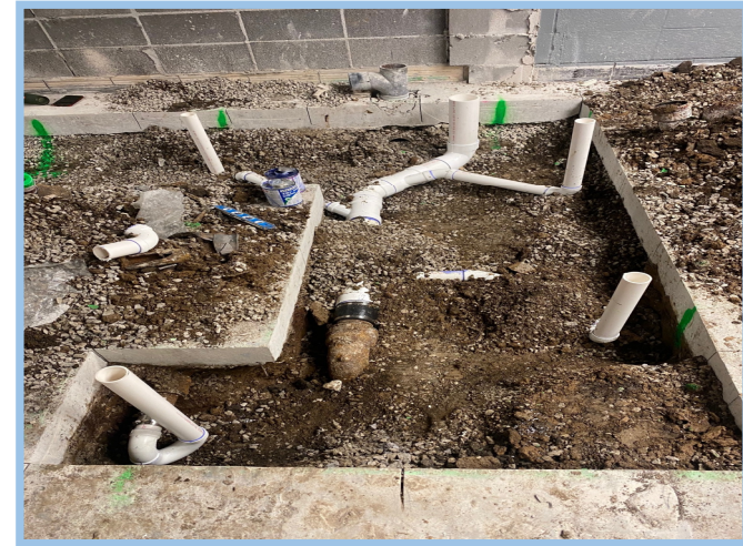
Level 1 Underground Plumbing