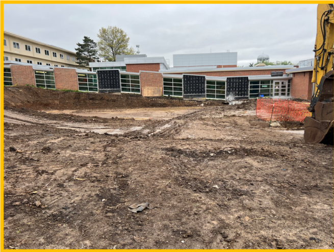
Site Clearing & Grading