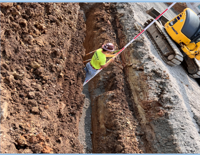
Site Utility Install