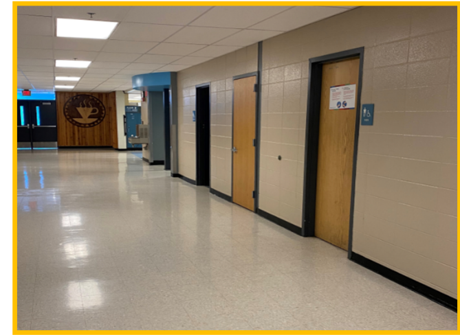
Finalize Renovation Routing & Barricade Plan