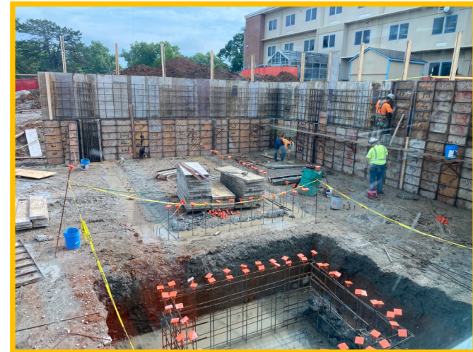
Form & Pour CIP Foundation Wall