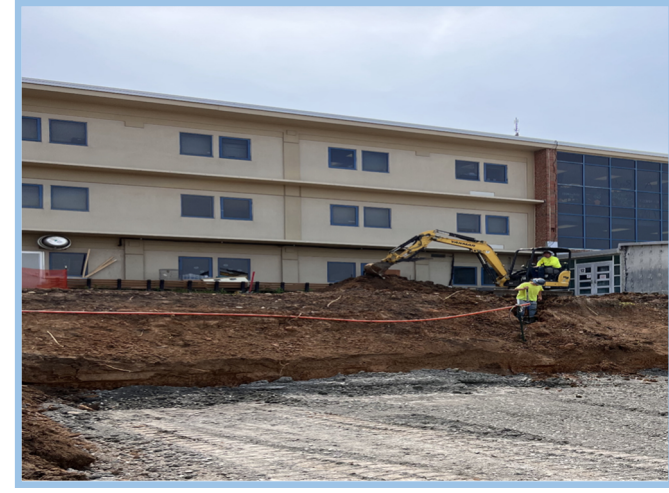
Relocate Existing Fiber Line