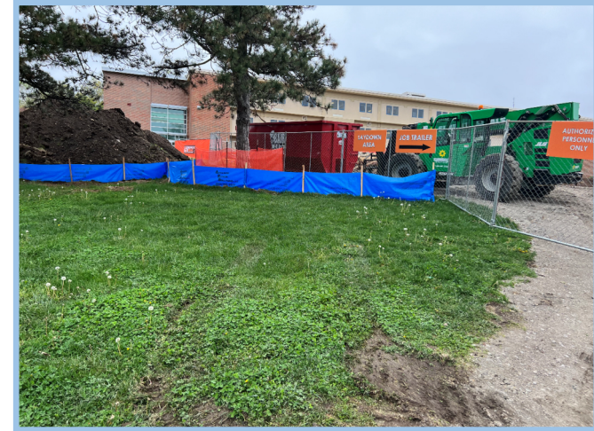
Added SWPP Around Stock Pile