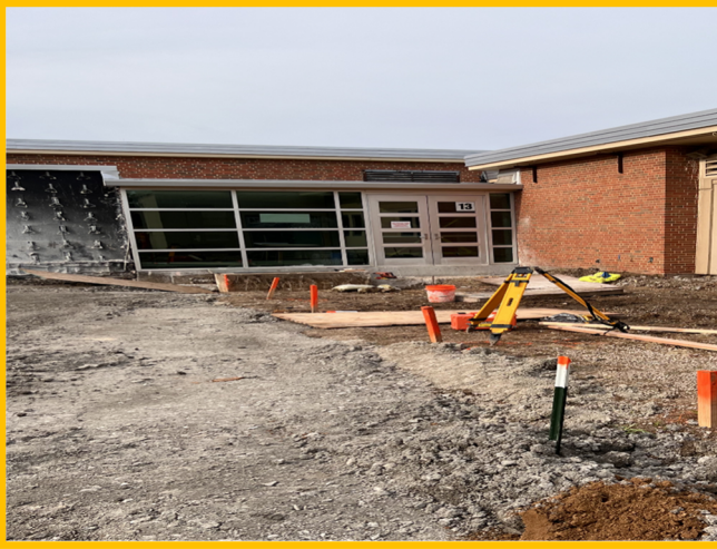
Layout Footings & Foundations