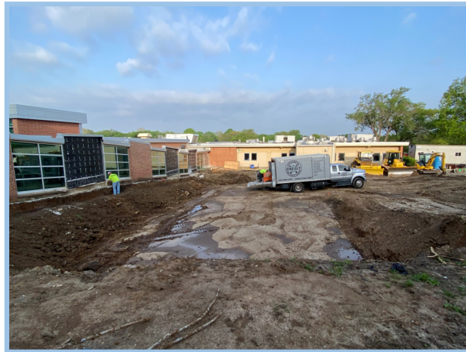
Continue Site Grading & Compaction