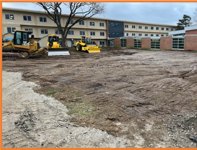
Site Clearing & Grading