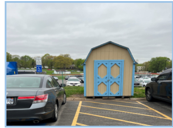
Relocated Existing Shed