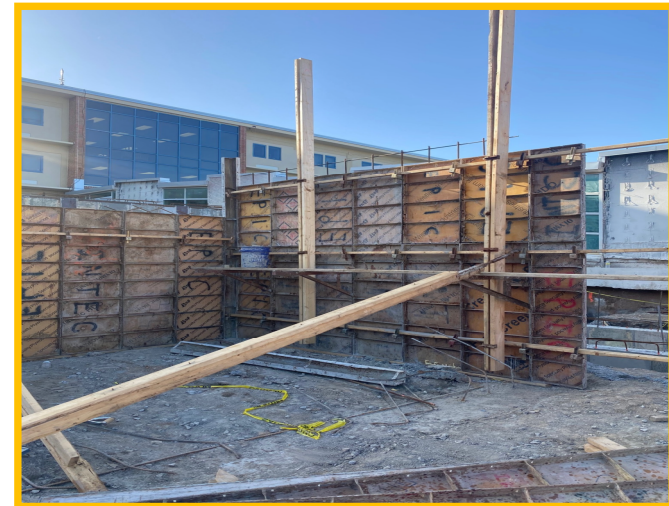
Form & Pour CIP Foundation Wall