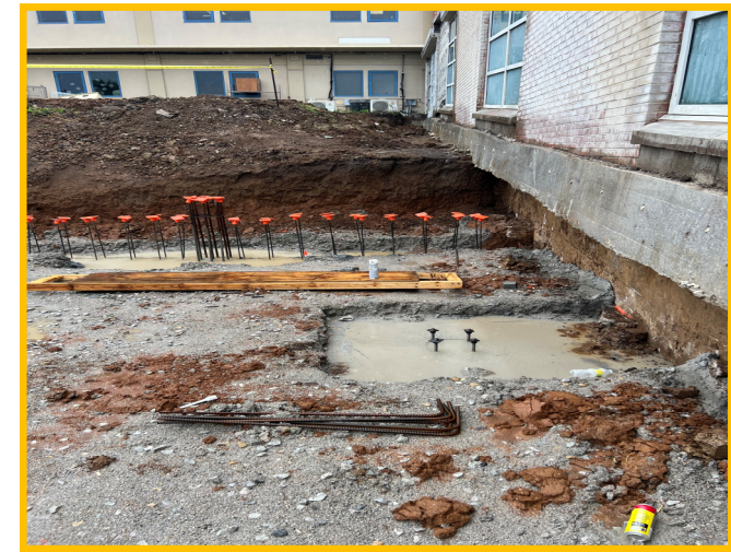
Poured Gridline 5/A