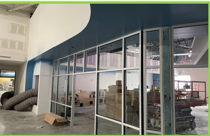
Media Center Storefront Frames