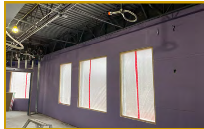
Area C Upper Level Drywall