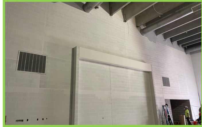
Gymnasium Wall Priming