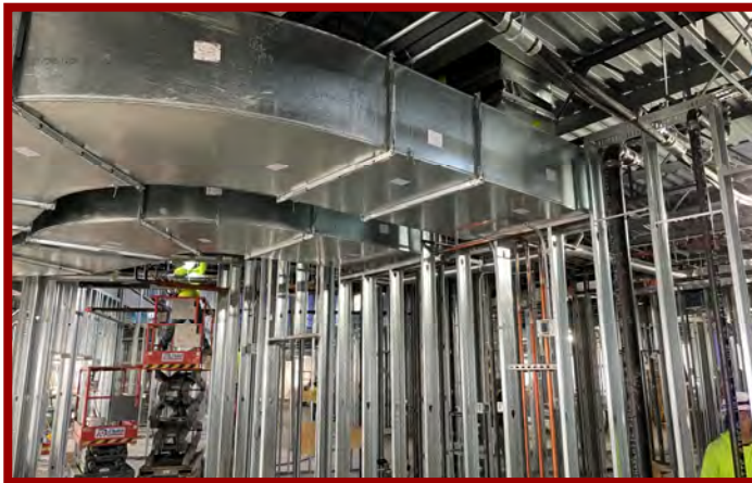
Area C Upper Level Overhead MEP