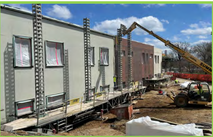
Area C Masonry Veneer Progress