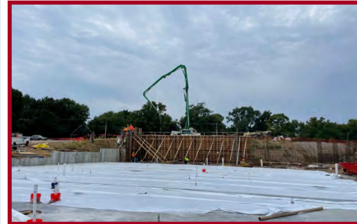
CIP Retaining Wall Pour #1