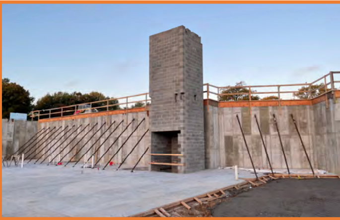
Elevator Shaft Complete