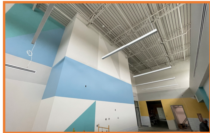
Corridor Final Paint & Linear Light Fixtures