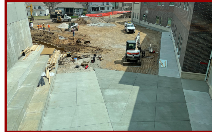
East Side Flatwork