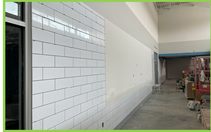
Continued Wall Tile Throughout