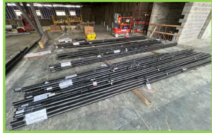
Fire Sprinkler Piping Prep