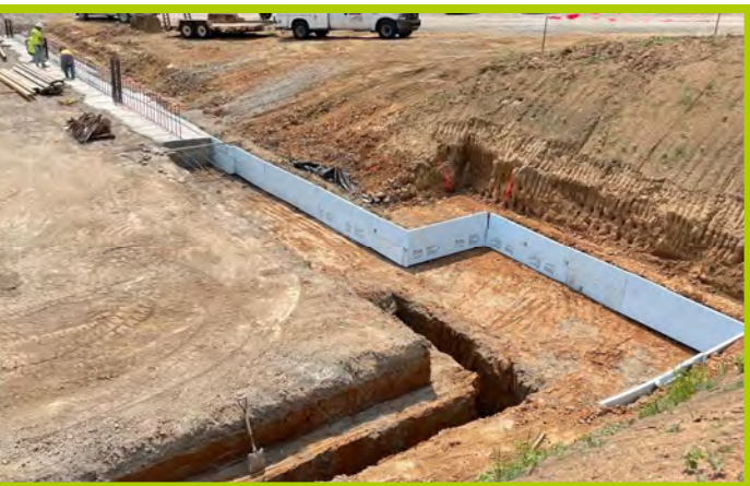
CIP Retaining Wall Footings