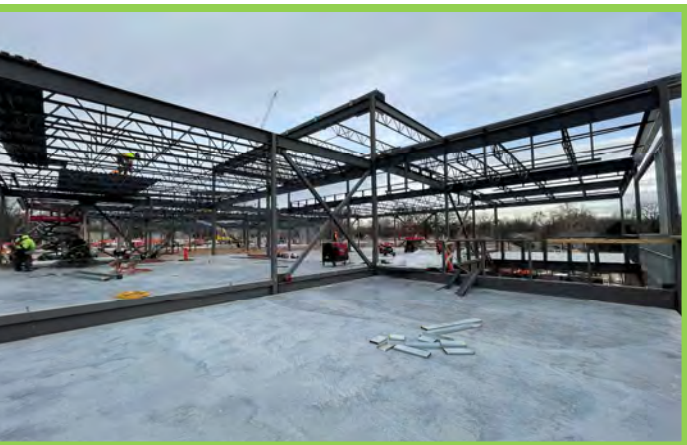
Area C - Slab-on-Deck Pour #1