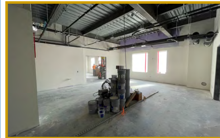
Area C Lower Level Priming