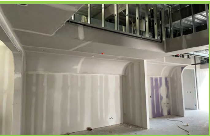
Area C Soffit Drywall & Finishing