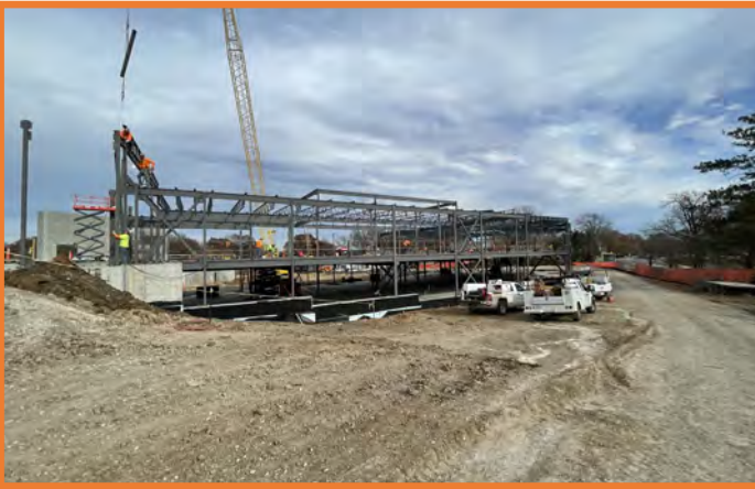
Area C Structural Steel Progress