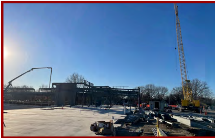
Area B - Structural Steel