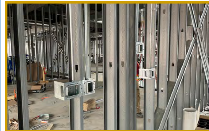
Area C Lower Level Wall Rough-In