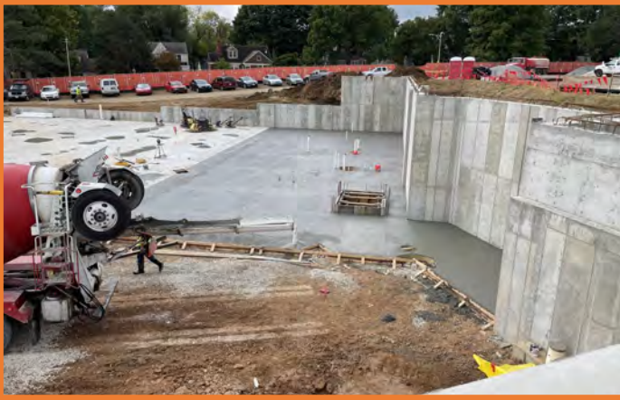
Area C - Slab-on-Grade #3 Pour