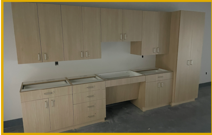
Area B Casework Installation