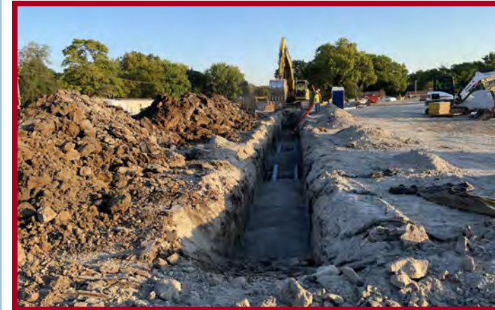
Domestic Water Lines