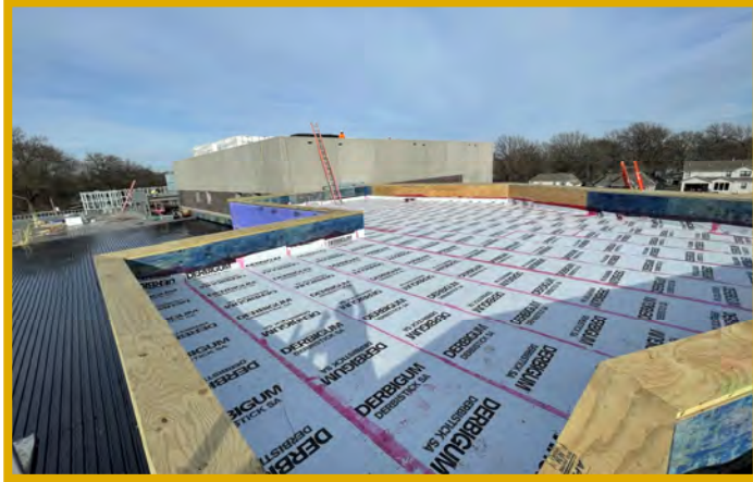
Area B Roofing - Insulated & Membrane