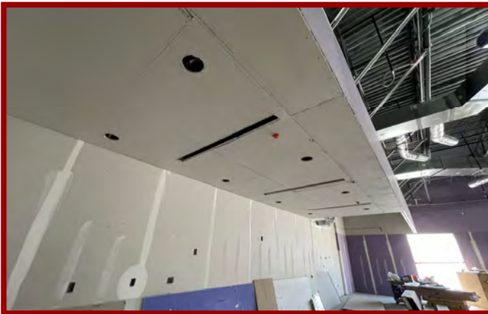
Media Center Drywall Finishing