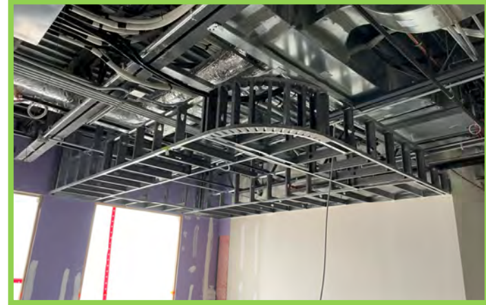
Reception Soffit Framing