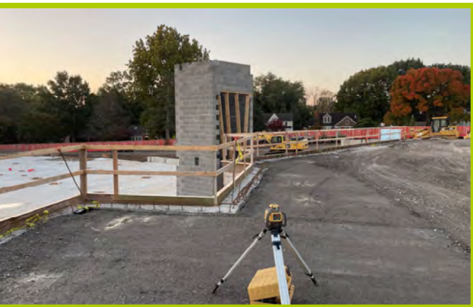
Retaining Wall Backfilled & Compacted