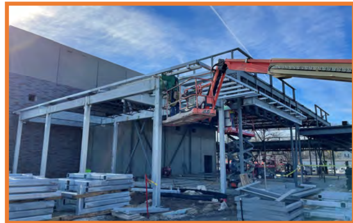
Cafeteria Canopy Detailing