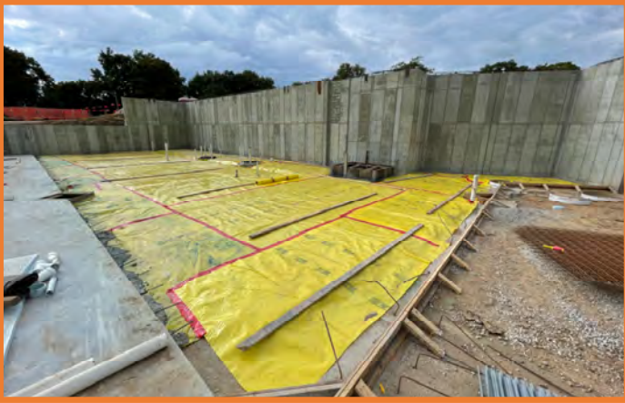
Area C - Slab-on-Grade #3 Prep & Pour