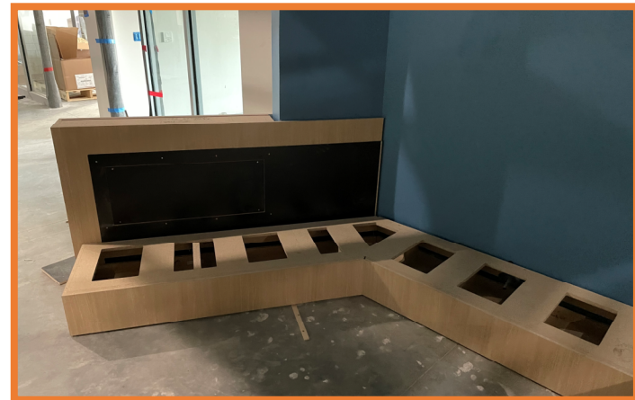
Corridor Booth Installation