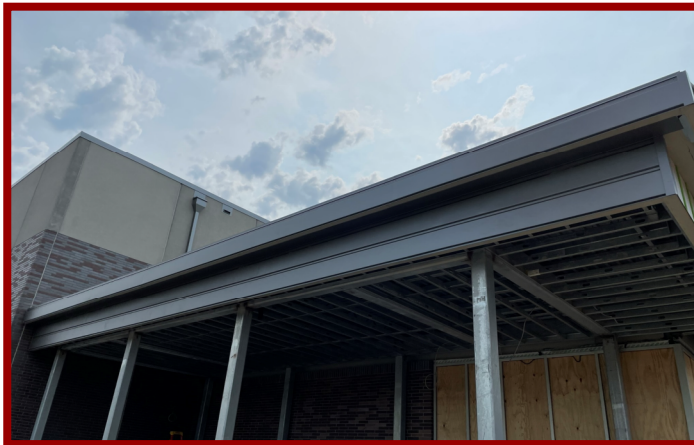
Cafeteria Canopy Metal Panel Work