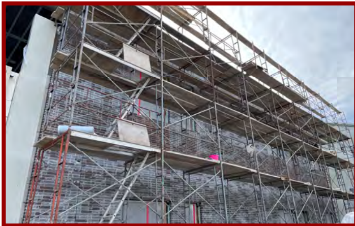
Area C Brick Veneer Progress