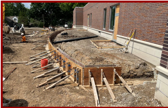
Front Outdoor Classroom Footings & Walls