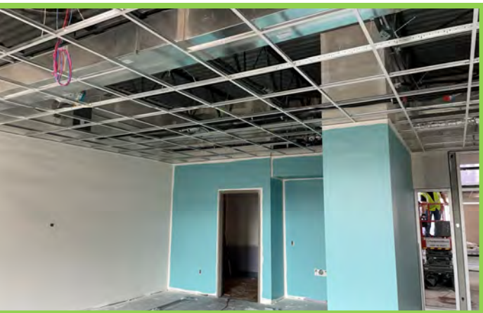
Upper Level Ceiling Grid & Paint