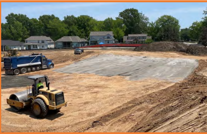
Building Pad Installation