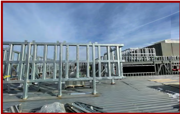
Area A - RTU Screen Framing