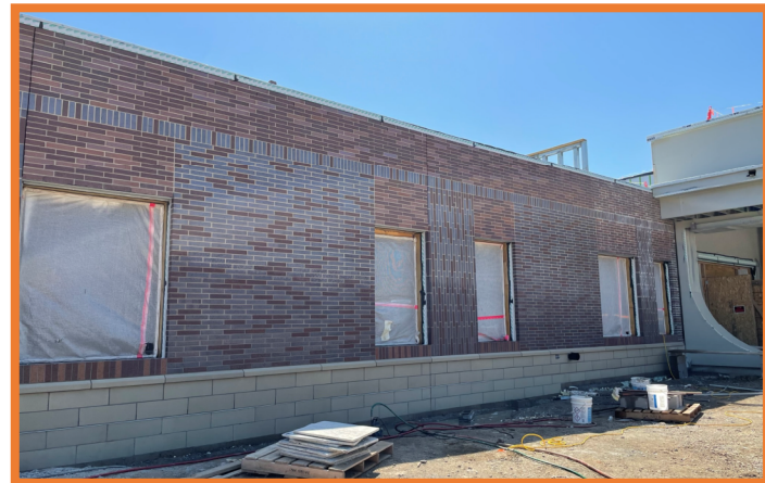
Area A/B Masonry Veneer