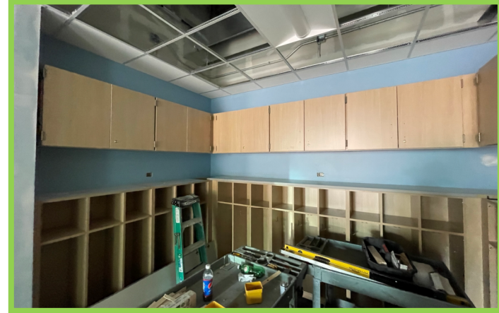
Classroom Casework Installation