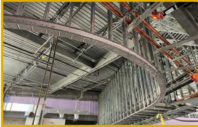
Main Entry Soffit Framing