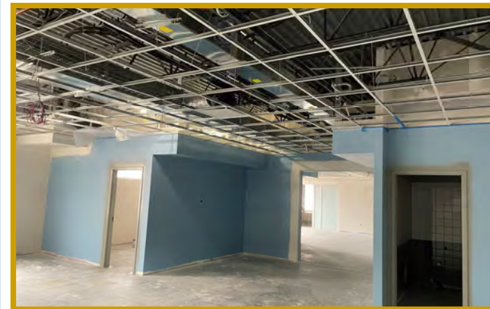
Upper Level Ceiling Grid & Paint