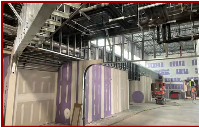
Upper Area C - Soffit Framing & Drywall Hang