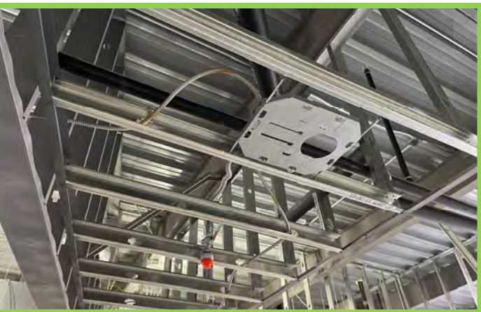
Area C Soffit MEP Rough-In