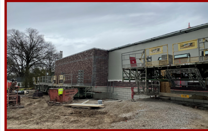
Area A & B Masonry Veneer