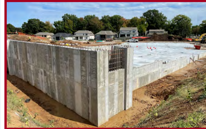
Retaining Wall Pour #1 - Formwork Striped