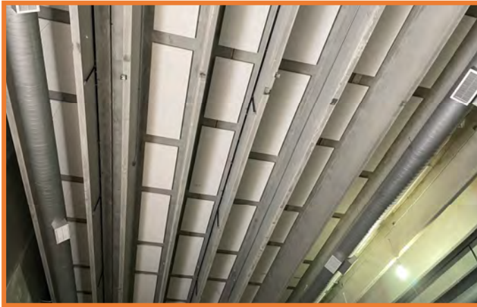
Gym Ceiling Tectum Panels