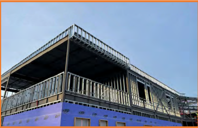
Area C - Exterior / Parapet Framing