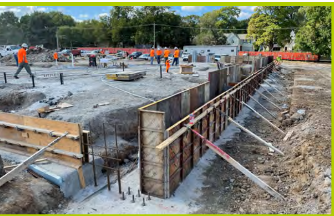
Area A - Stem Wall Formwork & Pours