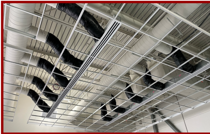
Commons Ceiling Cloud MEP Trim-Out