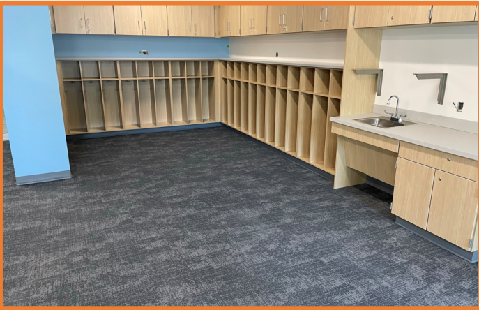
Final Cleaning in Classrooms