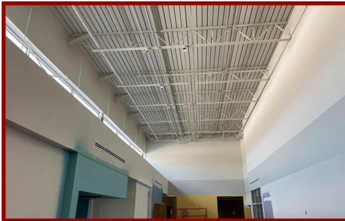
Area C Corridor Wall & Ceiling Paint