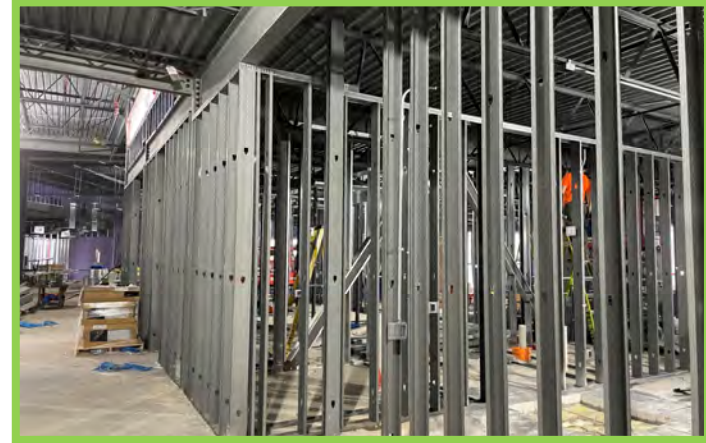
Area B (Admin Area) Framing