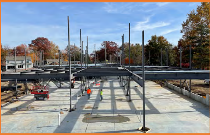
Area C Structural Steel Progress