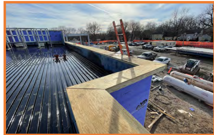
Area A Continued Parapet Blocking