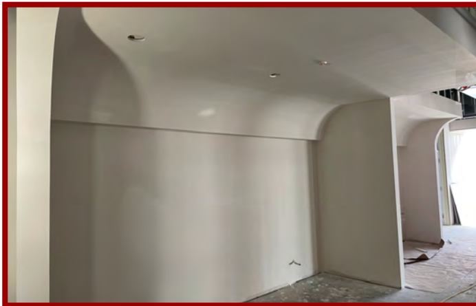
Area C Corridor Wall Priming