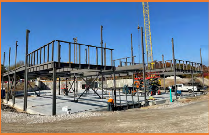
Area C Structural Steel