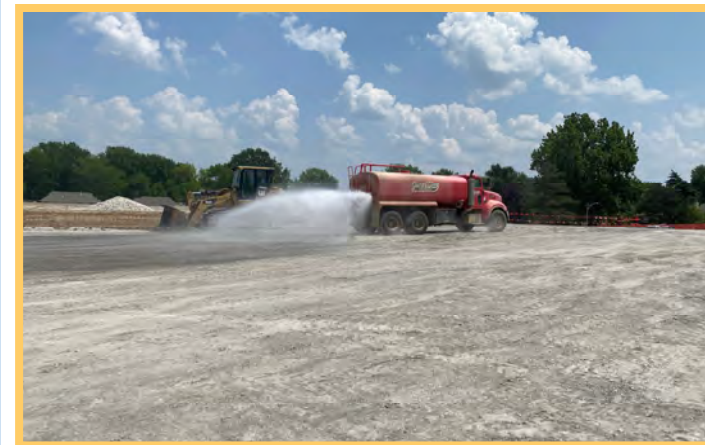
Dust Control Watering