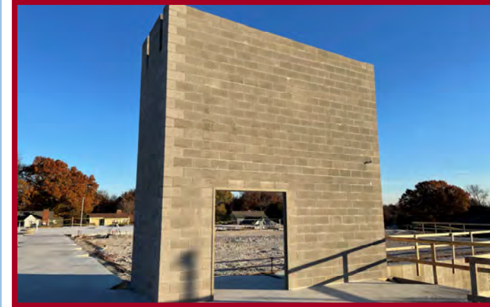
Gym Vestibule CMU Walls