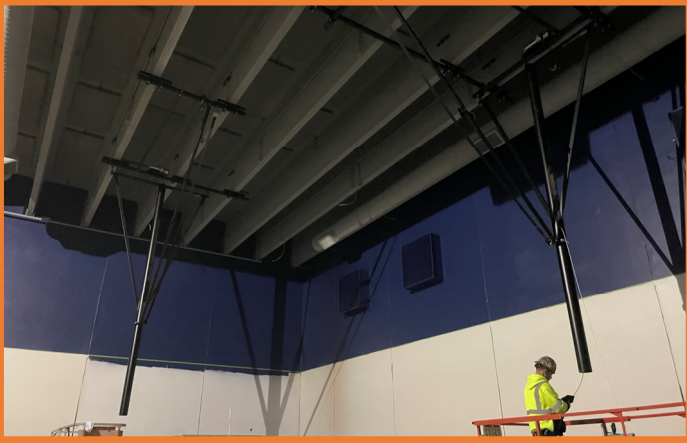
Gymnasium Equipment Install