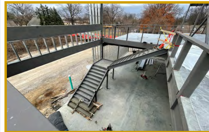
Area C - Stairs