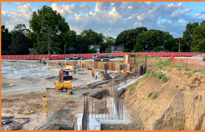
Classroom Wing CIP Wall Reinforcing