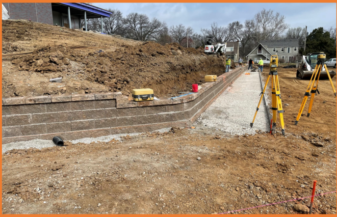
East Side Retaining Walls