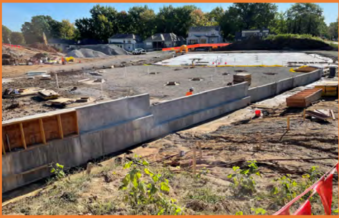
Classroom Wing - Retaining Wall Pours