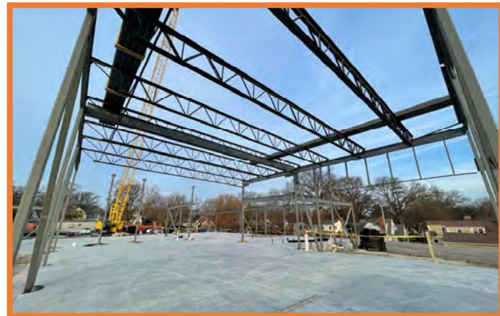
Area A - Cafeteria Structural Steel & Joists