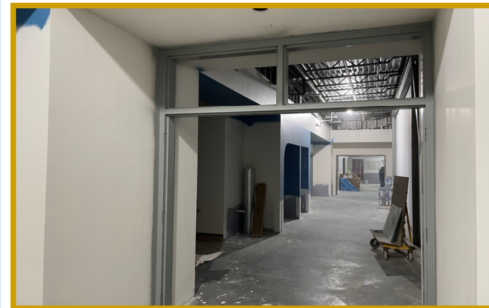
Area B Corridor Paint