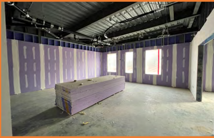
Area C Lower Level Drywall