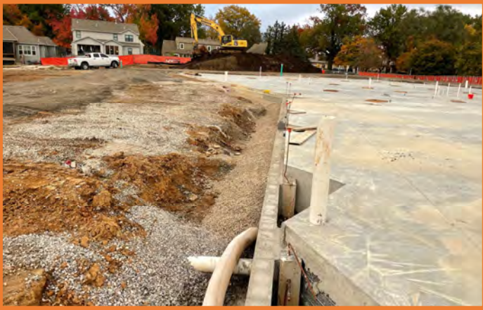
Area C Foundation Drainage & Backfill