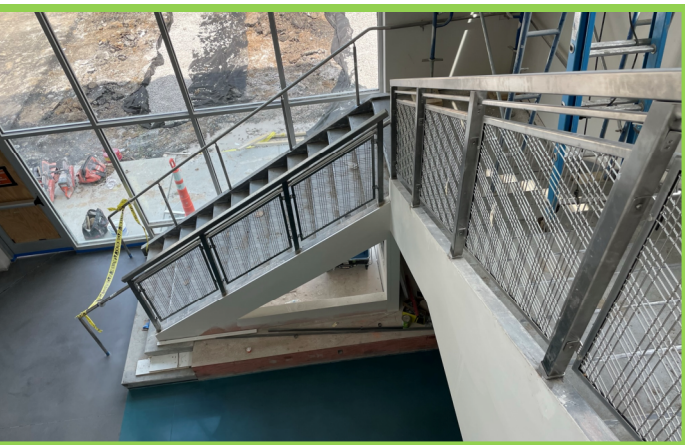
Area C Stair Rails