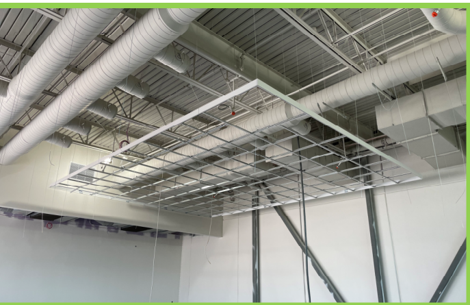
Commons Area Ceiling Paint & Clouds