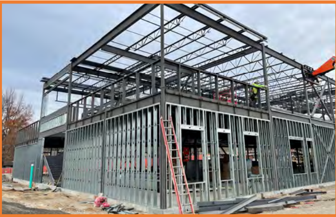
Area C - Exterior Framing