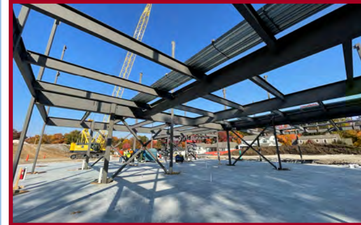
Area C Structural Steel