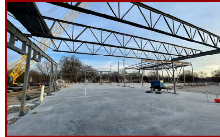
Area A - Structural Steel & Joists