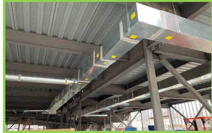
Area C - Overhead Ductwork