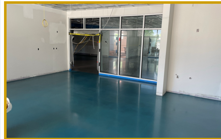
Lower Level Polished Concrete Staining