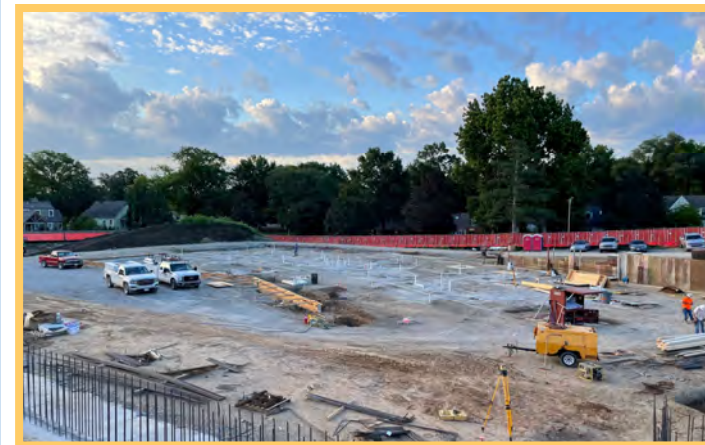
Classroom Wing Progress