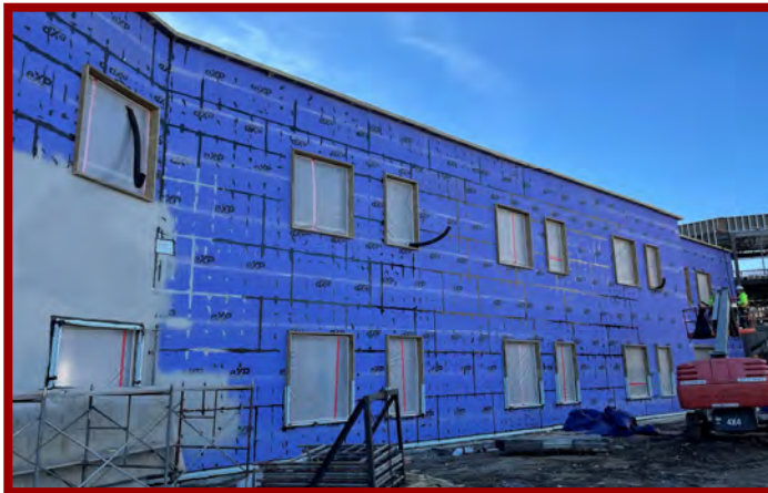
Continued Joint Sealants & Vapor Barrier