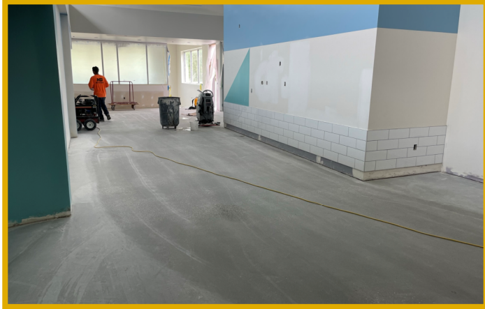
Area C Polished Concrete Grinding