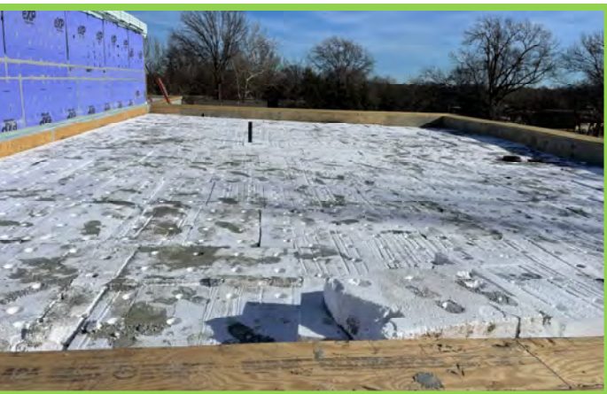
Area C Roof - Lightweight Concrete Pours