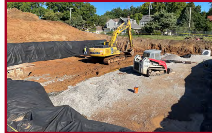
Underground Detention Basin Excavation