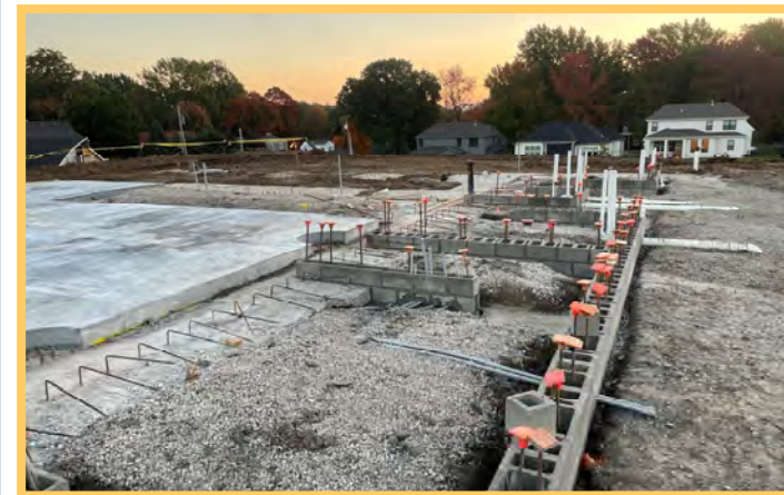
Gymnasium CMU Base Courses