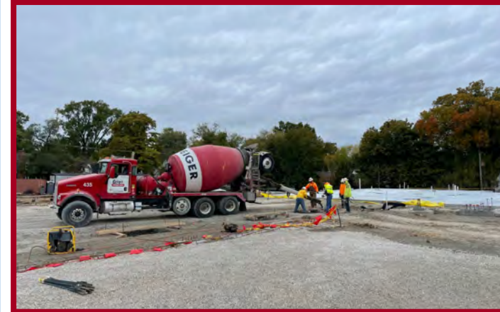
Area A/B Column Pad Pours