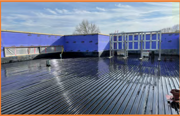
Area B & A Roof - Primed & Insulated