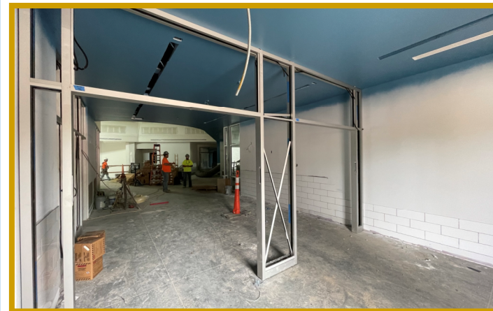
Entry Vestibule Storefront Frames