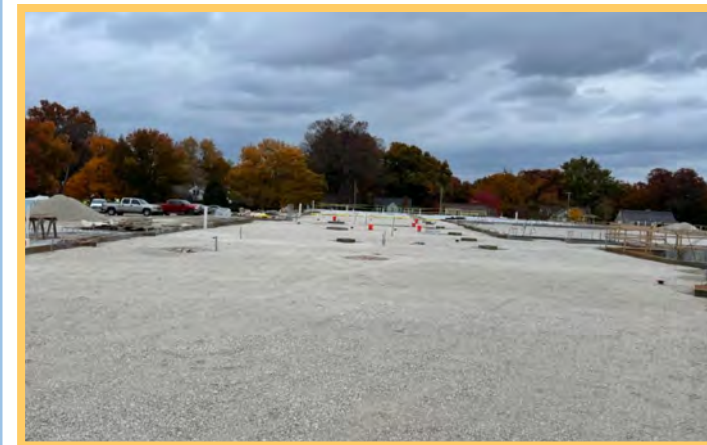
Area B Slab-on-Grade Prep