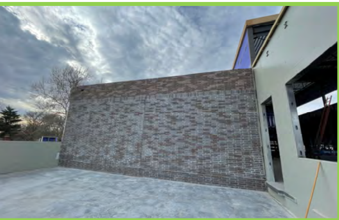
Outdoor Classroom Brick Veneer