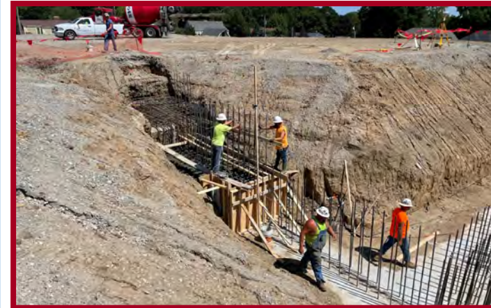
Gymnasium - Footing Reinforcement