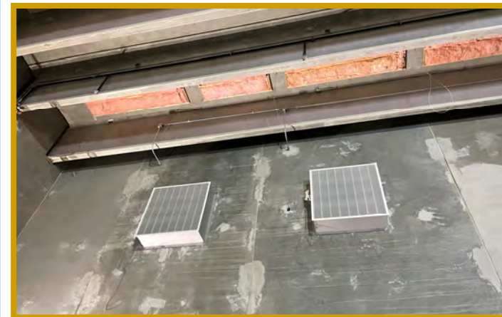
Gymnasium Louvers & Ceiling Tectum