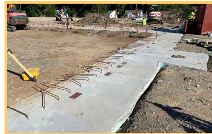
Gym Footings & Precast Embed Plates