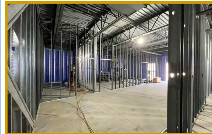
Area A Wall Framing & Rough-In