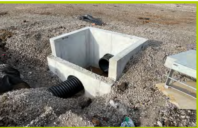
Storm Sewer Piping & Inlets