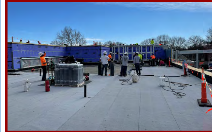
Area B Roofing Membrane