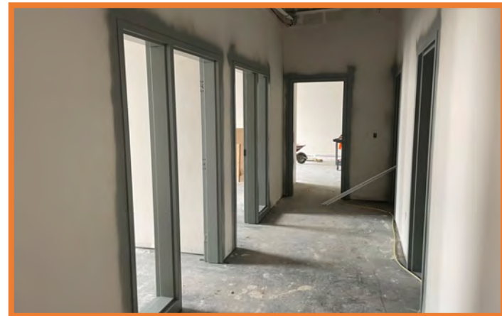
Door Frame Paint Throughout