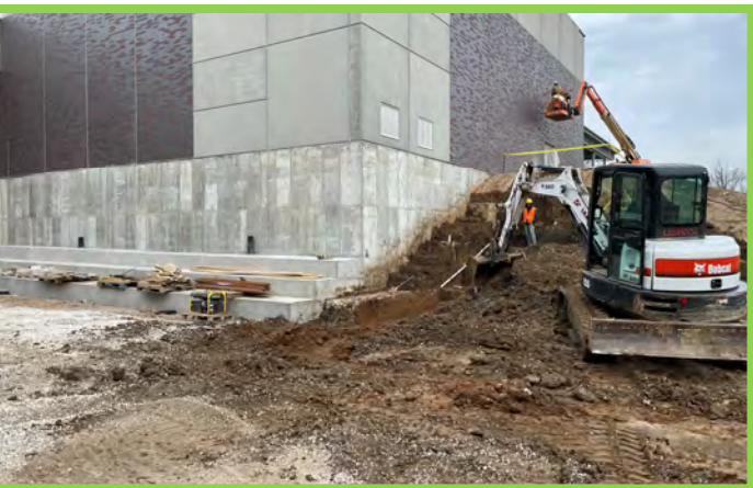
Learning Stairs & Gym Stair Footings