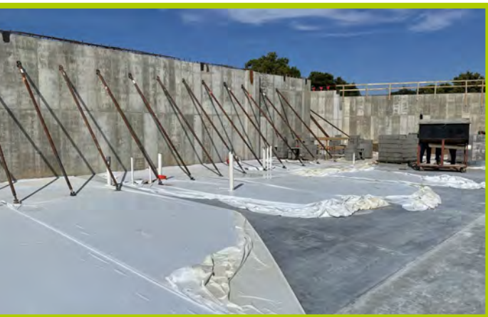
Retaining Wall Bracing & Elevator Shaft Mob.