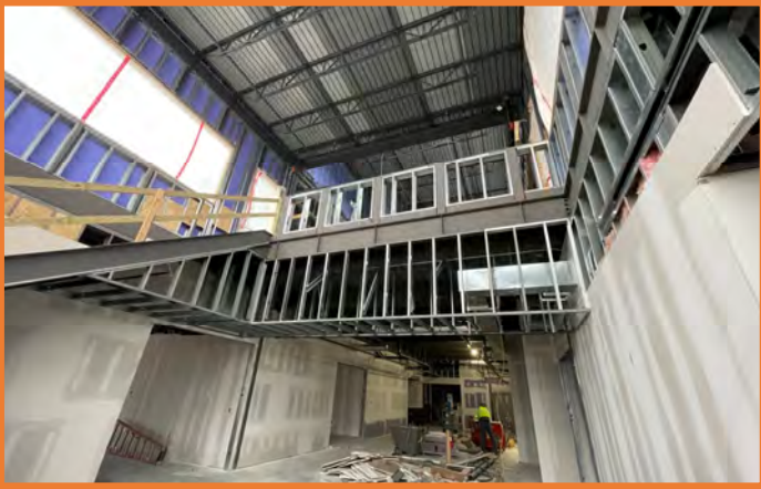
Area C Lower Level Soffit Framing