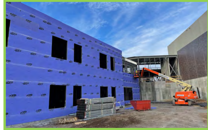
Continued Area C Sheathing