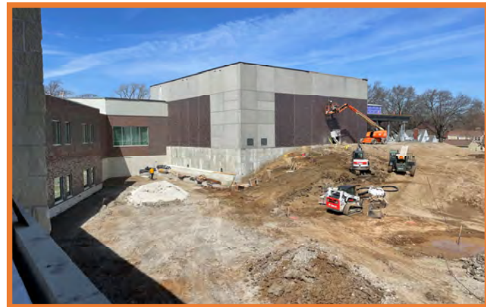
East Side Final Grading & Sidewalk Prep