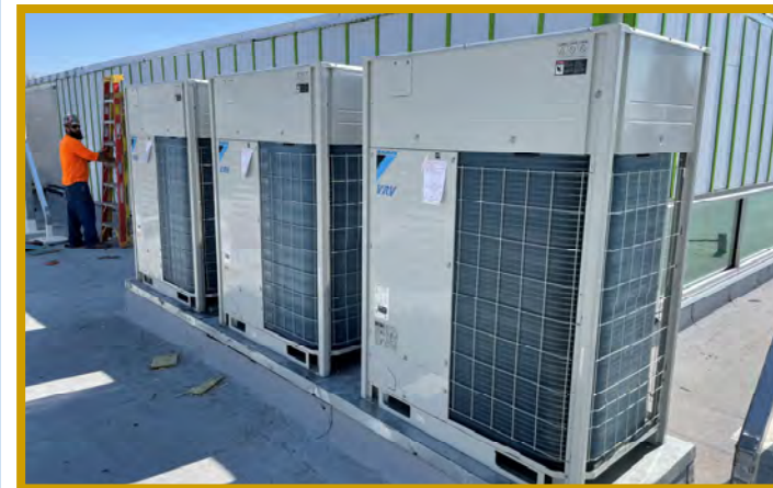
VRF Roof Units Delivered & Installed