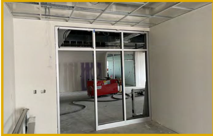
Lower Area C - Classroom Storefront Frames