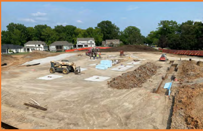
Area C Classroom Wing Footings