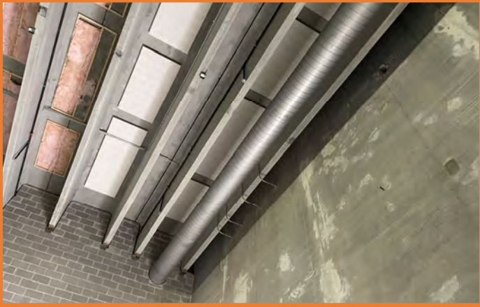
Gym Ductwork and Ceiling Tectum Panels