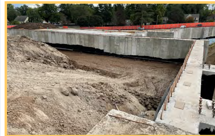
Gym Retaining Wall - Interior Backfill