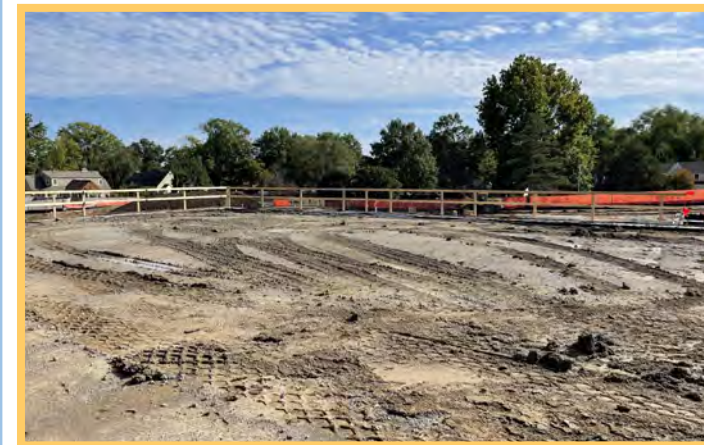
Gym Retaining Wall Backfill & Safety Rails