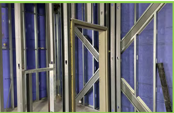
Door Frames Installed Throughout