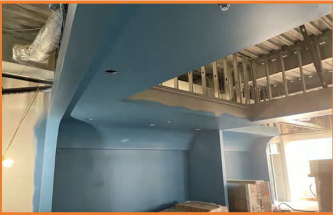
Lower Level Wall & Ceiling Paint