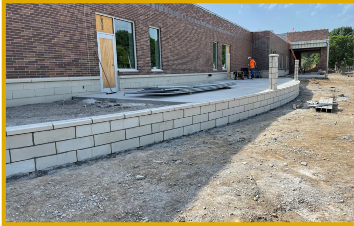
Front Outdoor Classroom Progress