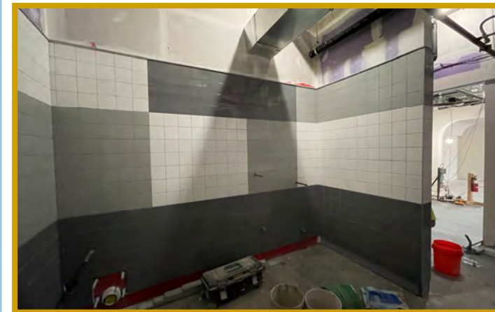
Continued Wall Tile