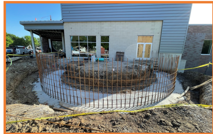
Media Center Outdoor Classroom Footing & Wall Rebar