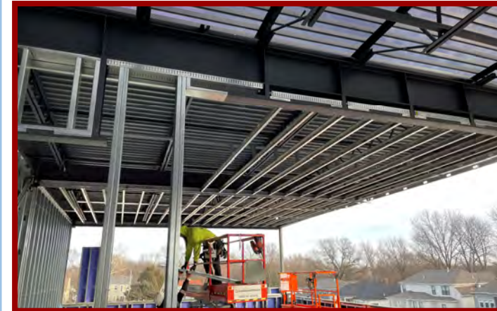
Outdoor Classroom Ceiling Framing