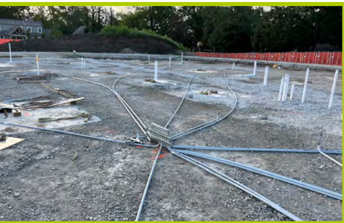
Classroom Wing Underslab Electrical