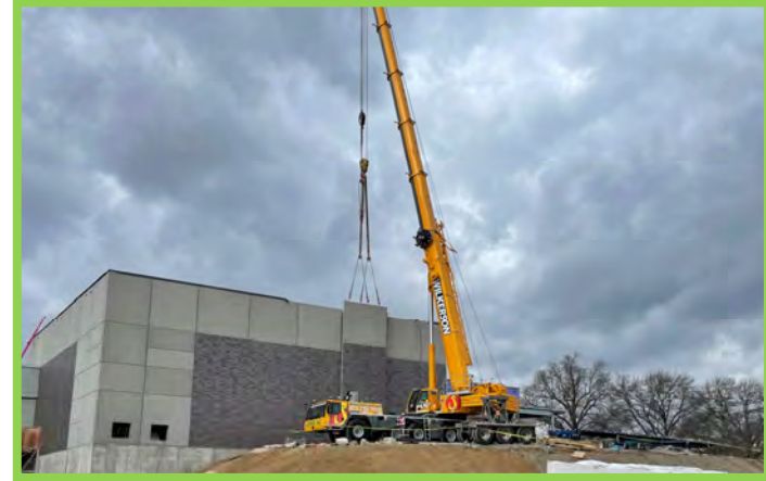
Final Precast Panel Erection