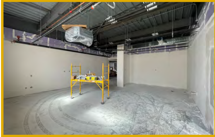
Lower Area C - Cont. Wall Priming