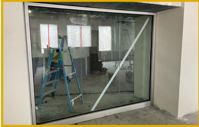
Interior Storefront & Glass Throughout