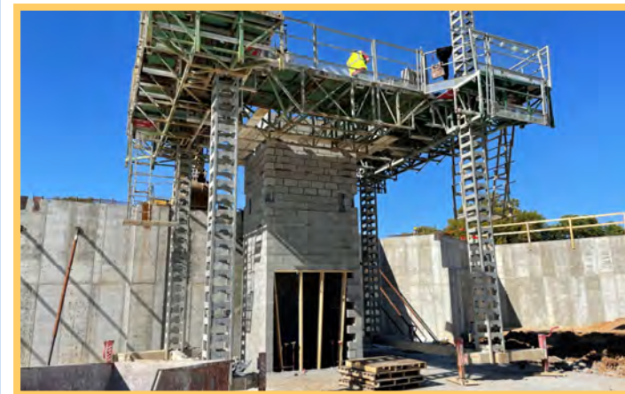
Elevator Shaft Wall Progress