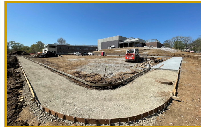
Continued East Side Flatwork