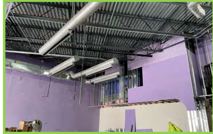
Media Center - Soffit Framing & Drywall Hang