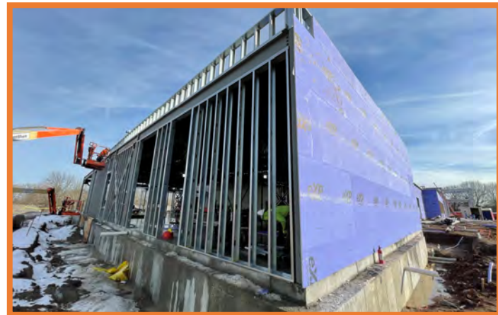
Area A - Exterior Framing & Sheathing