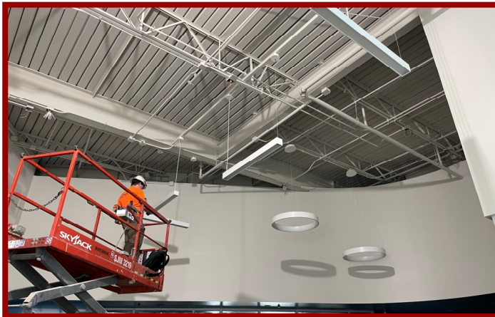
Main Lobby Light Fixture Install