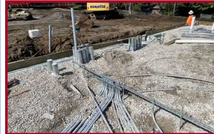
Underslab Electrical & Slab-on-Grade #4 Prep