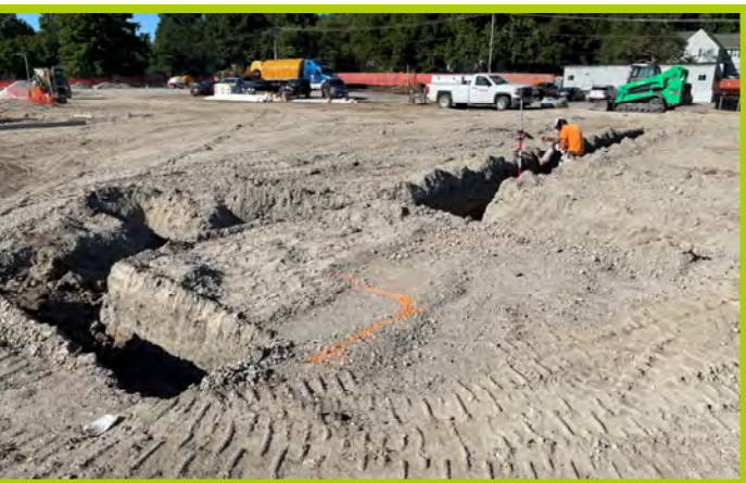
Cafeteria Footing Excavation