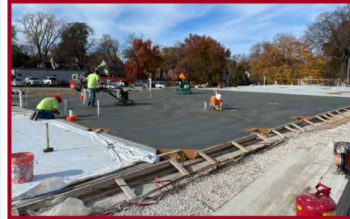
Slab-on-Grade Pours 5 & 6