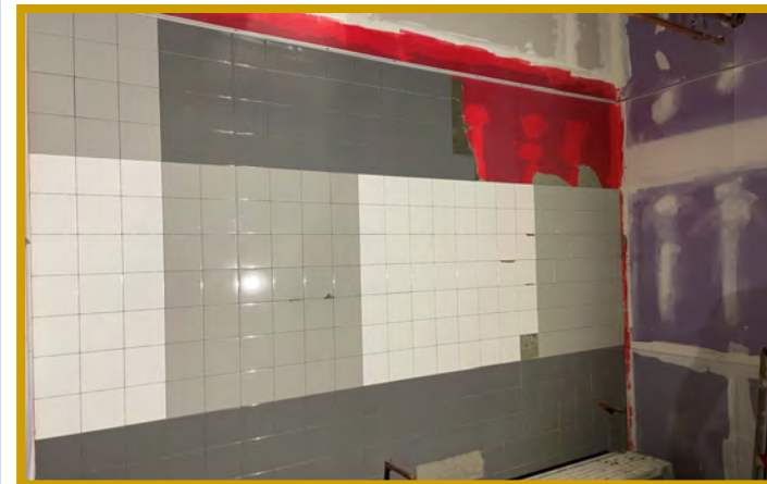
Lower Level C Bathroom Wall Tile