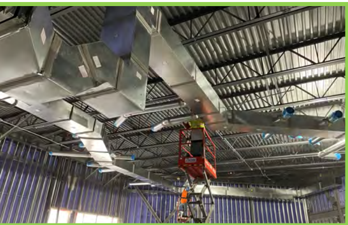
Area B Overhead Ductwork