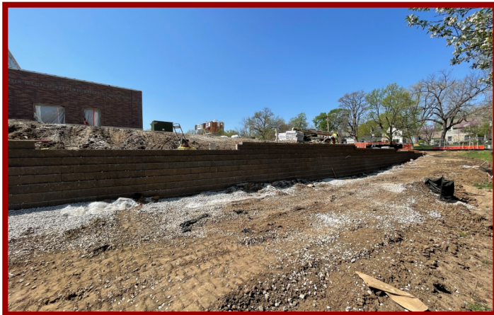
North Side Retaining Wall