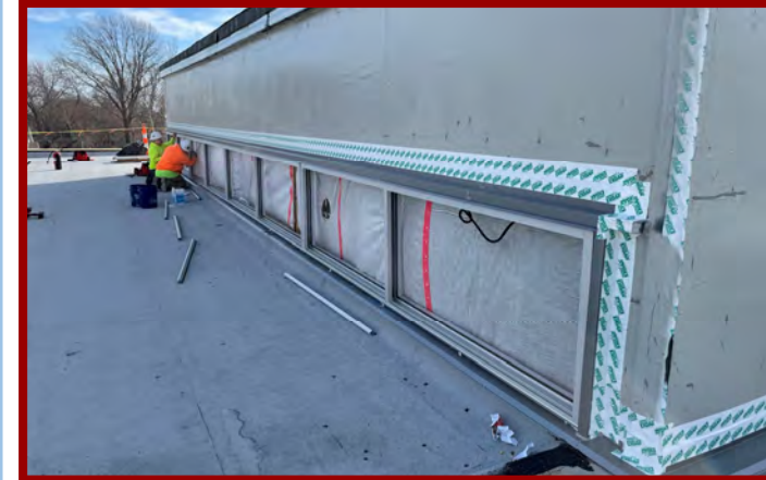
Clerestory Window Frames & Flashing