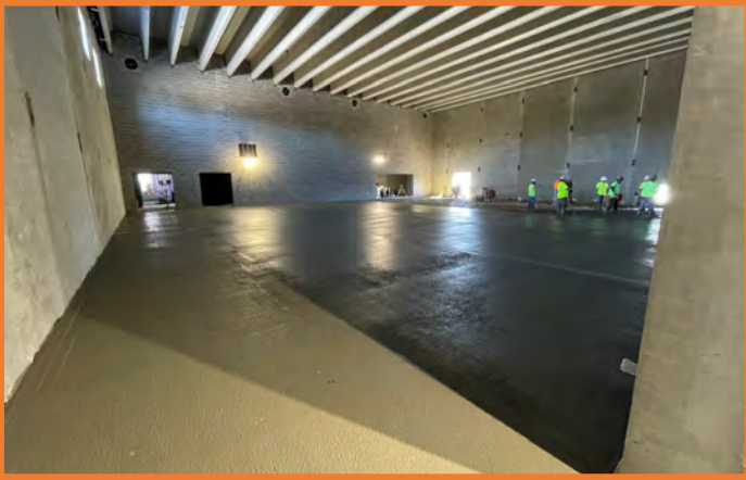
Gym Slab-on-Grade Poured