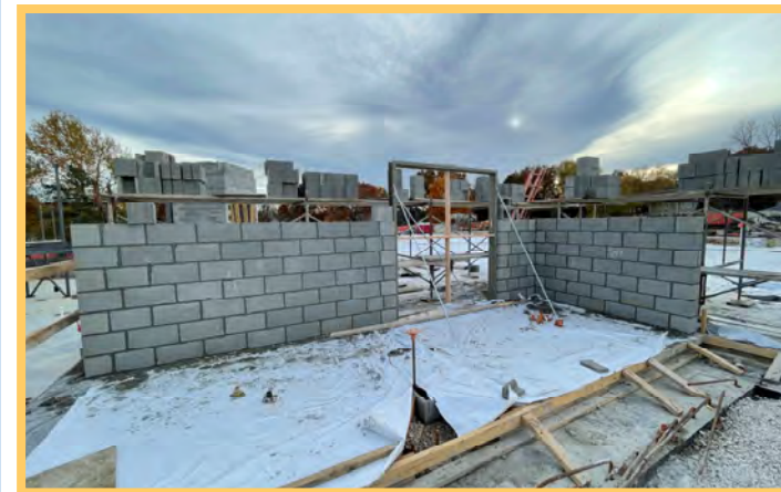
Gym Vestibule CMU Walls