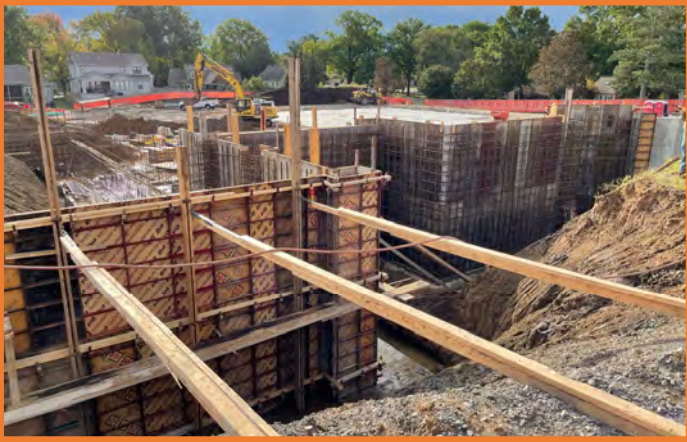
Retaining Wall Pour #2 - Rebar & Formwork