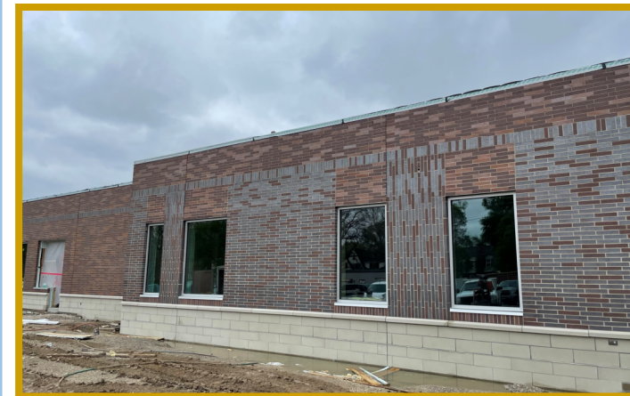
Front Façade Glazing