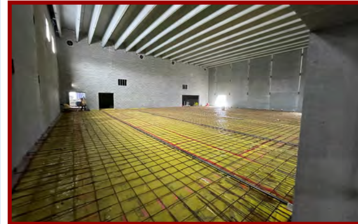
Gym SOG Prep & Underslab Elec.