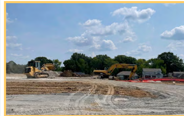
Gym Concrete Footing Excavation