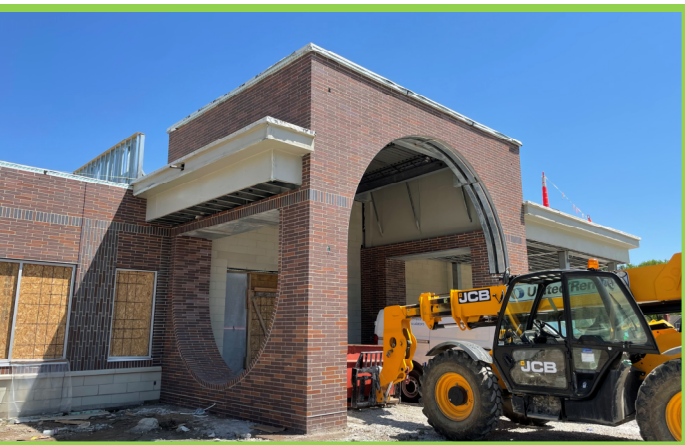
Main Entry Canopy Progress