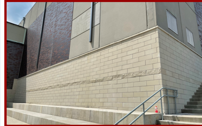
Gym Thin Stone Veneer