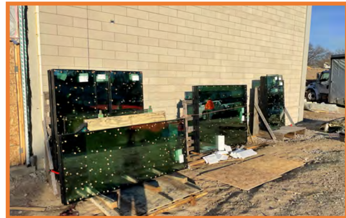
Window Glass Delivered & Staged