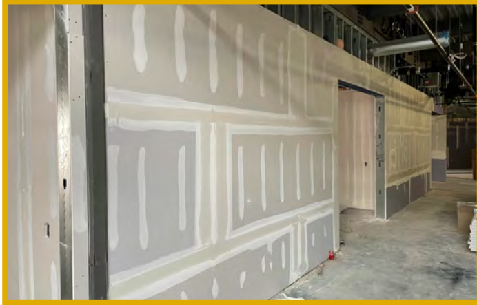
Area C Lower Level Drywall Tape & Finish