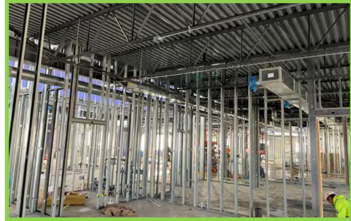
Upper Level C - Framing & In-Wall Rough