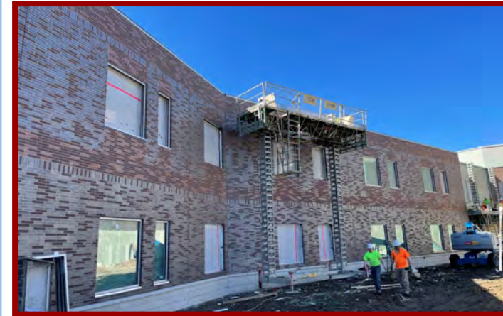
Continued Area C Brick Veneer