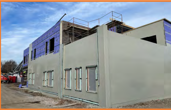
Area C Vapor Barrier