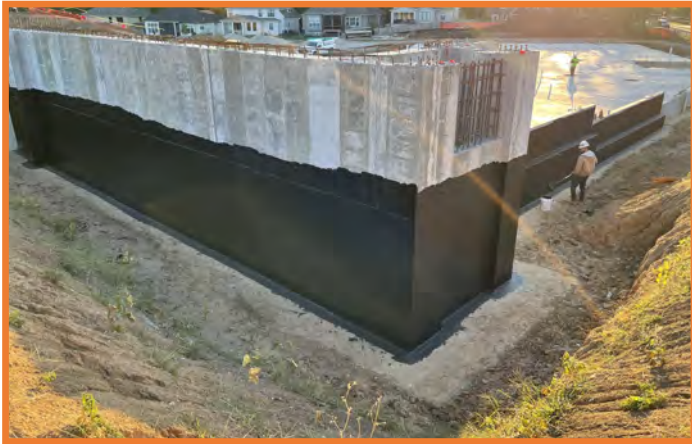
Wall Pour #1 - Waterproofing