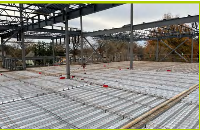
Area C Slab-on-Deck Prep