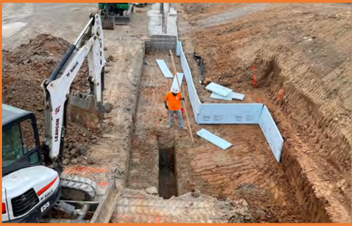
Classroom Wing Footings Progress