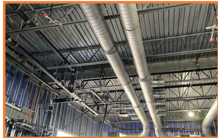
Cafeteria/Kitchen In-Wall & Overhead MEP