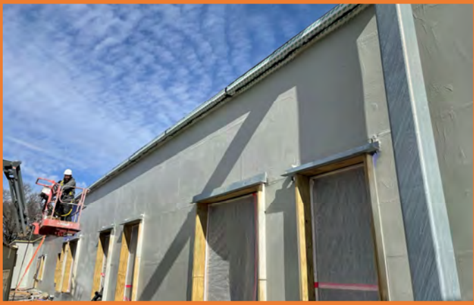
Area A Vapor Barrier