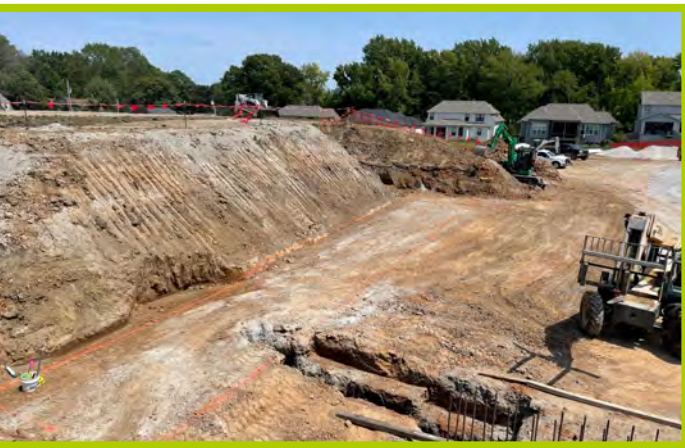
Gym CIP Footing Excavation