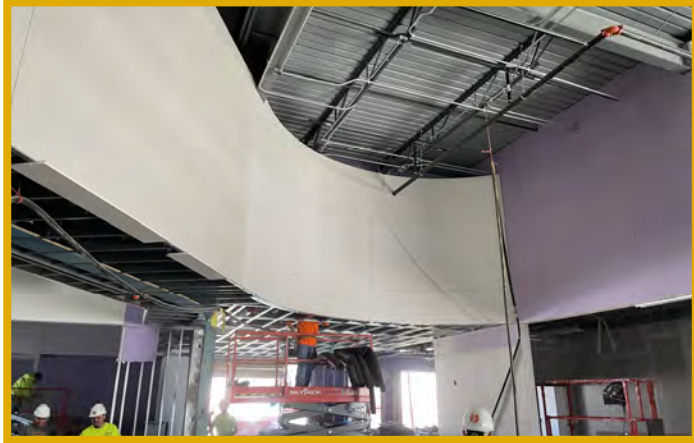
Lobby Soffit Drywall