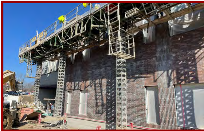
Area C Masonry Veneer Progress