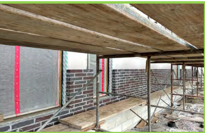
Area C Brick Veneer