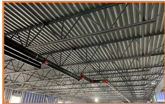
Area A Overhead MEP