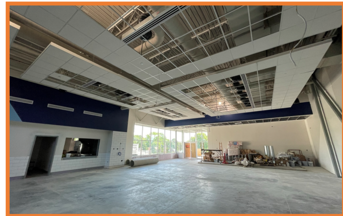
Commons Area Polished Concrete Grinding