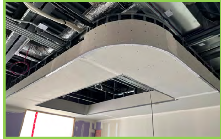
Reception Soffit Drywall