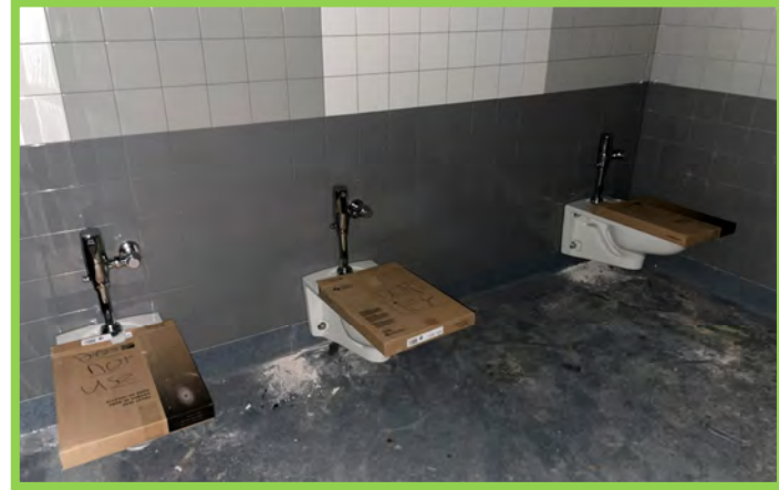
Lower Level Plumbing Fixture Install