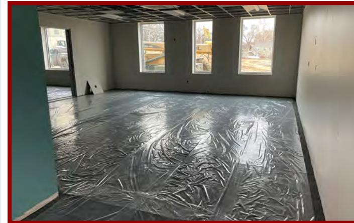
Lower Level Carpet Protection