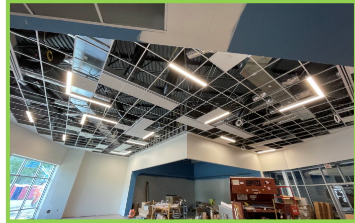
Media Center Lighting & Carpet Flooring