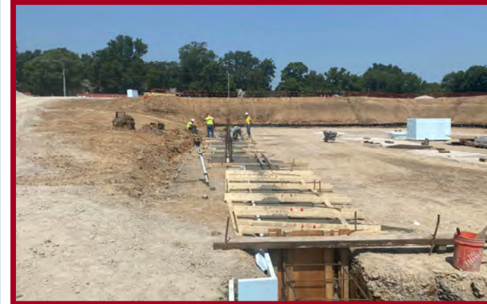
Area C Classroom Wing Grade Beams