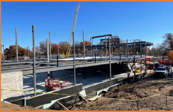
Area C Structural Steel Progress