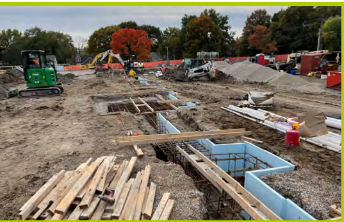
Area B Grade Beam Reinforcement