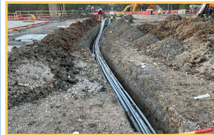
Area B Underground Electrical