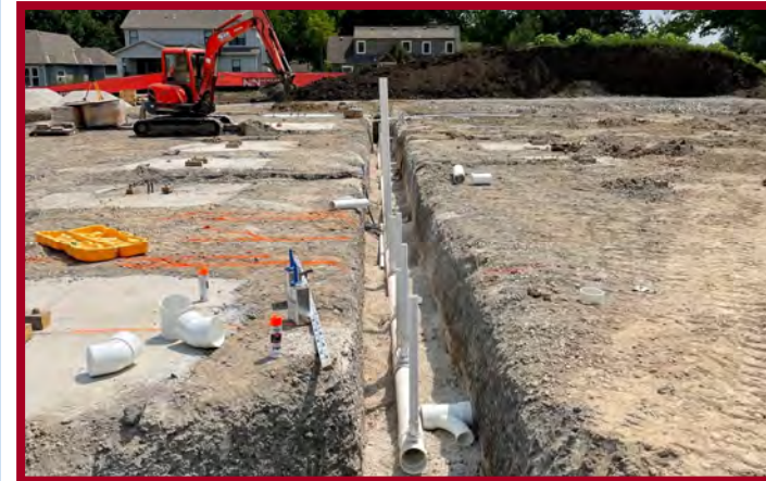
Classroom Wing Grade Beams