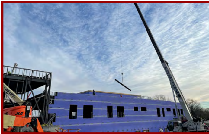
RTU Screen Wall Steel Supports