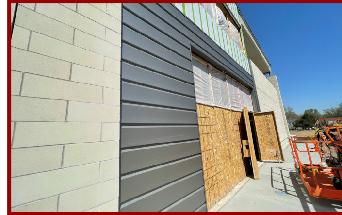
Metal Panel Installation