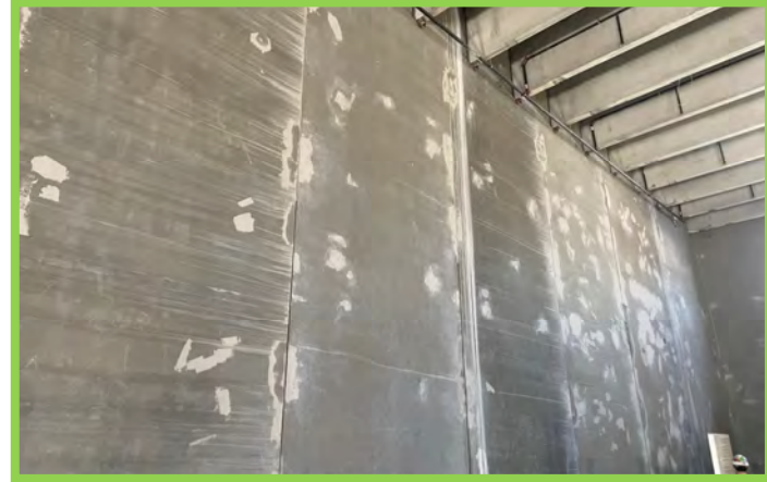
Interior Precast Patchwork