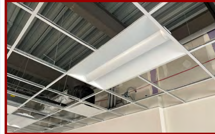
Lower Level MEP Ceiling Trim-Out