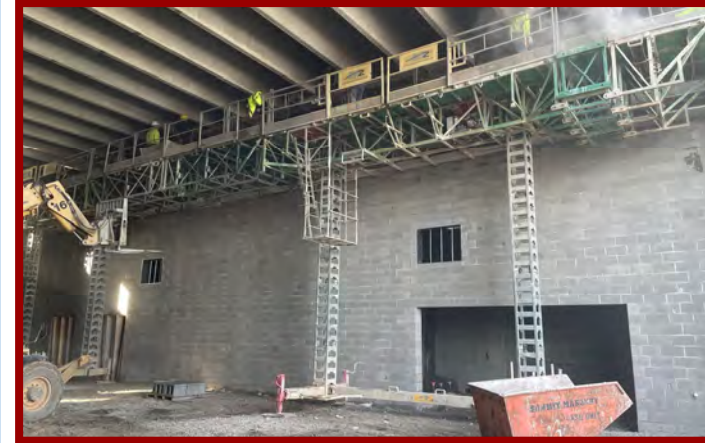
Gym CMU Wall Progress