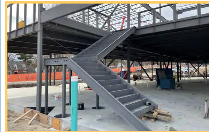
Area C Stairs