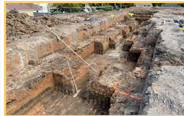
Cafeteria Footing Excavation