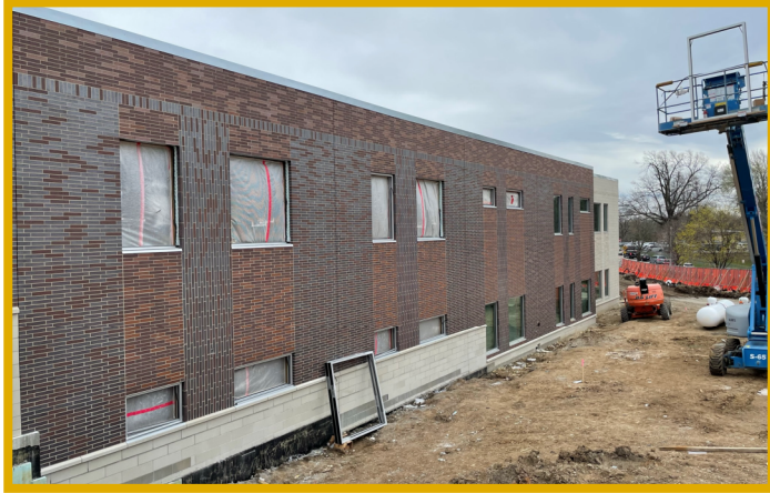
Area C Brick Washdown