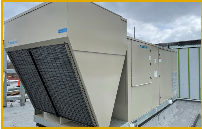
DOAS Units Set