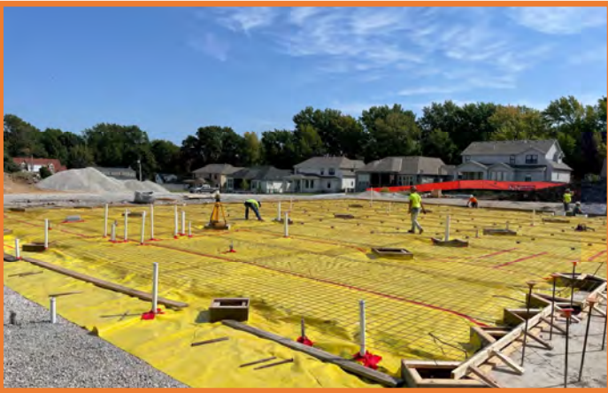
Classroom Wing - Slab-on-Grade Prep