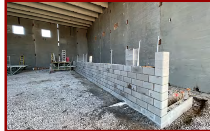
Gym CMU Wall