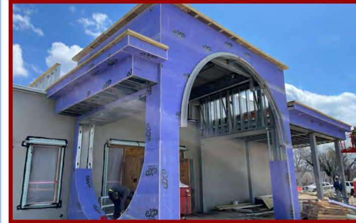
Main Entry Sheathing