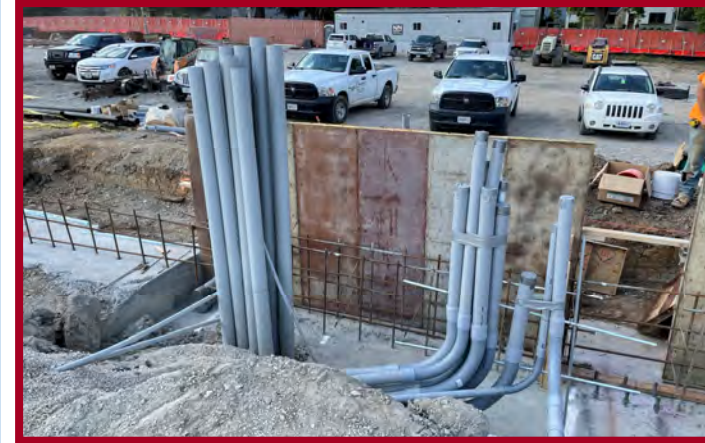
Electrical Service - Building Entry Conduits