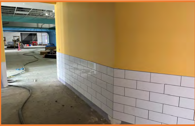
Lower Level Corridor Wall Tile