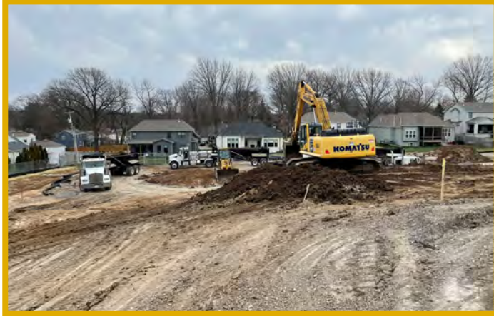
East Side Grading & Haul Off