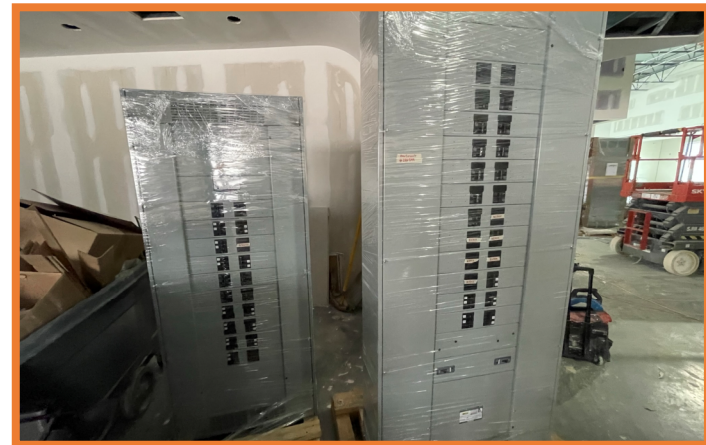
Electrical Sub Panels Delivered