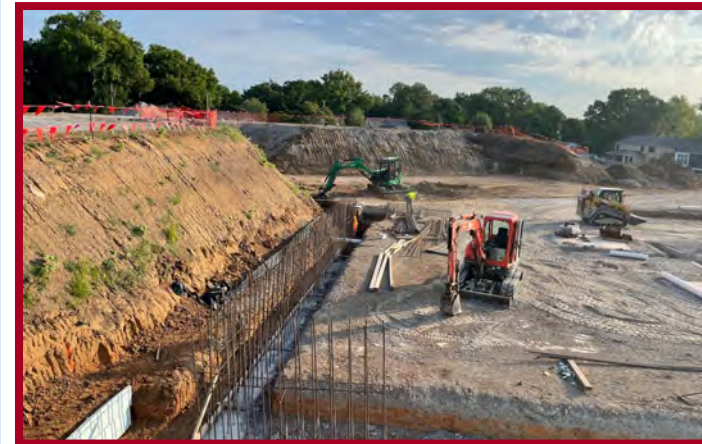
Classroom Wing CIP Retaining Wall Footings