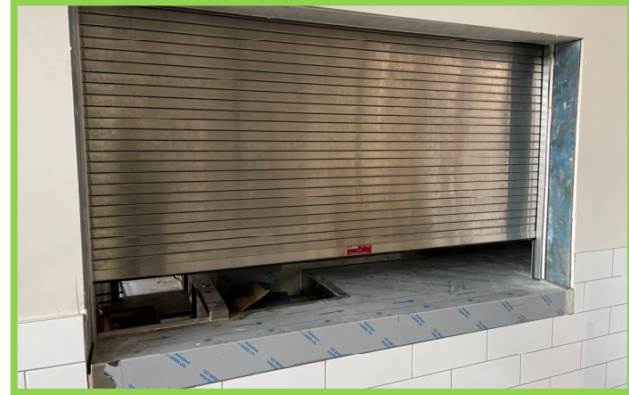
Cafeteria Coiling Door Installed