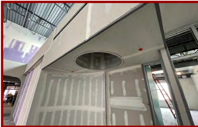
Upper Level Soffit Drywall Finishing