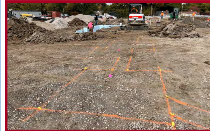
Area B Footing Layout