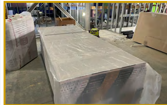
Lower Level C - Drywall Delivered & Staged