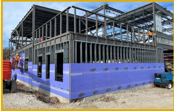
Area C - Exterior Sheathing