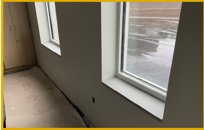
Window Sill Install