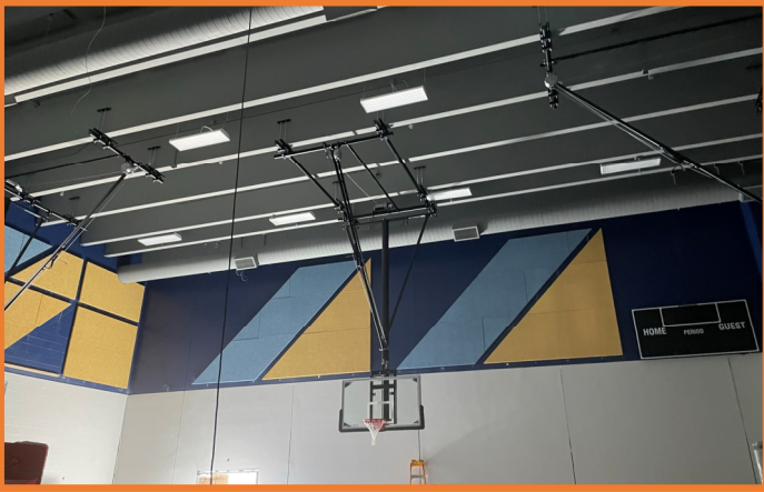
Gymnasium Equipment & Tectum Panels