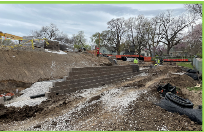
North Side Retaining Wall