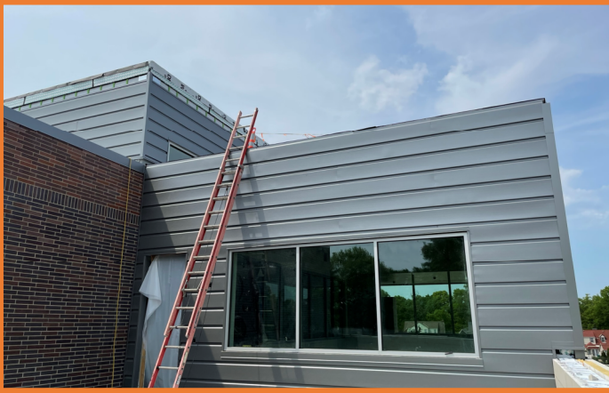
Continued Metal Panels Throughout