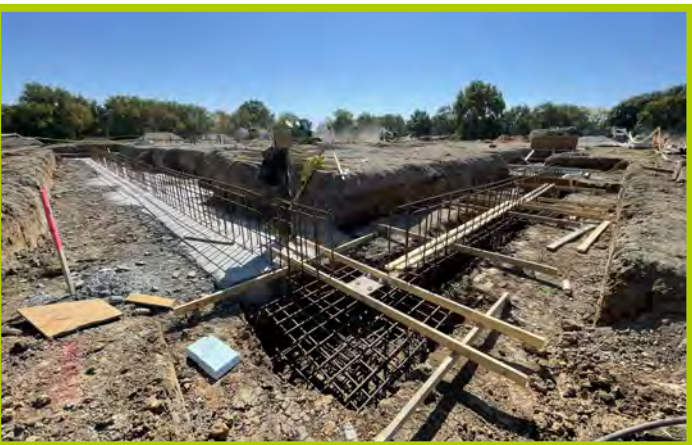
Area A Footing Pours & Stem Wall Rebar