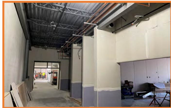
Area A Drywall Finishing