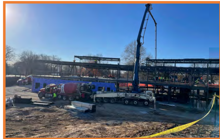
Area C - Slab-on-Deck Pours 2 & 3