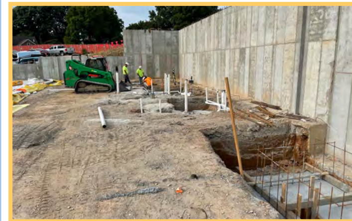
Elevator Pit Footing & Underslab Plumb.