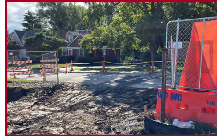
50th ST Road Closure Work Complete