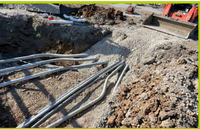
Area B Underground Electrical