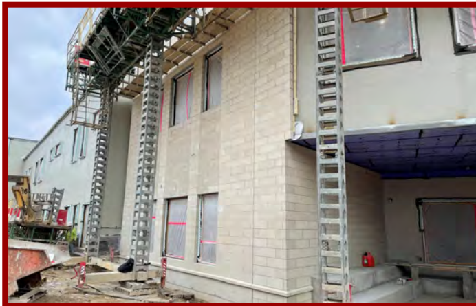
Area C Masonry Veneer Progress