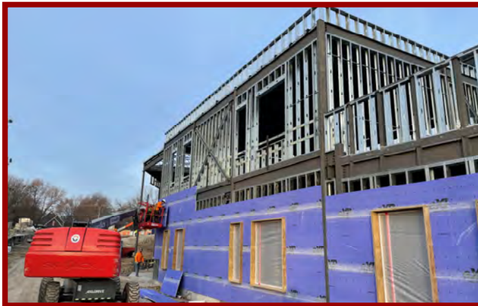
Area C - Sheathing & Temp Windows