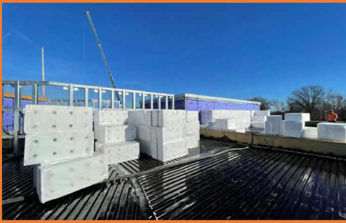
Area C Roof - Primed & Insulated