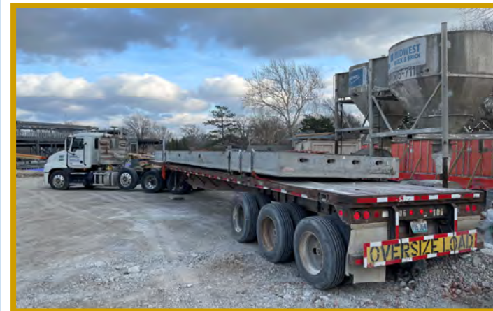
Precast Panels Delivered