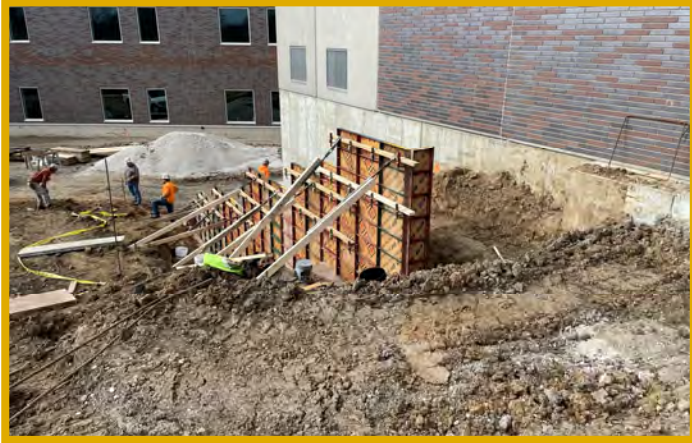
Gym Stair Pours