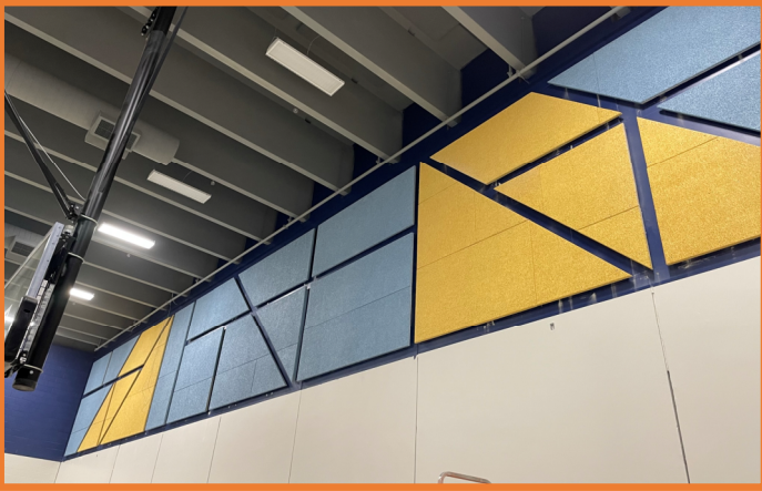
Continued Tectum Panel Installation