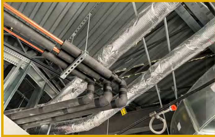
Duct & Pipe Insulation