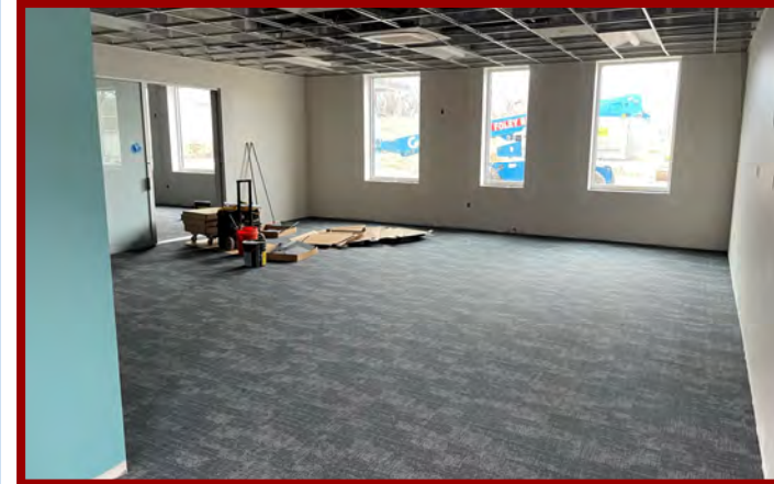
Lower Level Carpet Install