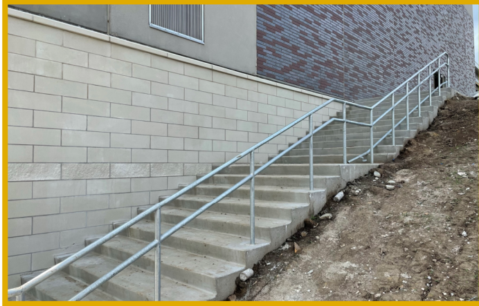
Site Stair & Ramp Rails