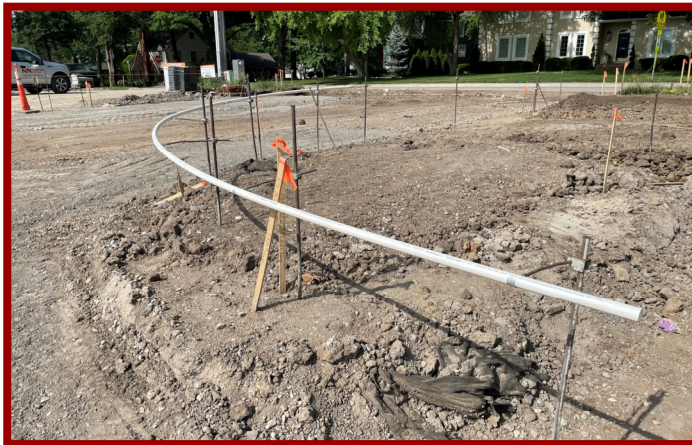
Final Grading & Curb Layout