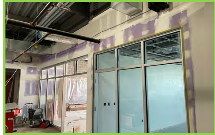
Continued Interior Storefront & Glass