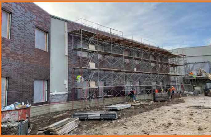
Area C Brick Veneer Progress