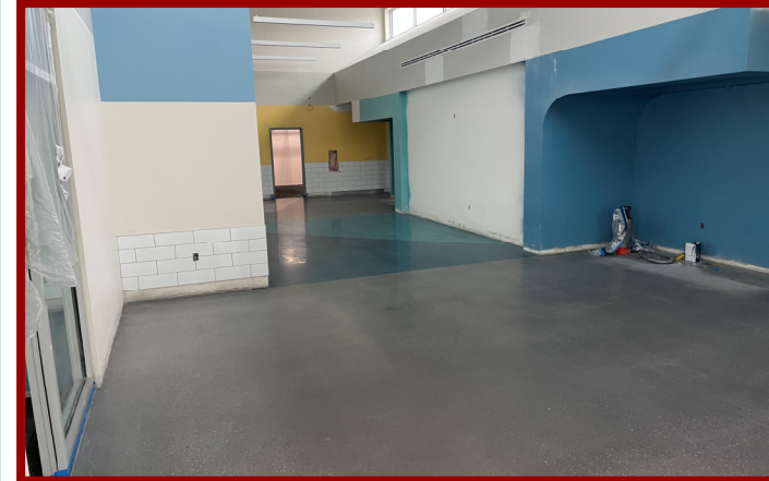
Polished Concrete - Staining & Sealing