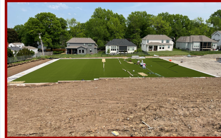
Turf Field Progress