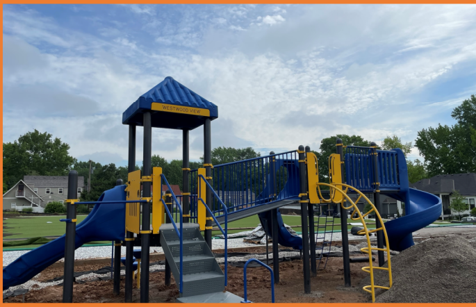
Playground Equipment Installation