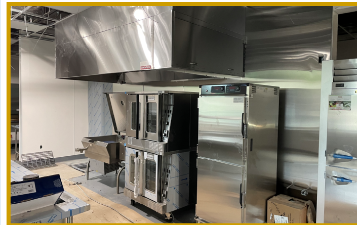
Kitchen Equipment Install