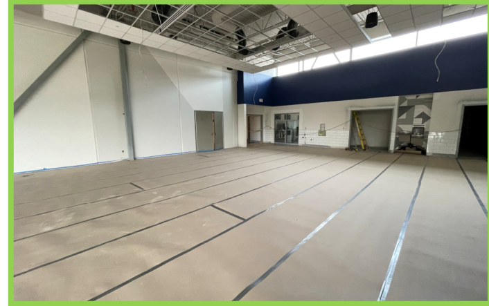
Commons Area Polished Concrete (Protected)