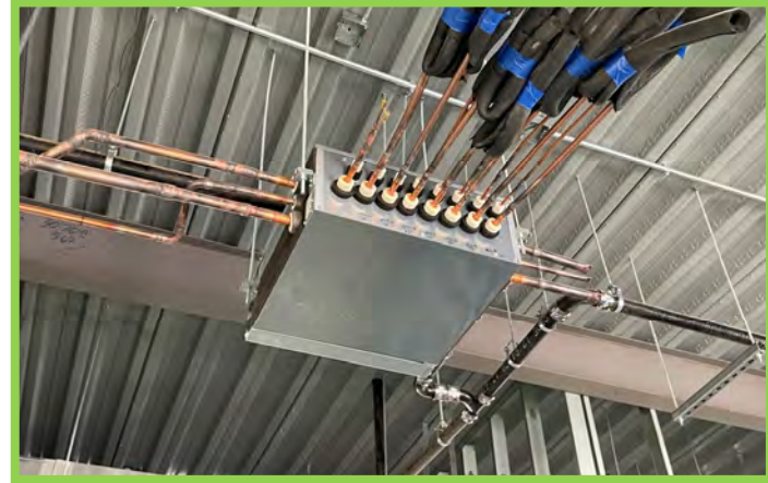
Classroom VRF Fan Coil Installation