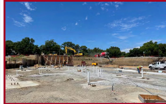
Gym Concrete Footing Pour