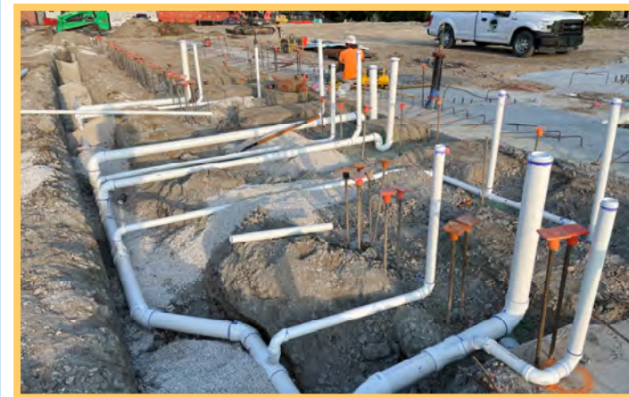
Gymnasium Underground Plumbing