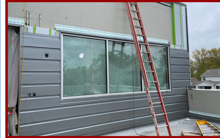
Continued Metal Panel Installation