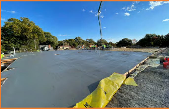
Area A - Slab-on-Grade #4 Pour