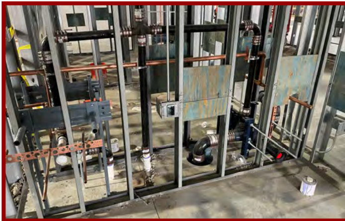
Area B In-Wall Plumbing & Electrical