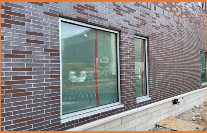
Area C - Window Frames & Glass Installed