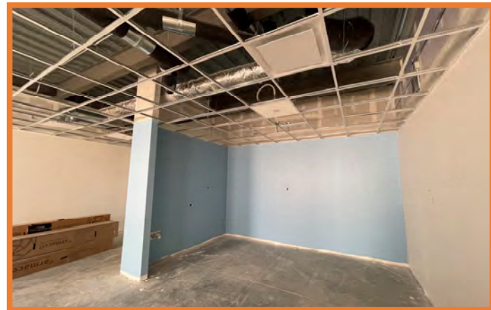
Continued Classroom Paint