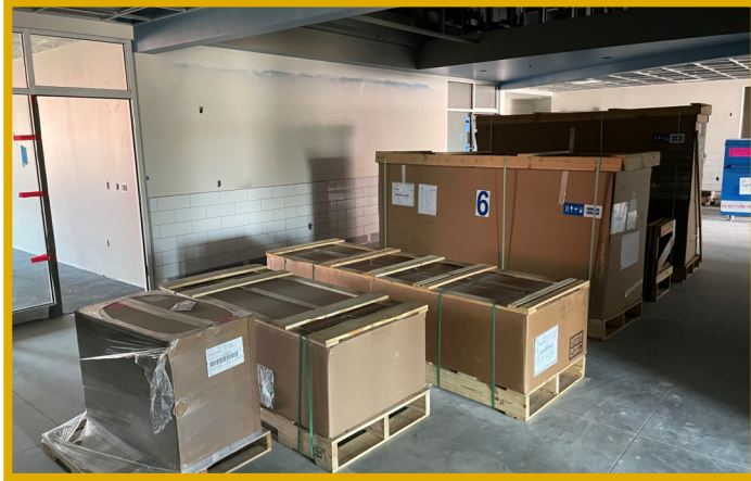
Elevator Equipment Delivered