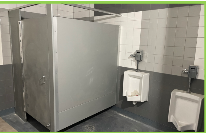
Toilet Partition Installation