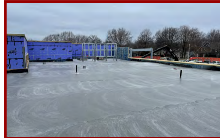
Area B Lightweight Conc. Roof Pour