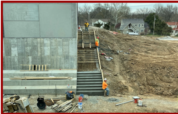
Gym Stair Pours