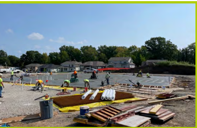
Classroom Wing - Slab-on-Grade Pour #1