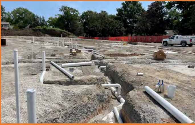
Classroom Wing Underground Plumbing