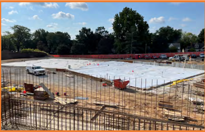
Area C - Slab-on-Grade Pour #2