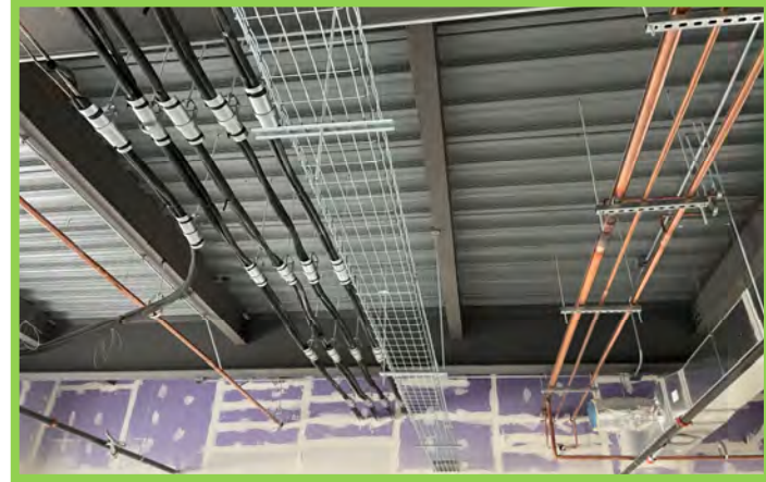
Cable Tray Installation