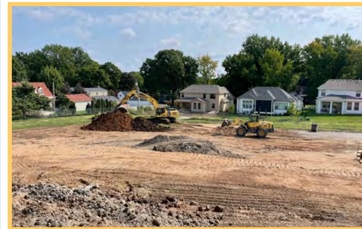
Underground Detention Excavation