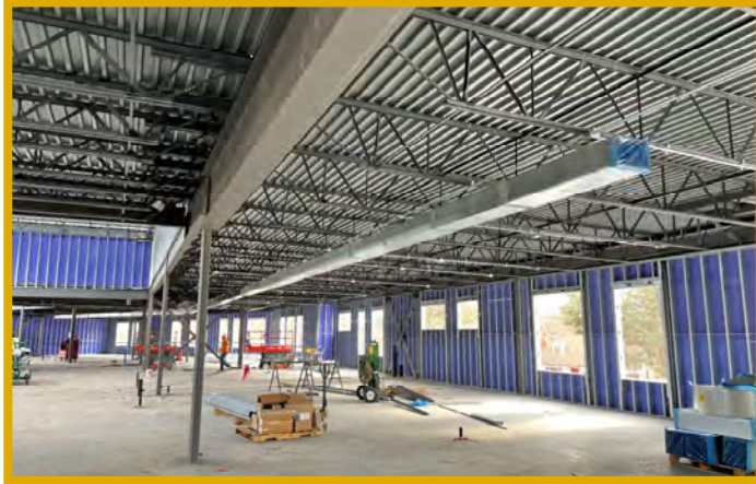
Area C Upper Level Ductwork