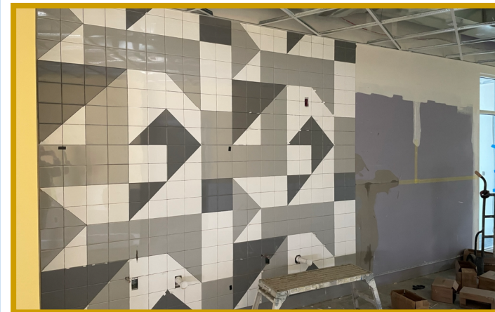
Corridor Wall Tile