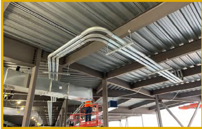
Area C - Overhead Electrical Conduit