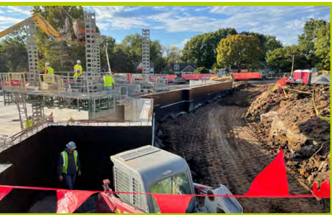
Retaining Wall Waterproofing & Backfill