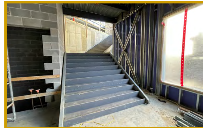
Stairs Set - Up to Main Lobby