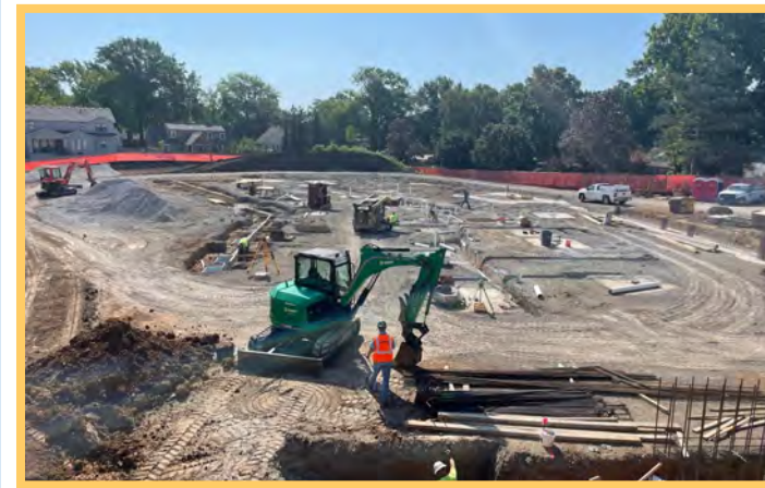
Classroom Wing Progress