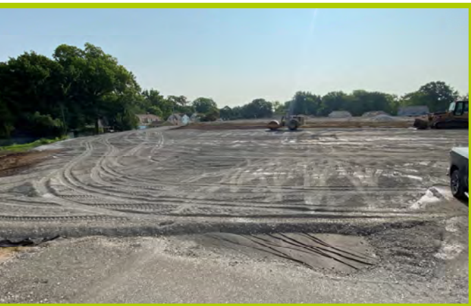
Temporary Gravel Lay Down Area