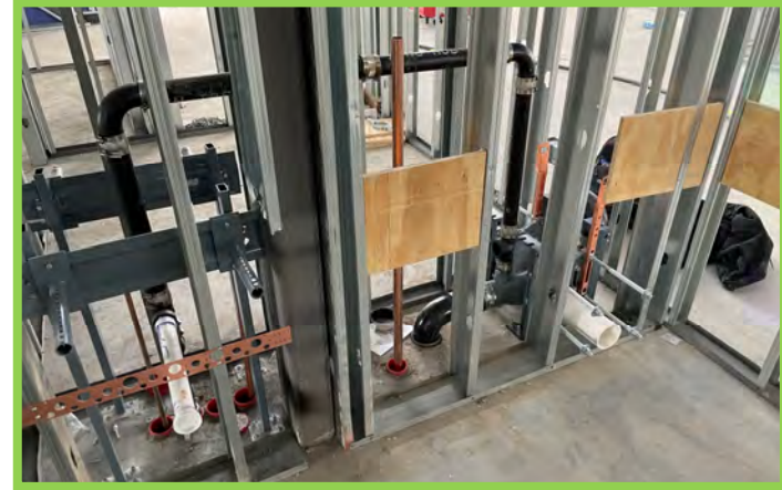
Area C Upper Level In-Wall Plumbing