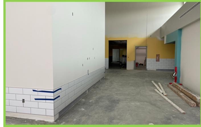
Upper Level C Corridor Wall Tile