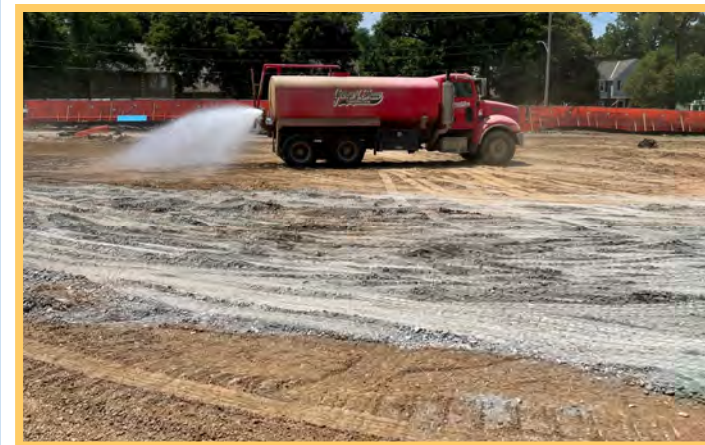
Dust Control Watering