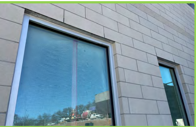
Window Frames Caulked