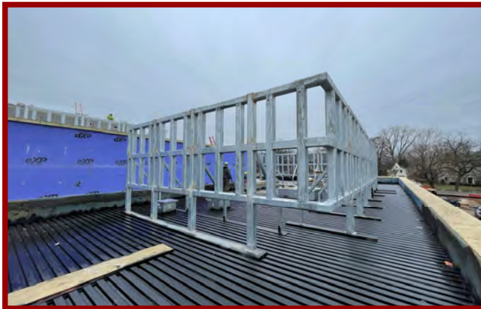
Roof Screen Framing Complete