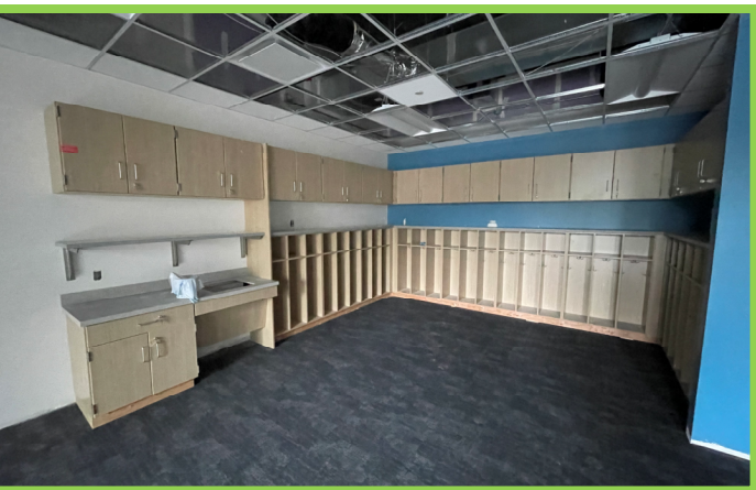
Classroom Casework & Countertops