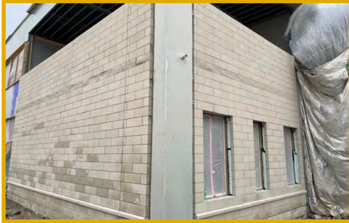
Area C Masonry Progress