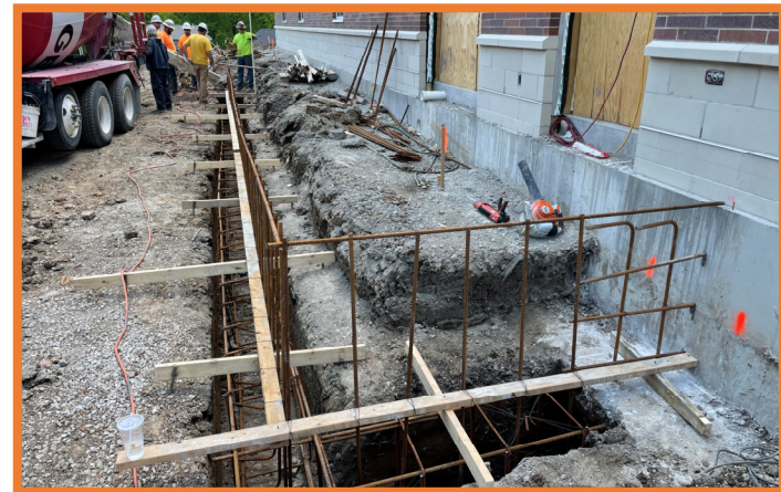
Ramp & Trash Enclosure Footings