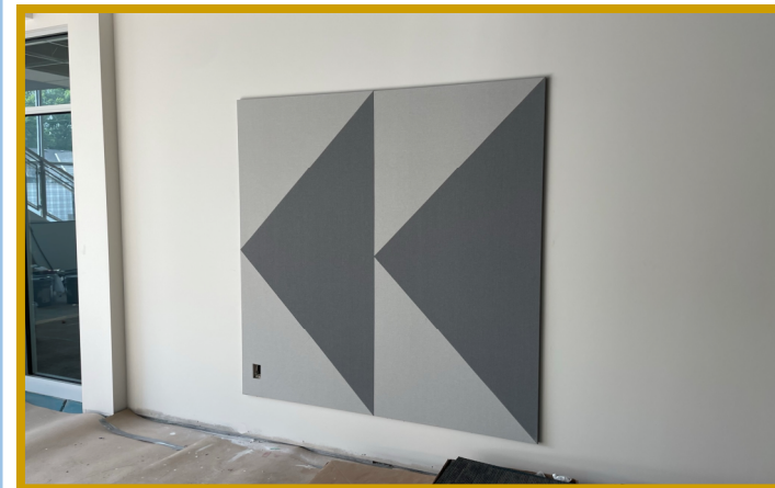
Corridor Wall Panels Installed