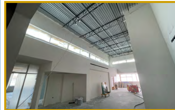
Upper Level Corridor Painting