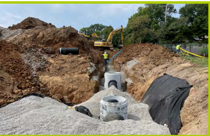
Underground Storm Sewer Piping