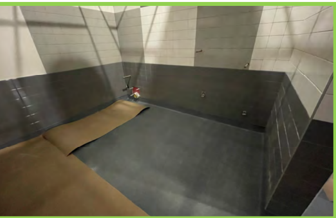
Bathroom Epoxy Flooring & Wall Tile