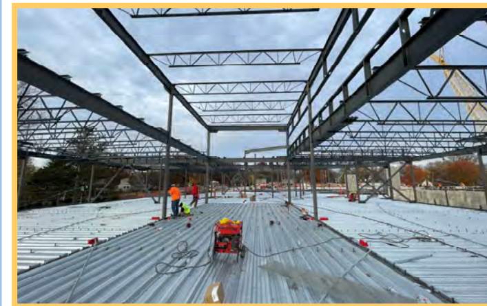
Area C 2nd Floor Steel & Roof Joists