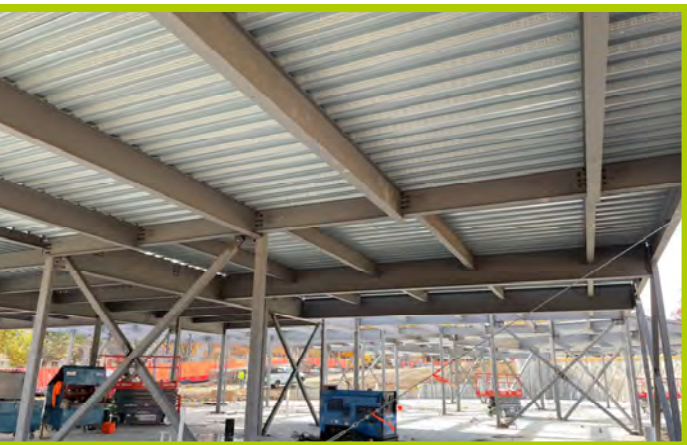
Area C 2nd Floor Metal Decking