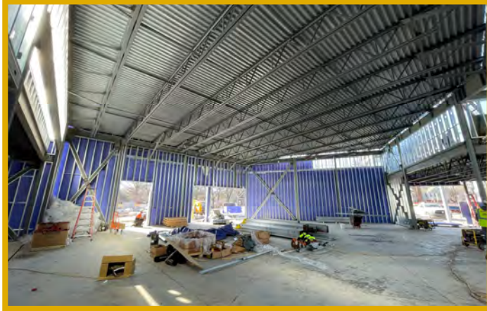
Media Center Framing & Sheathing