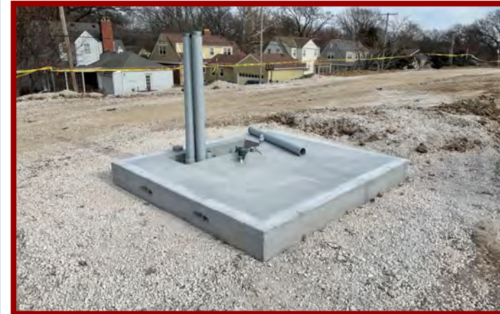
Transformer Pad Set