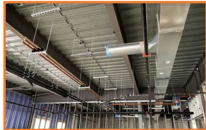
Lower Level C Copper Pipe