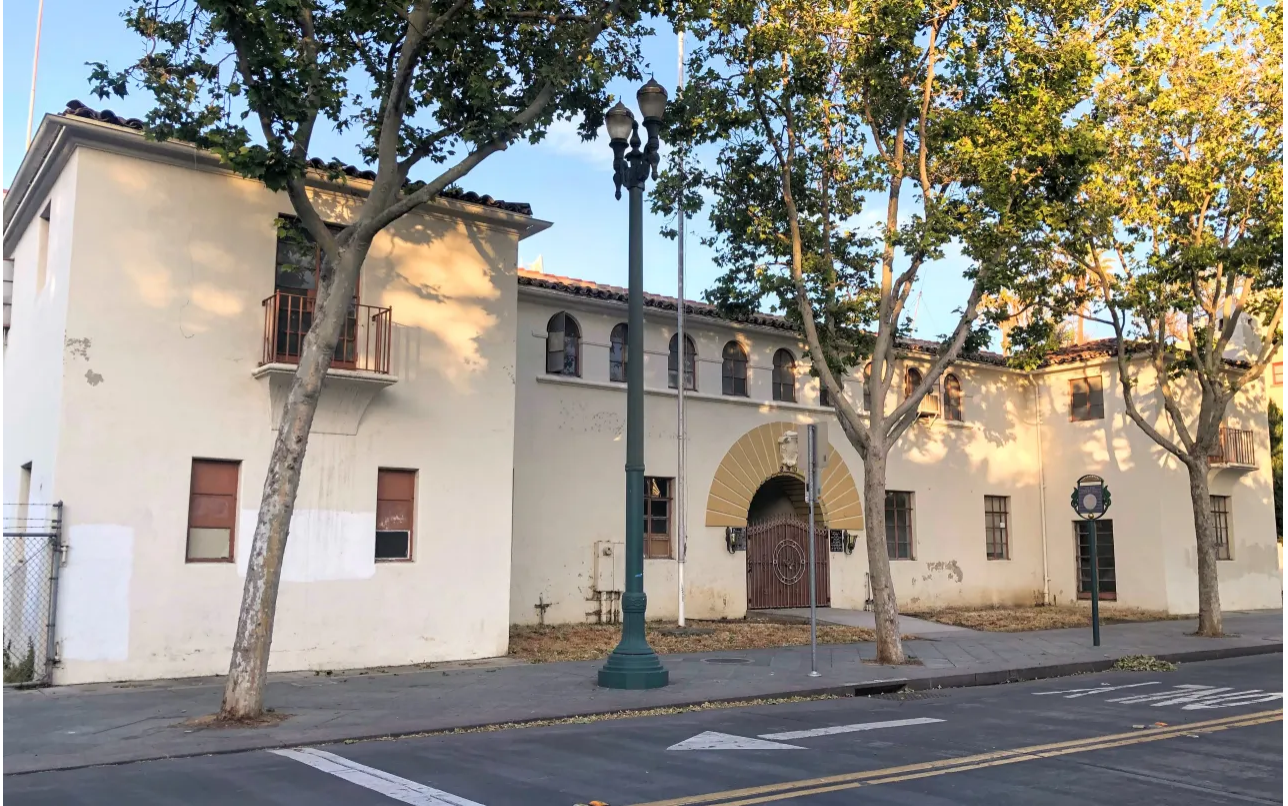
The San Jose Armory, built on North Second Street in 1933, is one of two historic downtown buildings that will be part of Hillbrook School's planned high school campus beginning in fall 2023.