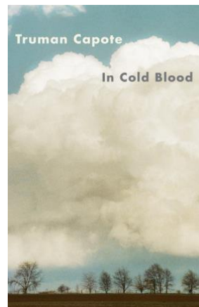
“In Cold Blood” by Truman Capote

There will be an assignment for each work that you read. You will receive these writing assignments during the first week of school. While you are reading, however, be mindful of a few things. Pay attention to the author’s STYLE. By “style” we mean observations about the mechanics of the writing: sentence structure, diction, tone, etc. Consider: What are the author’s tendencies? Do you see any patterns? Is the writing plain or imagistic? Is it literal or figurative? Does the author’s style ever shift? If so, in what instances does it do so? Be certain that you will be able to provide quotes/examples from different parts of the text. When you begin your writing assignment you will need to avoid summarizing the plot- not the themes, not the characters, not the author’s life experience. You will need to avoid personal reflection when you receive your assignment.