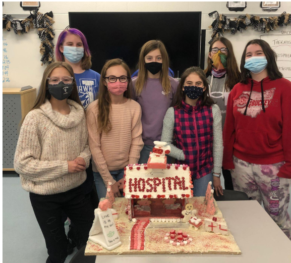
Mohawk's Gingerbread House