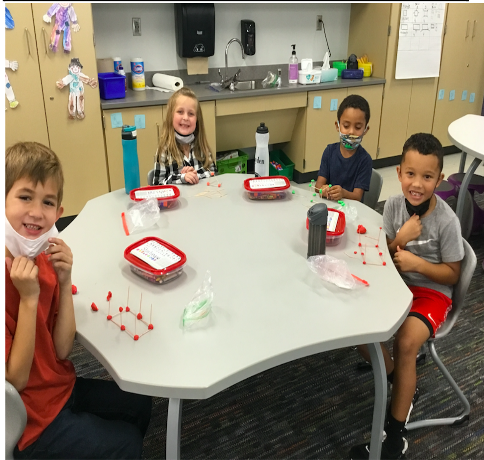
Making learning fun in kindergarten!

Parents are completely in control of their Remind accounts! You can login to Remind through the app on your smartphone or through the web at remind.com . Once you are logged in, you can change your notification preferences. You can add, remove, or edit your cell phone number and email address as well as adjust your app and desktop notification preferences via your Remind dashboard. On the web: Login to your Remind account on a computer (you will use your cell number or email to login), click your name in the upper left corner and then click on Account Settings. Select the Notification Preferences tab. Set your preferred way to receive notifications. Via Android: Log into the app on your phone. Click on the three vertical dots in the upper right corner of the screen. Click on Account. Click on the gear in the top right and choose Notifications. Via IOS: In the app, tap the gear icon in the upper left corner of the screen. Choose Push (the Remind logo pops up at the top of your screen if you receive a message), or double check your cell phone number and email address and save those preferences.