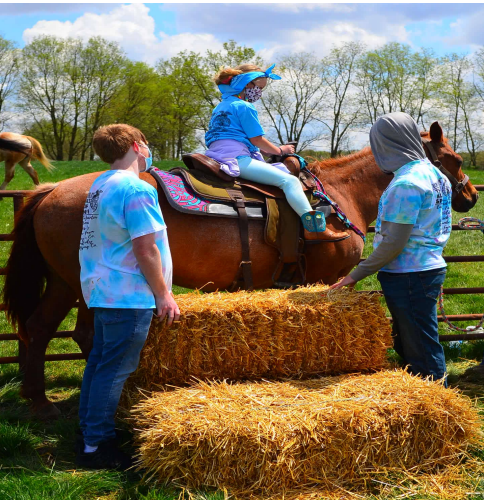
Horses, pigs, AND goats...OH MY!