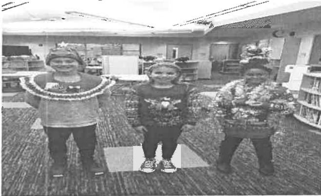
Our 3rd grade winners!