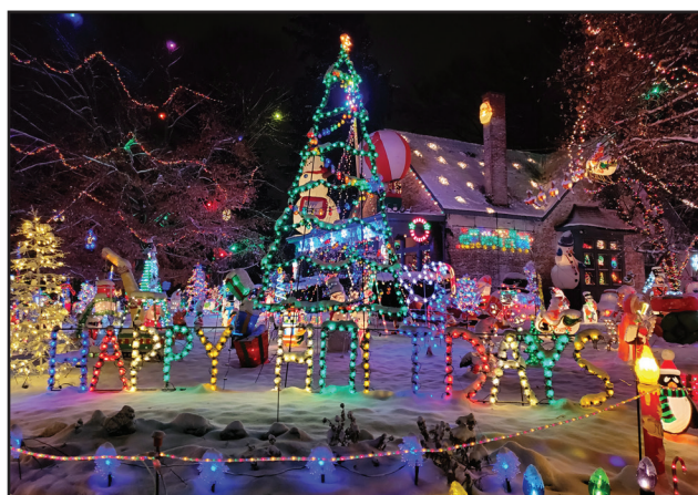
Take time to enjoy the holiday lights in and around Troy.

As we all know, a lot of teenagers are just in it for the gifts and time off of school. Christmas break provides us with time to