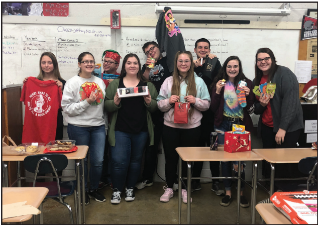
Members of the Trojan Tempo staff show off their Secret Santa gifts from this year's Christmas party.

3. FITBIT CHARGE 3 A Fitbit Charge 3 is a good gift because it is not only a watch, but it also can keep track of your heart rate and it can keep track of your steps you have