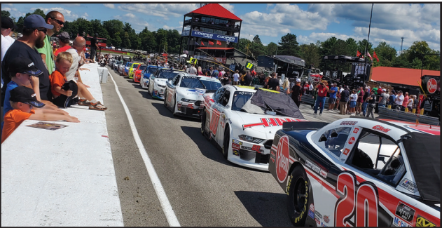
Lined up at pit row, NASCAR fans can get close to their favorite cars at the B&L Transport 170 at Mid Ohio.

The Indycar world was changed earlier this season