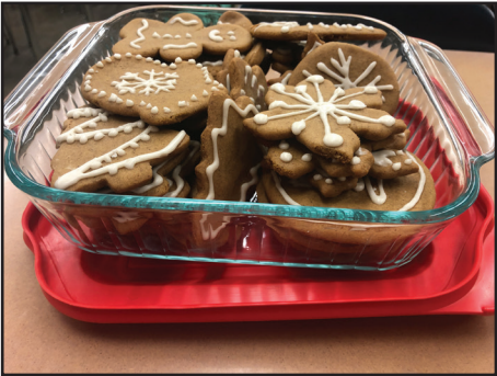
This year Ambrosia baked and decorated gingerbread cookies.

Step eight: Bake 10-12 minutes until cookies are light brown along the edges.