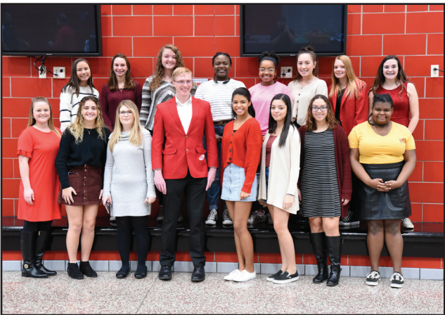
Members of FCCLA smile for a quick picture after a successful senior citizen holiday breakfast.