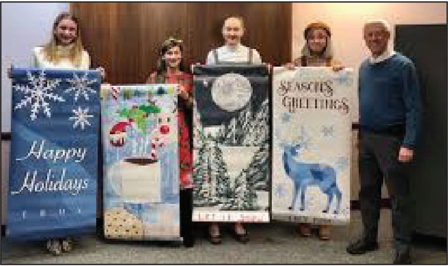
The mayor of Troy recognizes the winners in the 2019 Troy winter banner contest.

What artist are your biggest inspiration?