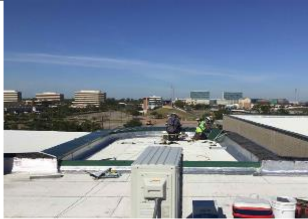
Roof work at existing side of campus is on-going