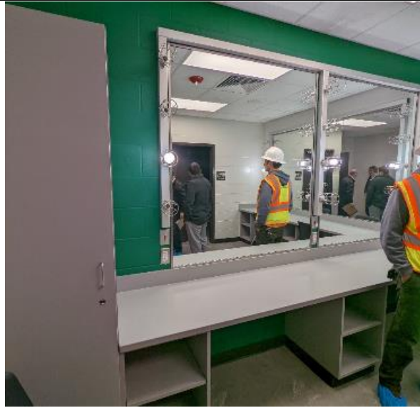
Dressing Room mirrors and lighting