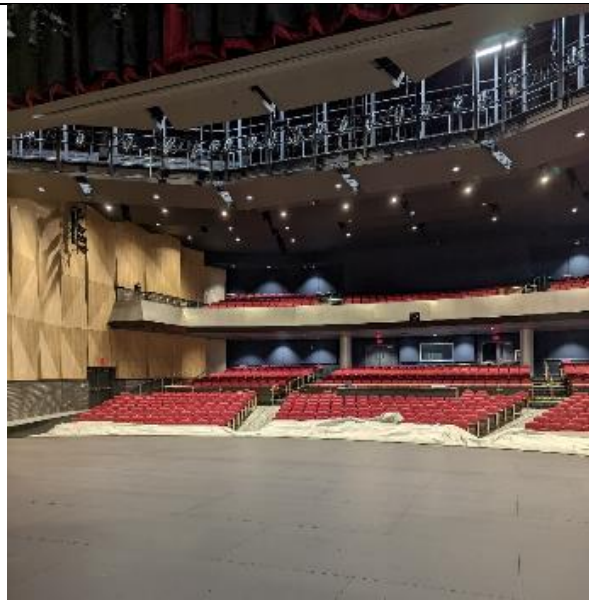
Stage floor has been repainted