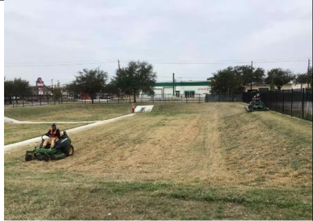
Detention pond mowing has been completed.