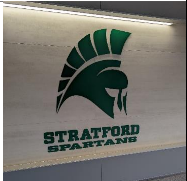
School Logo at Auditorium Lobby