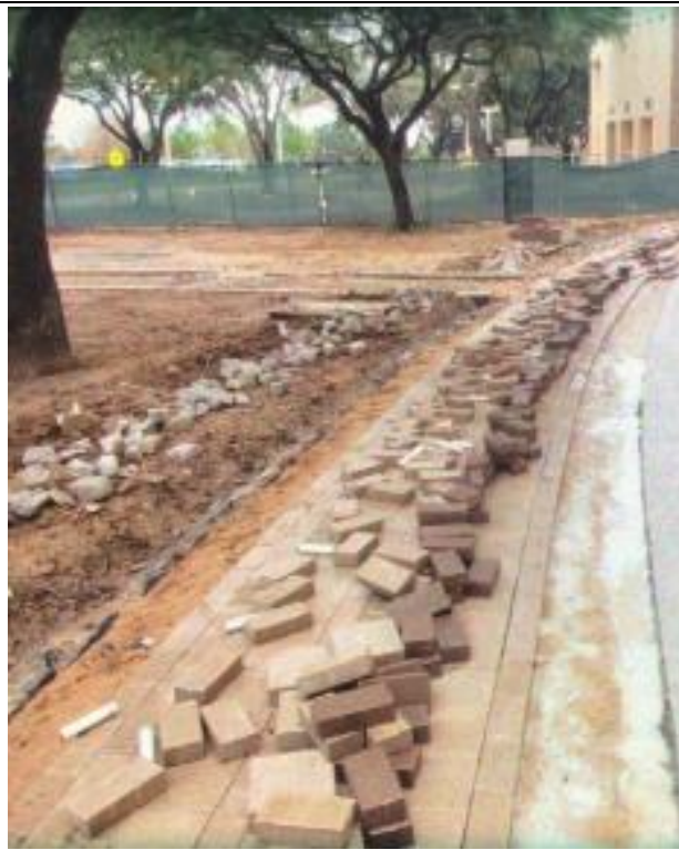
Paving at Auditorium Plaza is on-going