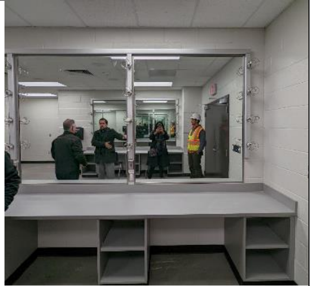
Makeup room mirrors and lighting