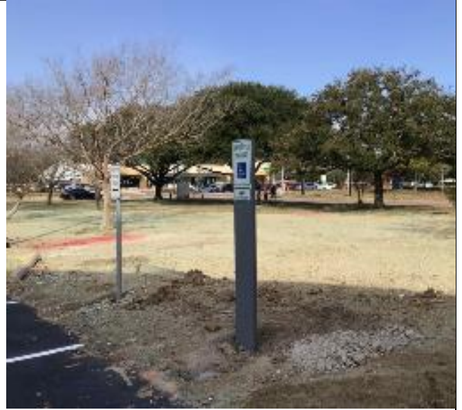
Signage at West parking lot.