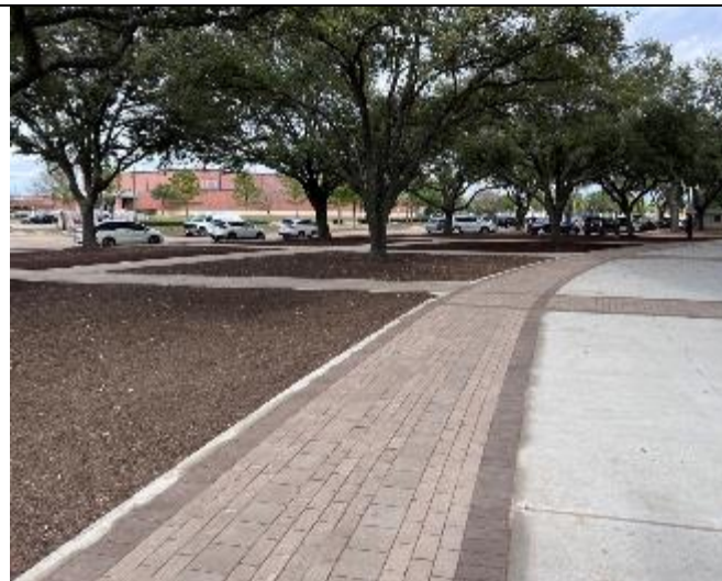
Paving at Auditorium Plaza is near completion.