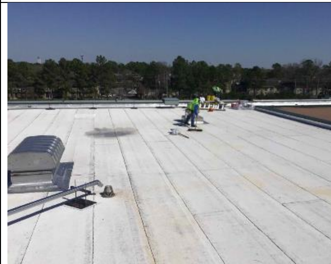
Roof work at existing campus side is on-going.