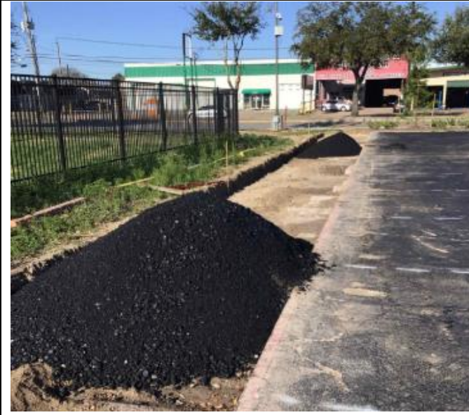
West parking lot lane being extended.