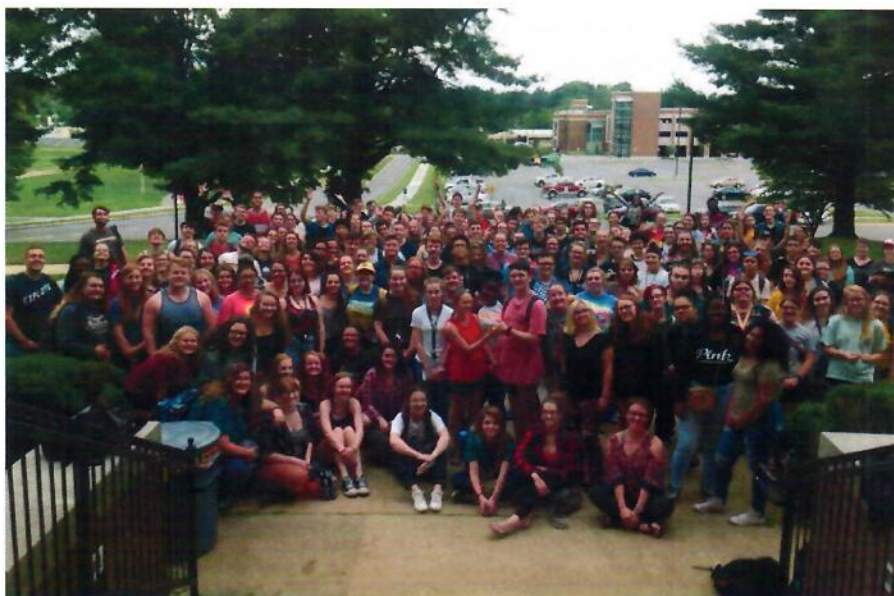
We had such a fun summer with everyone! What was your favorite part of summer?