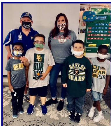
Dressed for college-bound success!

La Vega ISD's AVID program begins in Pre-Kindergarten. At the 7-12 grade level the AVID program becomes a course that students enroll in and receive support in preparing college applications, taking college entrance exams, receiving tutoring, organizational skills, and making college visits. Students who select AVID as an elective class in grades 9-12, bond and support one another socially and emotionally.