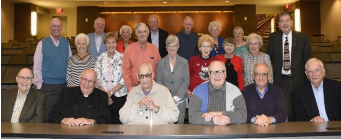
Holy Name Class of 1992 - 25th Class Reunion