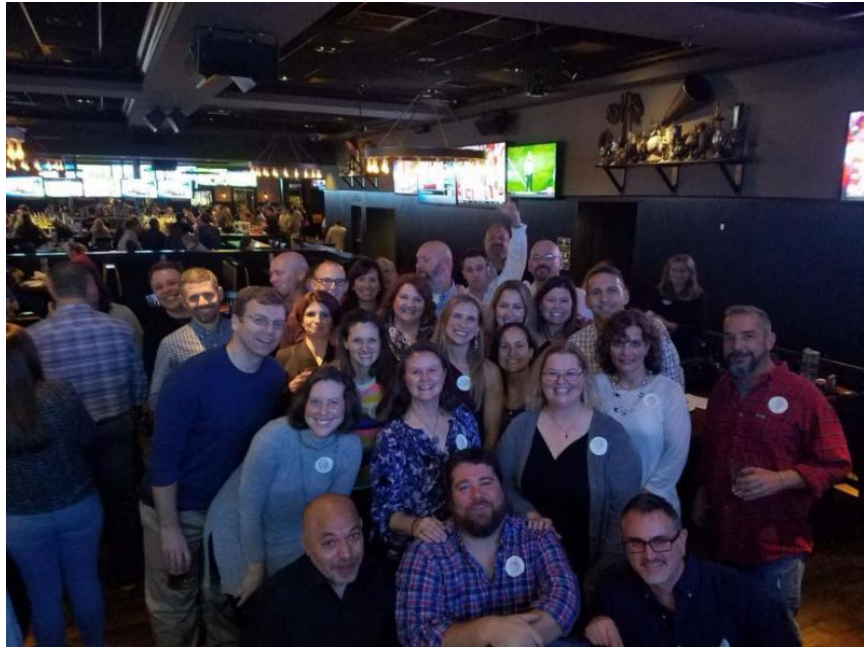
Holy Name Class of 1997 - 20th Class Reunion