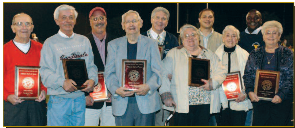
September 13 Central Catholic Hall of Fame inductees.

Hall of Fame members will forever be remembered in the halls of Berks Catholic by having their picture on a plaque outside of the Gymnasium.