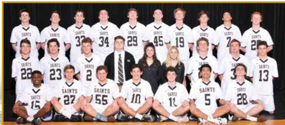
Boys Lacrosse Division Champions