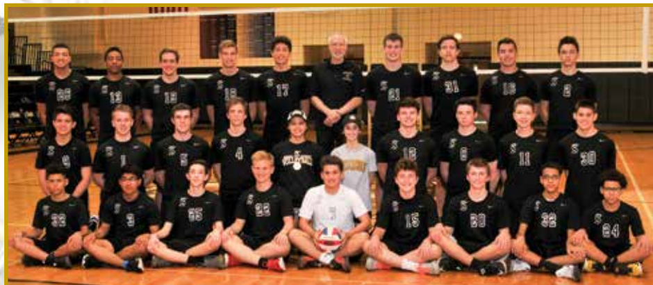
Boys Volleyball Division Champions