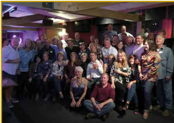
Holy Name Class of 1976 – 40th Reunion held at Third & Spruce October 1, 2016