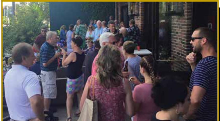
Great Turnout at Berks Catholic's Fourth Annual Alumni Get-Together at the Princeton in Avalon, NJ