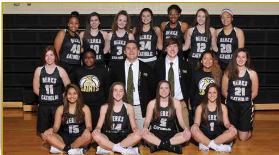
Girls Basketball, Division and League Champions