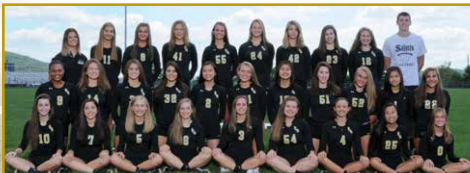
Girls Volleyball District and Division Champions