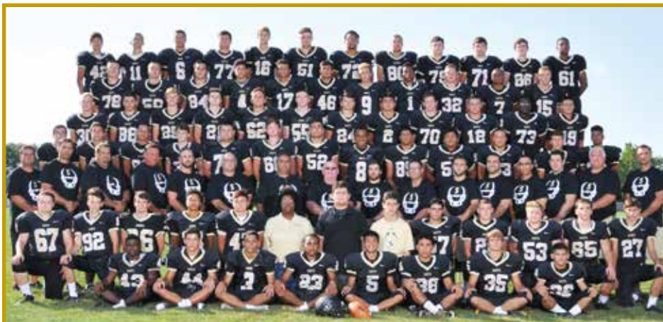
Football District, Division and League Champions