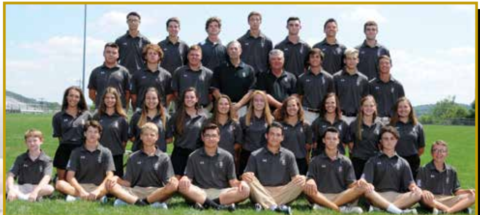
Golf Team (Girls won division title)