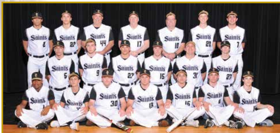
Baseball, Division Champions