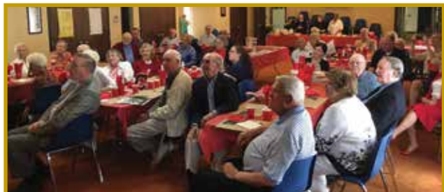
Central Catholic Class of 1947 meets every year on June 9, the date of their graduation, and this year celebrated their 70th Class Reunion. About 20 classmates gathered with additional spouses and family members at St. Paul's in Reading for Mass before reminiscing over lunch.