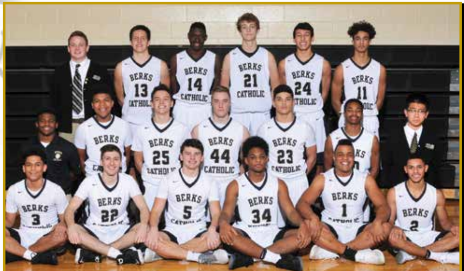
Boys Basketball Division Champions