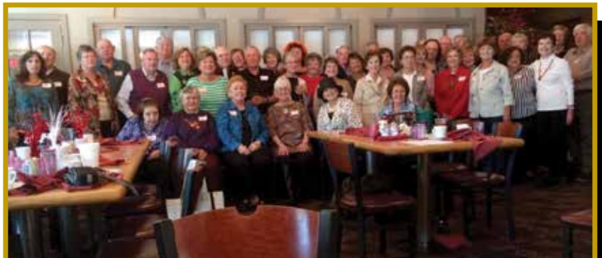
Central Catholic Class of 1956 met at Victor Emmanuel's on November 5, 2016 to celebrate their 60th class reunion.